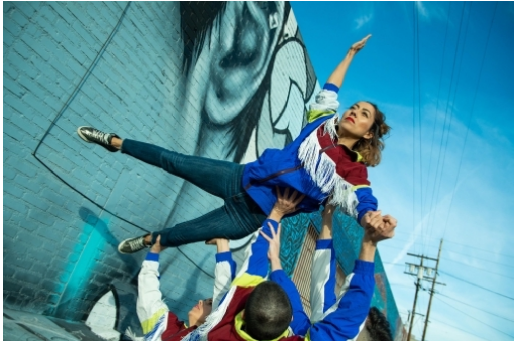
Primera Generación Dance.