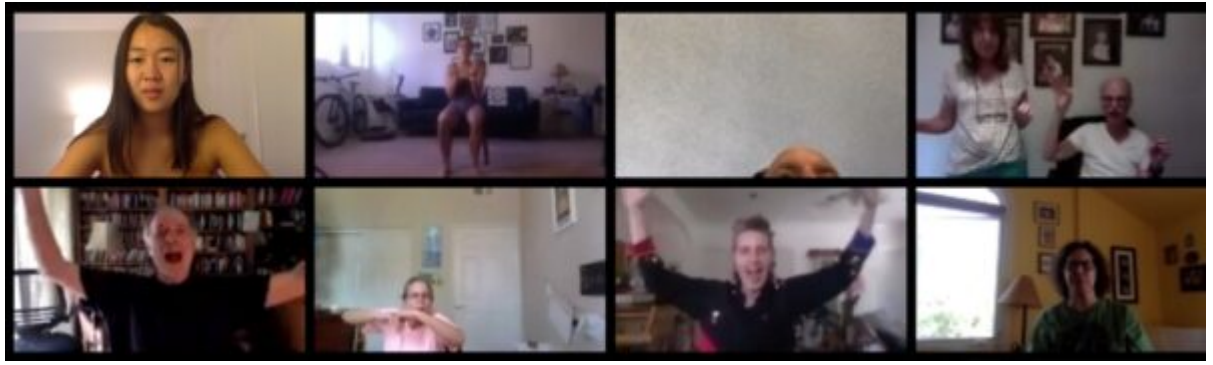
Dance classes at LA Dance Chronicle.

On-line dance classes continue on zoom, instagram and other on-line platforms, many classes free, low cost or suggesting a donation. One central, constantly updated source on dance classes and indepth reporting on SoCal dance, LA Dance Chronicle lists on-line dance classes including any cost and contact info. Grab a chair or clear off a corner of the room and use this time to dance. LA Dance Chronicle.