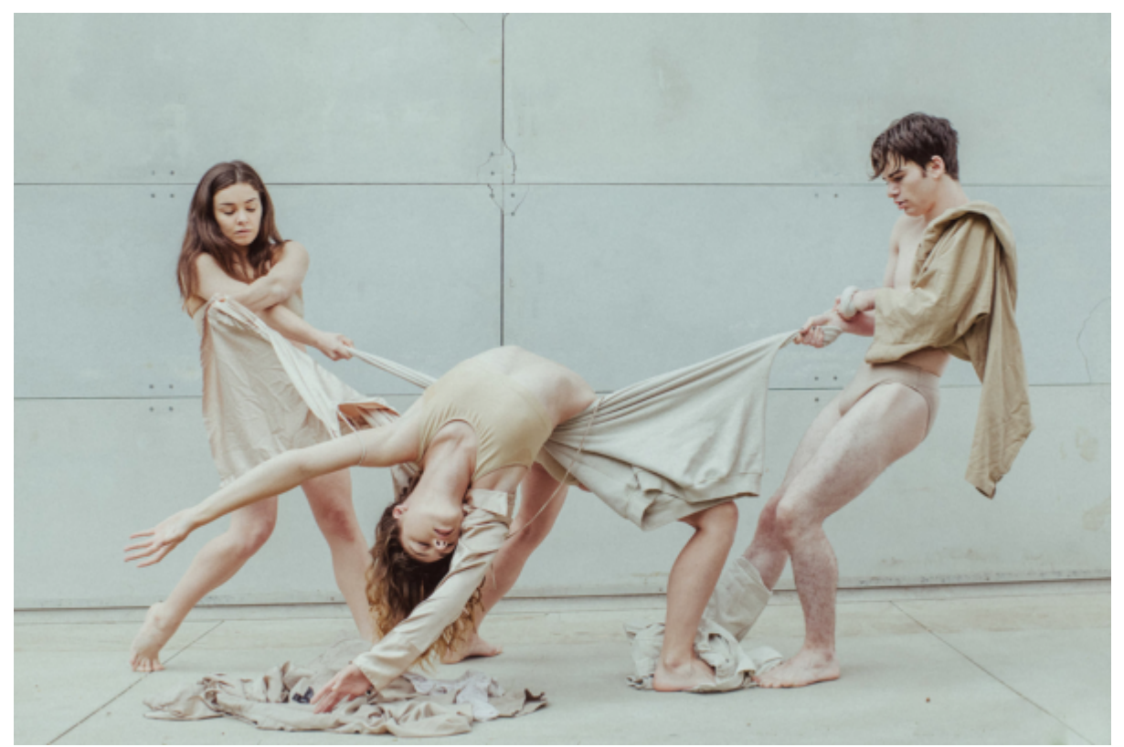
CalArts Spring Dance Concert.