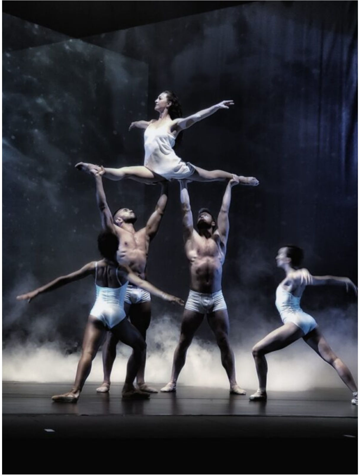
Luminario Ballet.