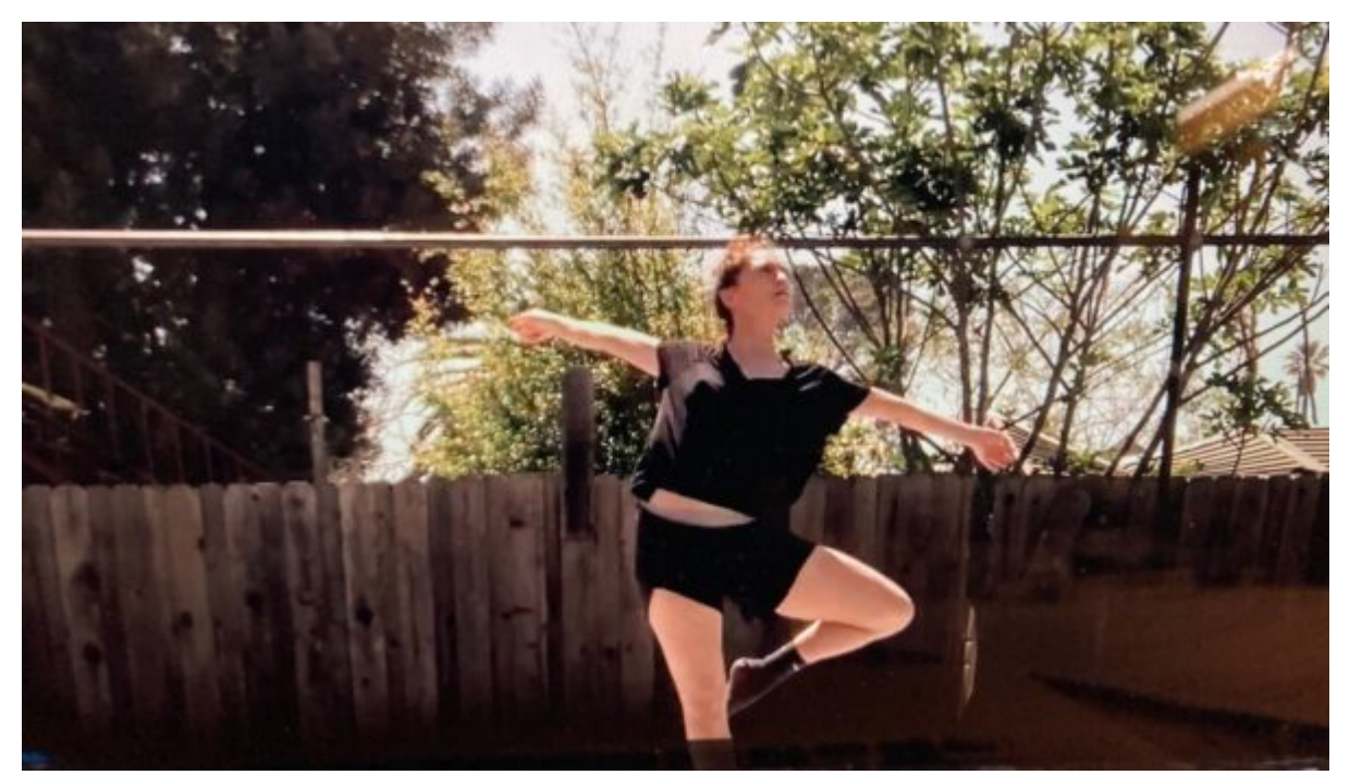
Rosanna Gamson /WorldWide "The Decameron Project."