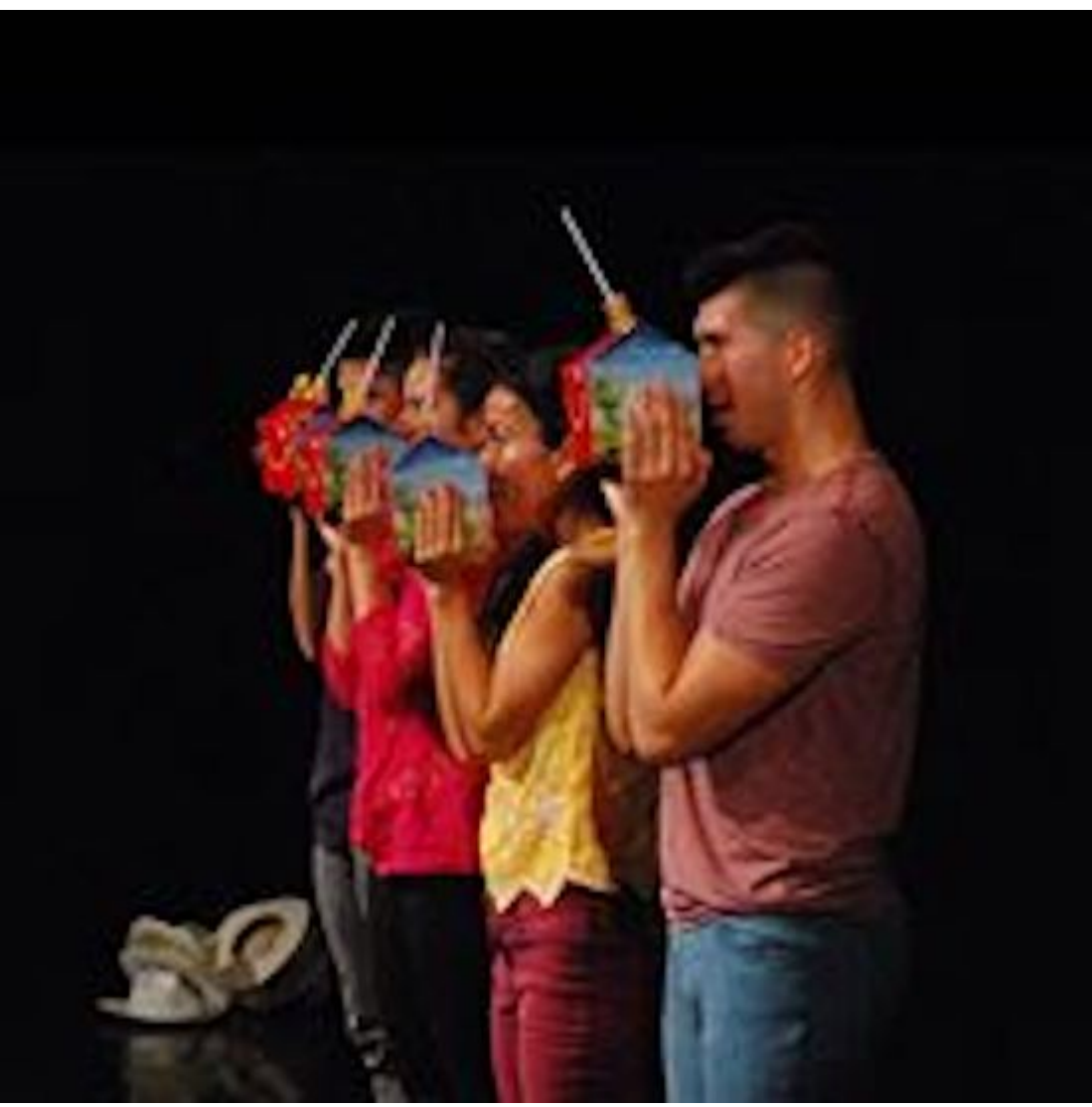
Primera Generación Dance Collective.

Masked in an alley, garbed in white hazmat suits, or swiping at a piñata, the Riverside-based quartet of movers Primera Generación Dance Collective reprise Nepantla . Premiered last year at CalArt's REDCAT NOW Festival, the troupe worked with videographer Leo Rival in their latest consideration of the Mexican American experience. Access until Sun., May 2, at 11:59 p.m. PDT, $10. Eventbrite.