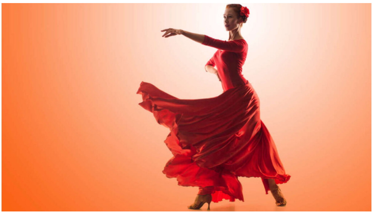
Cafe Sevilla.

Flamenco dinner shows return as the Costa Mesa branch of Cafe Sevilla once again offers live dance shows each Saturday. No announcement about when the shows will also return to the cafe locations in Long Beach and San Diego. ongoing Sat., 6:30 p.m., $89.50 (plus tip, tax & surcharge). Cafe Sevilla.