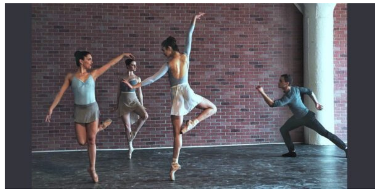
LA Dance Moves.