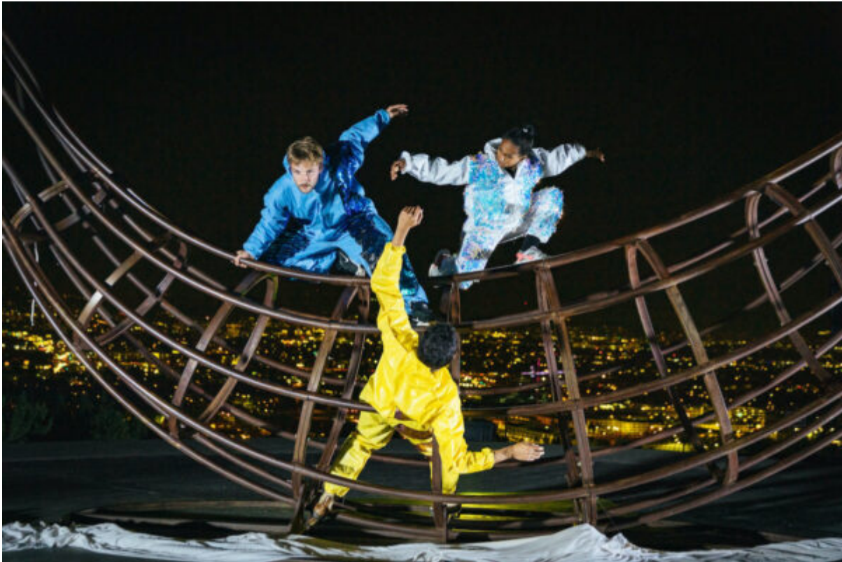
Heidi Duckler Dance.