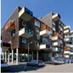
Dwelling for Seniors, Amsterdam, 2016. MVRDV Architects.