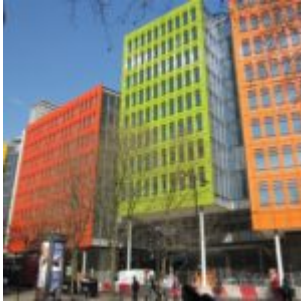
CentralSt. Giles Court, 2010, Renzo Piano and Fletcher Priest Architects.