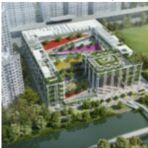
Oasis Terraces, Singapore, 2019. Serie and Multiply Architects.