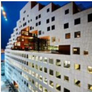
Mixed-use Building, Oslo, A-Lab Architects