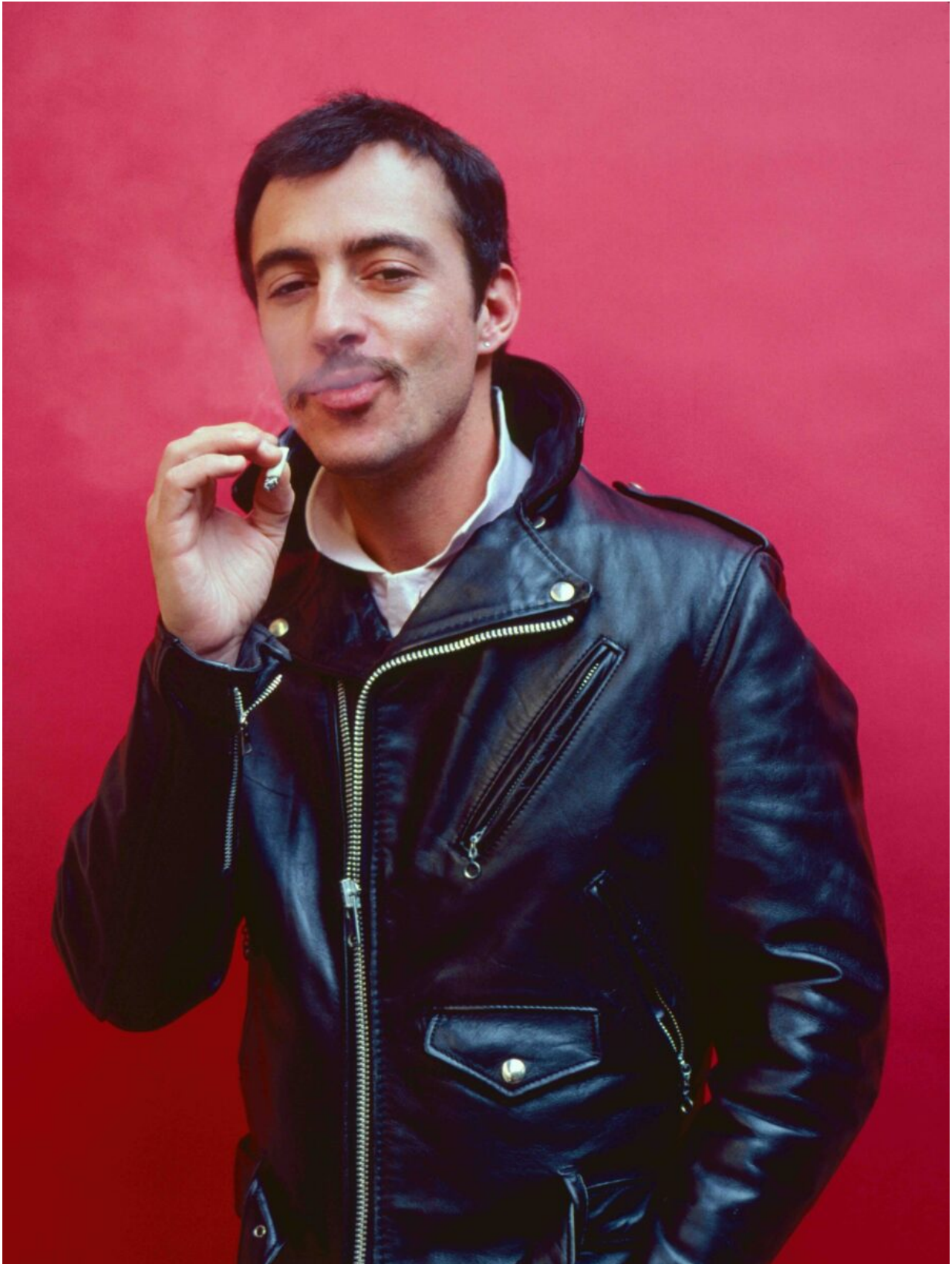
Ray Sharkey