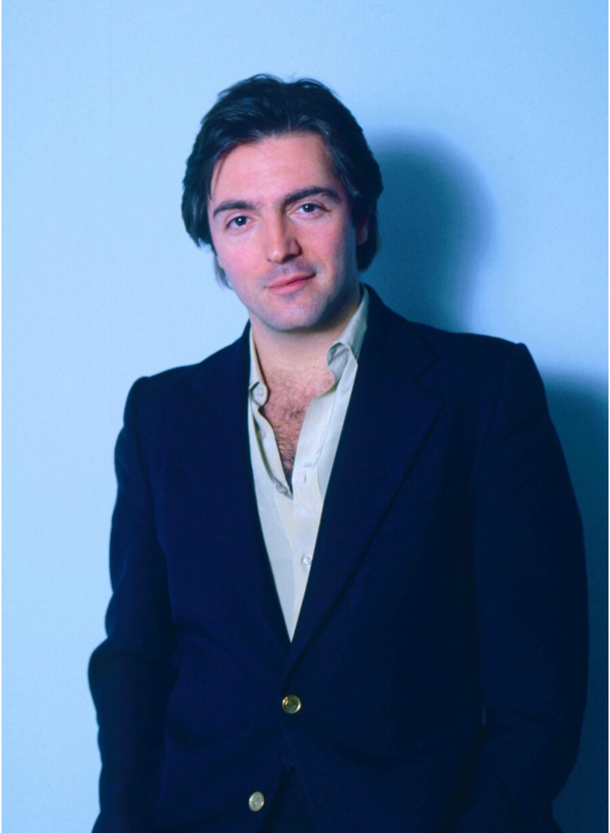
Armand Assante

I met Armand Assante in November 1980 during an exclusive interview for the journalists of the Hollywood Foreign Press to talk about Private Benjamin , a comedy starring Goldie Hawn. I knew he had played Sophia Loren's father in a TV movie, so I asked him about it and he refused to answer, which intrigued me and made want to know more. So I requested a private interview and photo session, which was granted for a week later. Those were the good old days when photo-