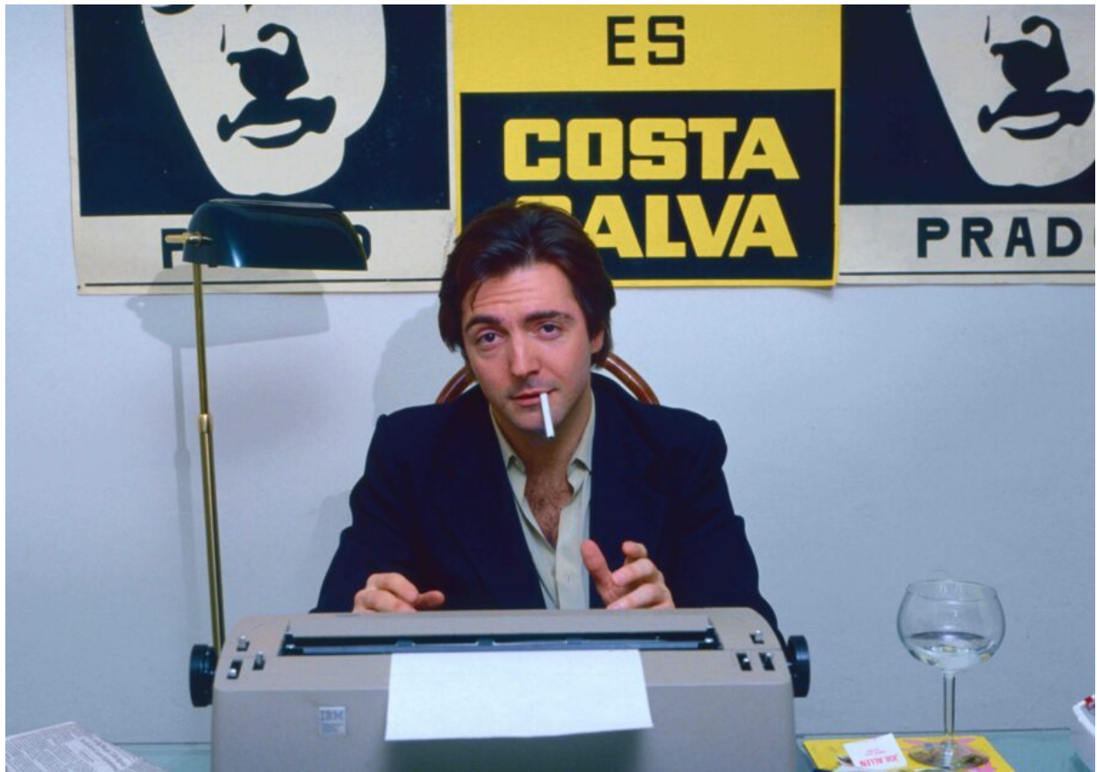
Armand Assante