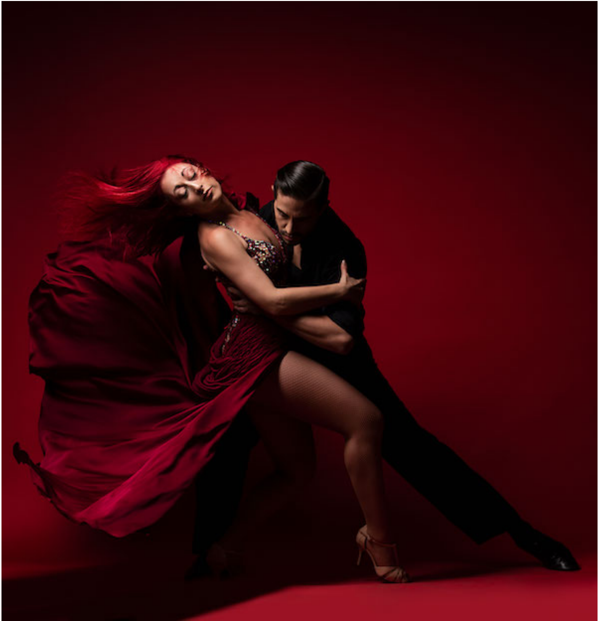
Tango Argentina.