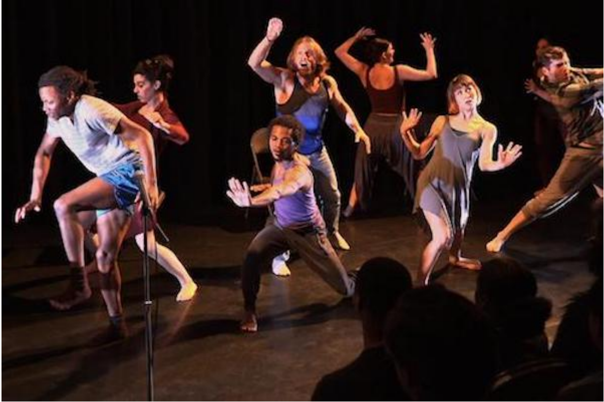
e-Motion Theatrix.