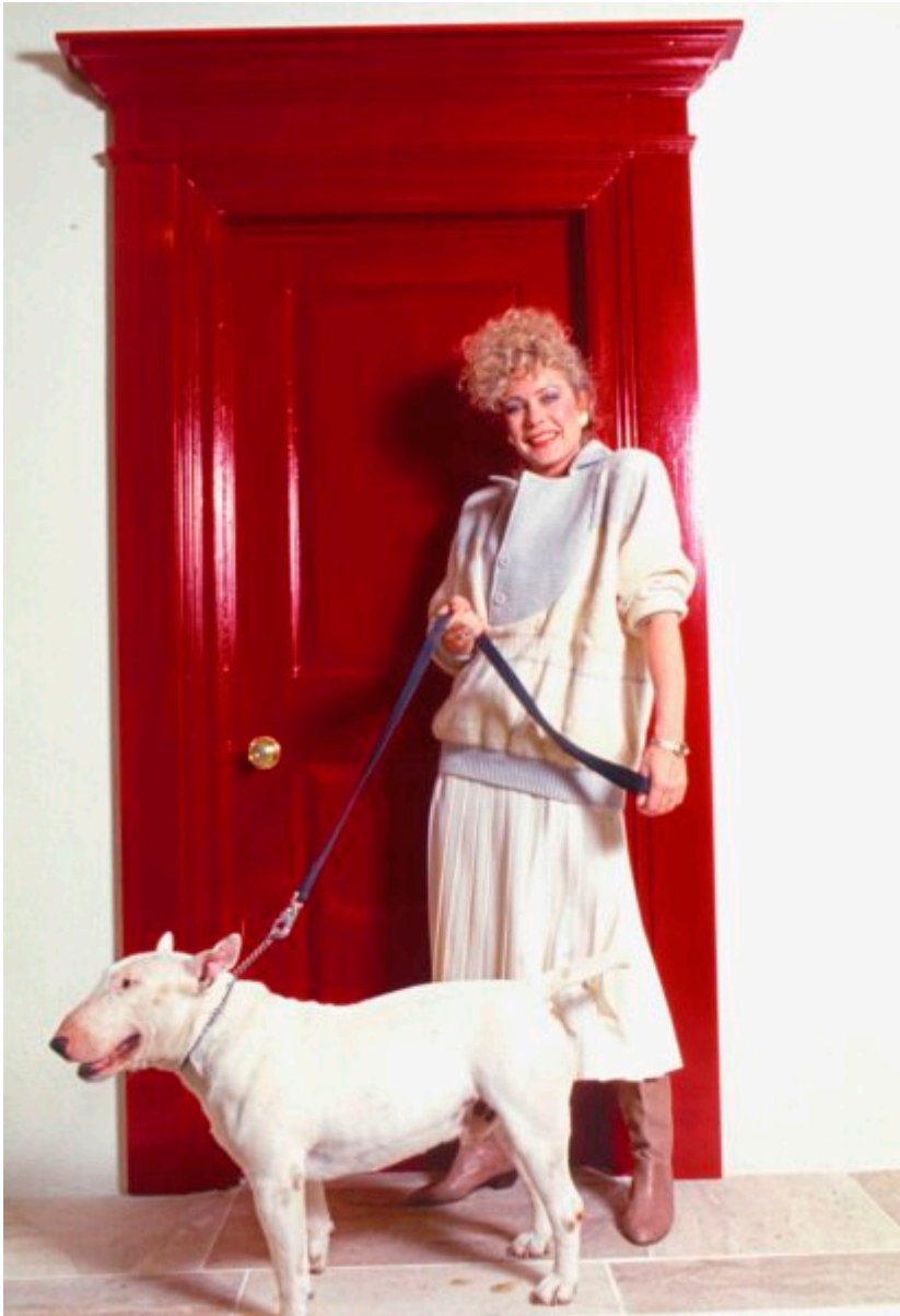
Cassie Yates