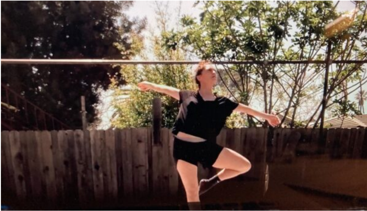
Rosanna Gamson/World Wide.

Plague , what could be more appropriate pandemic source material than Boccaccio's Decameron with tales from ten strangers sheltering from the bubonic plague? Just as the tales of the ten travelers unfold one at a time, Gamson's The Decameron Project rolls out ten films, each made by a different artist. All ten episodes are now live and viewable for free on RGWW and on Instagram .