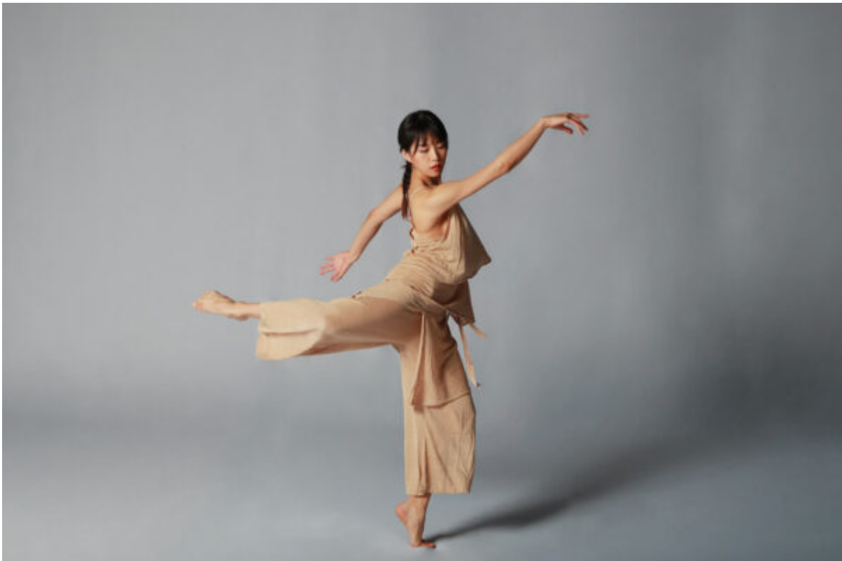
Films.Dance.