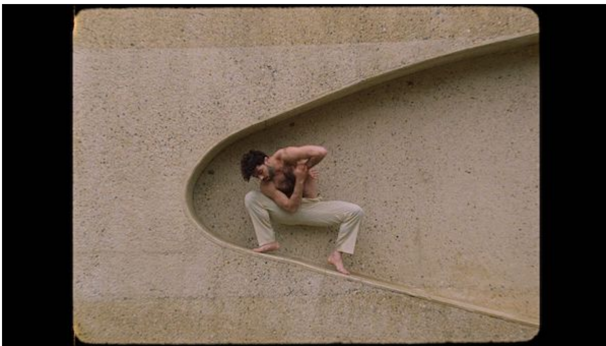
“Films.Dance Round 2.”