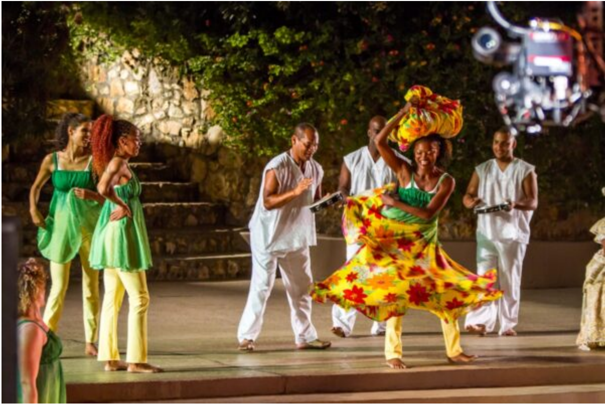
Viver Brasil.

music. Free at Viver Brasil . The ensemble also is part of KCET's Southland Sessions streaming at KCET .