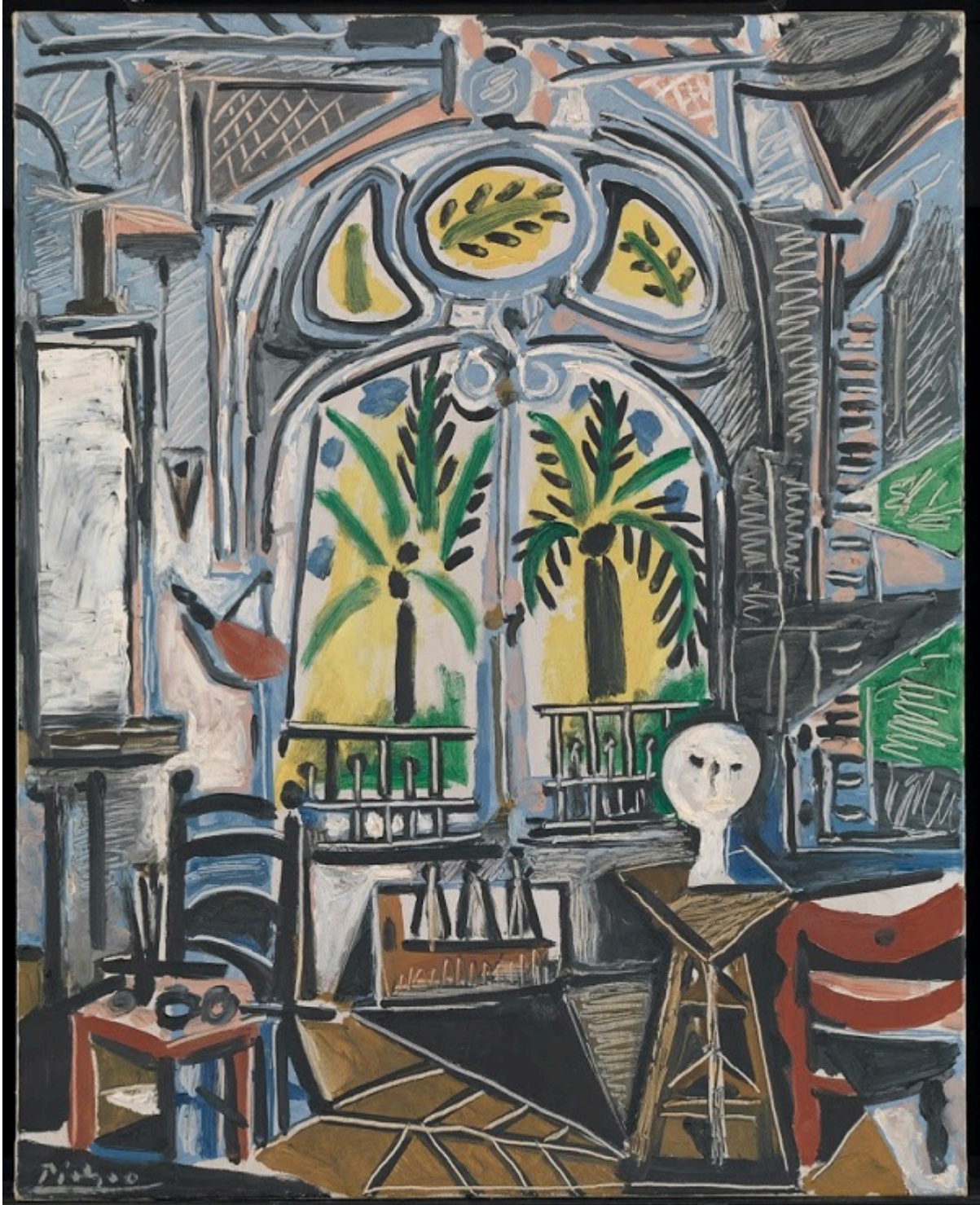
Pablo Picasso, The Studio , oil on canvas; Tate, © Estate of Pablo Picasso/Artists Rights Society, New York.

Throughout the show, the co-curators seek to make connections. Along with the acrobats, for example, there are paired paintings of the artists' studios, each completed in 1955 and crammed with works in progress. Picasso's version features an airy space looking out onto the palm trees of the south of France, with a blank canvas mounted on an easel and a slightly creepy sculpture of a white head sitting on a wooden table.