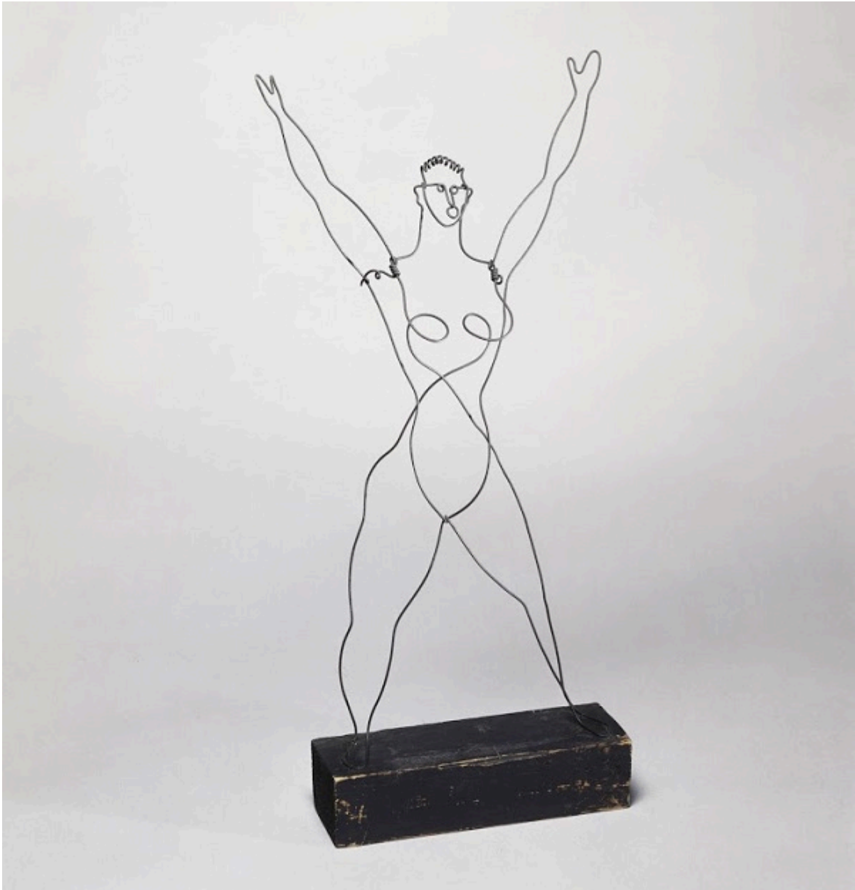
Alexander Calder, Acrobat , 1929, wire and wood; © Calder Foundation, New York, promised gift of Holton Rower; photograph by Philip Charles.

Which may explain why the show is called “Calder-Picasso” and not the other way around. Calder’s wire sculptures from the 1920s and 1930s, for example, are a revelation. “Acrobat,” made in 1929 from what appears to be a single length of twisted wire mounted on a wooden base, depicts a muscular, nude woman raising her arms triumphantly above her head. It’s a sculpture that looks like a drawing. It’s both solid and empty, and it’s a masterpiece of concision.