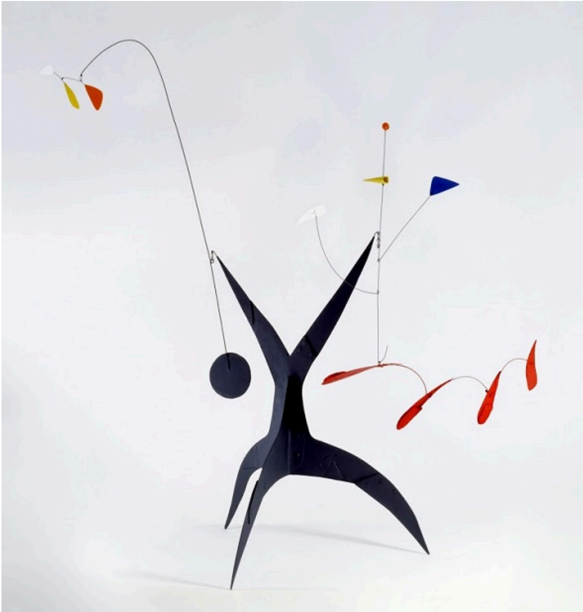
Alexander Calder, Untitled , c. 1942, sheet metal, wire, and paint

For Calder, the main attractions are the mobiles. An untitled work from about 1942, above, features a black sheet-metal base with three legs and two upraised arms, a pose reminiscent of his wire Acrobat . Each arm holds its own wire mobile with red, yellow, blue, black, and white discs attached. The cluster of four elongated red plates on the lower right remind you of a school of fish, while the upper part evokes a sketchy tree. The long wire arm on the left balances a circular black plate against three smaller triangular discs in red, yellow, and white. It all hangs together in perfect balance, both visually and physically.