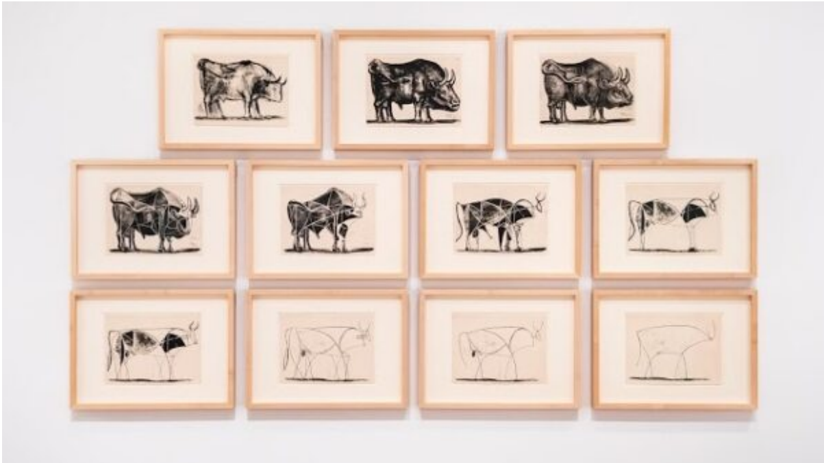
Installation view of Picasso's The Bull series, 1945-46, 11 lithographs on woven paper; Fundacion Almine y Bernard Ruiz-Picasso para el Arte, Madrid; photograph by Gary Sexton.

Other Picasso highlights include a fine series of 11 lithographs of a bull — ranging from a brawny, realistic portrait of the animal to a barely sketched abstraction — and a sculpture of a bull's head cast from a bicycle seat and handlebars. Yet many of the other works seem less inspired, something he knocked off in an afternoon, more decorative than thought-provoking.