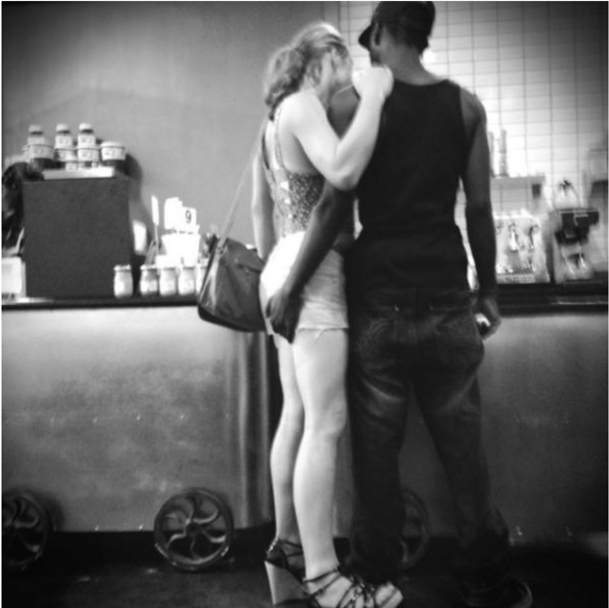
Spring St. Arcade