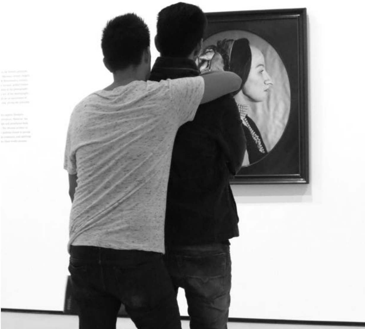
The Broad Museum