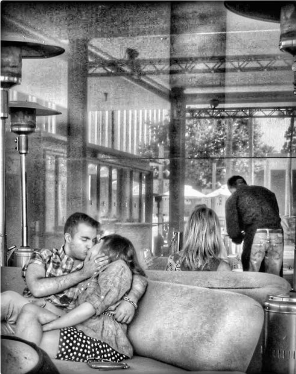
LA County Museum