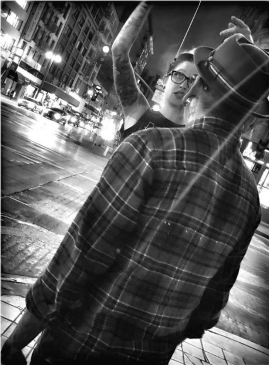
7th and Olive