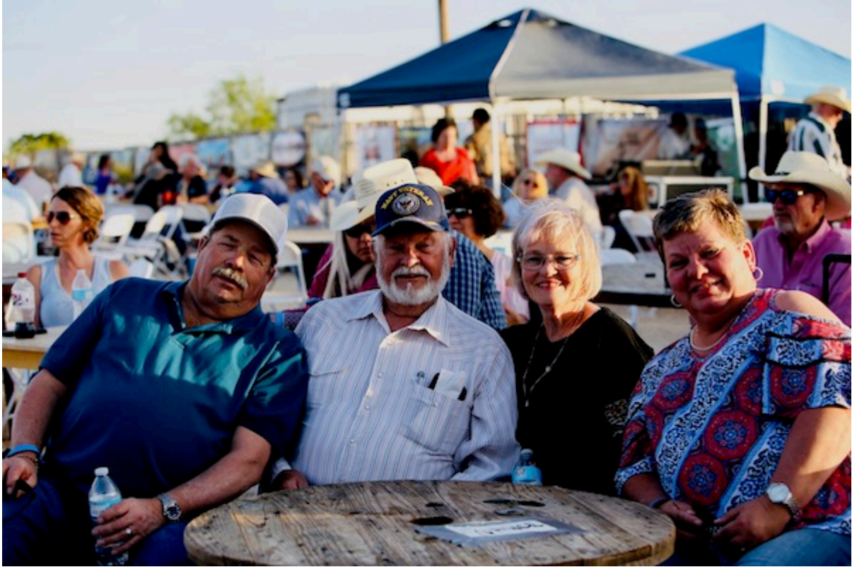
Delightful guests of the “Sold-Out” Moe Bandy Concert on May 18, 2019 in the “backyard” of The Coyote Store.