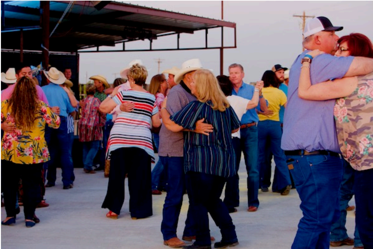
The Coyote Store concert crowd have livened up the dance floor just in time for Moe Bandy to arrive.