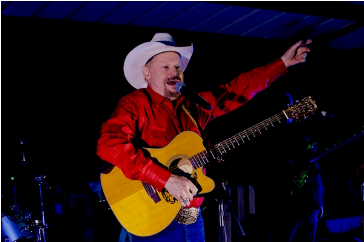
Moe Bandy hits the stage at The Coyote Store. Mr. Bandy signed with Columbia Records in 1975 and his first release “Hank Williams You Wrote My Life” soared in the charts. He quickly became the “Academy of Country Music Most Promising Male Vocalist” in 1976, and the rest is history. (Source: https://moebandy.com/awards-songs/ ). His accomplishments can fill a country music history book. With so many wonderful songs to note, the crowd went wild when hearing his