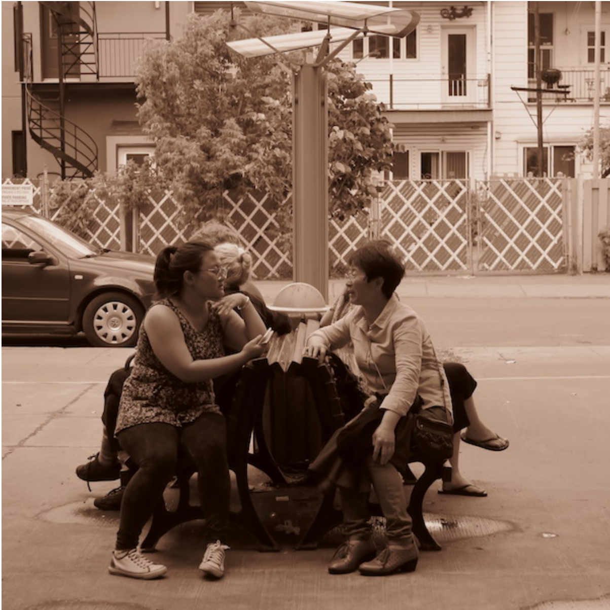
Back to back benches vs face to face encounter

Two back to back benches , located just outside the entry to a public market, don't preclude face to face exchange by users, strategically sitting at one end for ease of moving legs around. Talk of an encounter point experience!