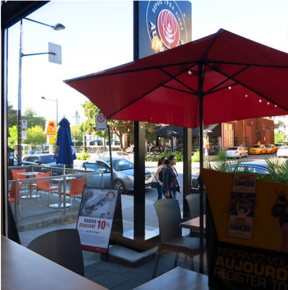
Outdoor seating area vs coffee shop entrance

The outdoor seating areas of coffee places usually have their access located by the place entry door for ease of supervision. Their street-side is usually well delimited to prevent non-consuming traffic from slinking in.