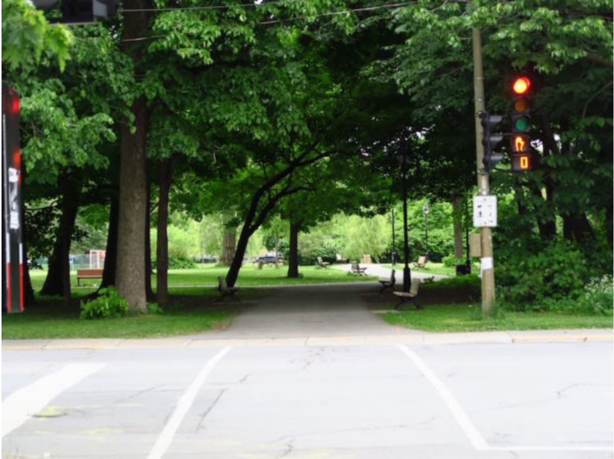
Benches at park “entrance”

The green foliage archway at this park entrance harbors three benches ... some folk will favor their in-between situation ... and the shade. At a respectable distance from each other, the benches require a special effort to seek the micro event of a sympathetic encounter.