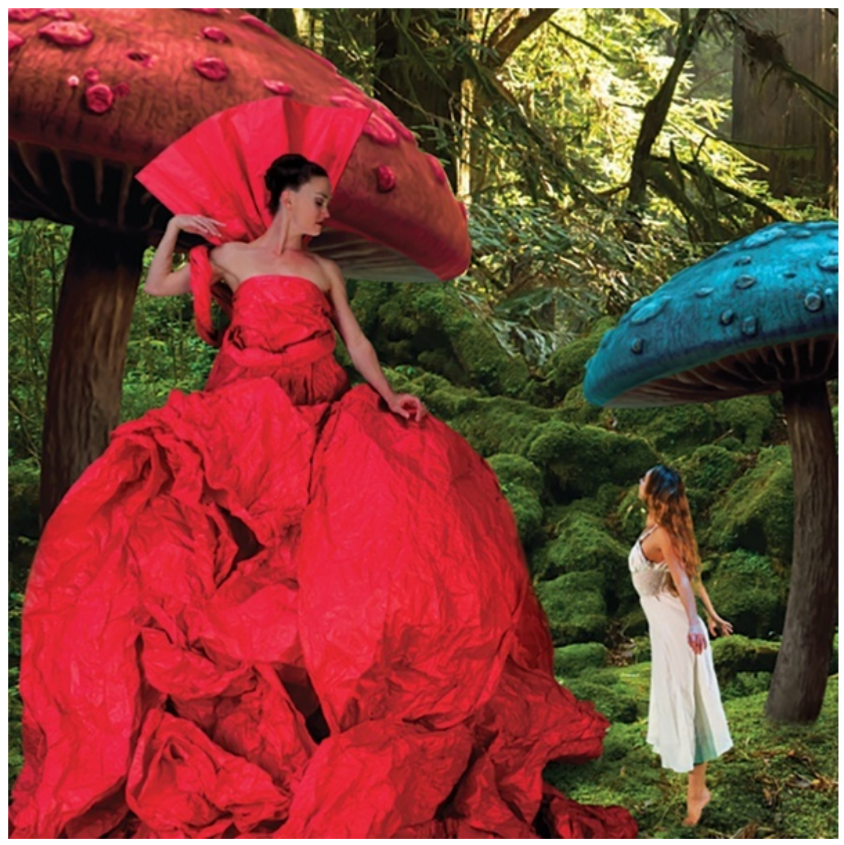
Momix' "Alice."

MashUp Contemporary Dance Company at Frogtown Creative Studios, 2926 Gilroy Street, Atwater Village; Sat., April 30, 7pm, $25. Eventbrite.