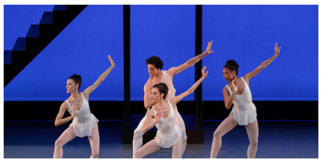
Los Angeles Ballet in "Apollo."

ballets, Apollo , with music by Igor Stravinsky is joined by the company premieres of Christopher Wheeldon's Ghosts and Annabelle Lopez Ochoa's Bloom . The Saturday performance is tied to a gala and is already sold out, but two others to choose from. At The Broad Stage, 1310 11th St., Santa Monica; Thurs.-Fri., April 21-22, 7:30pm, Sat., April 23, 5pm, $68-$114. Los Angeles Ballet.