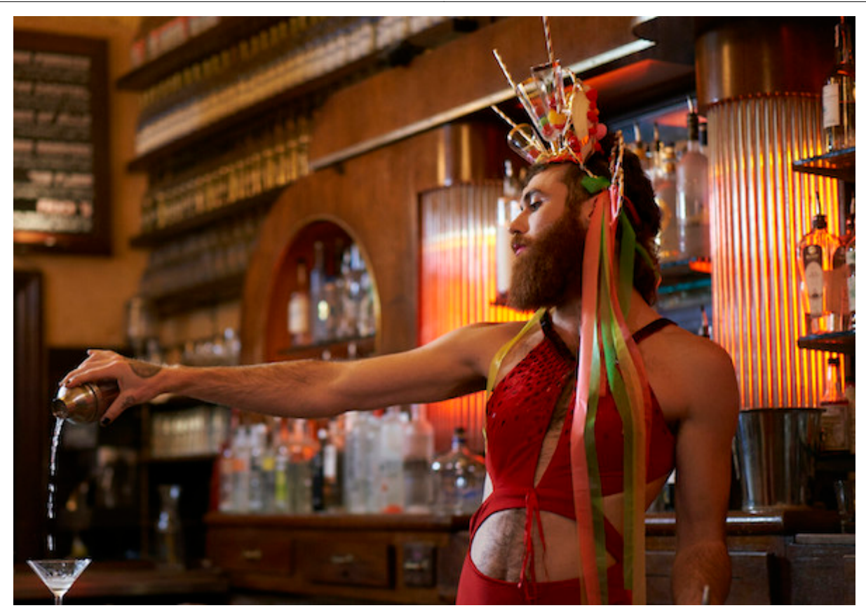
Heidi Duckler Dance.

Max 10 at Electric Lodge, 1416 Electric Ave., Venice; Mon., May 2, 7:30pm, $10. Eventbrite.