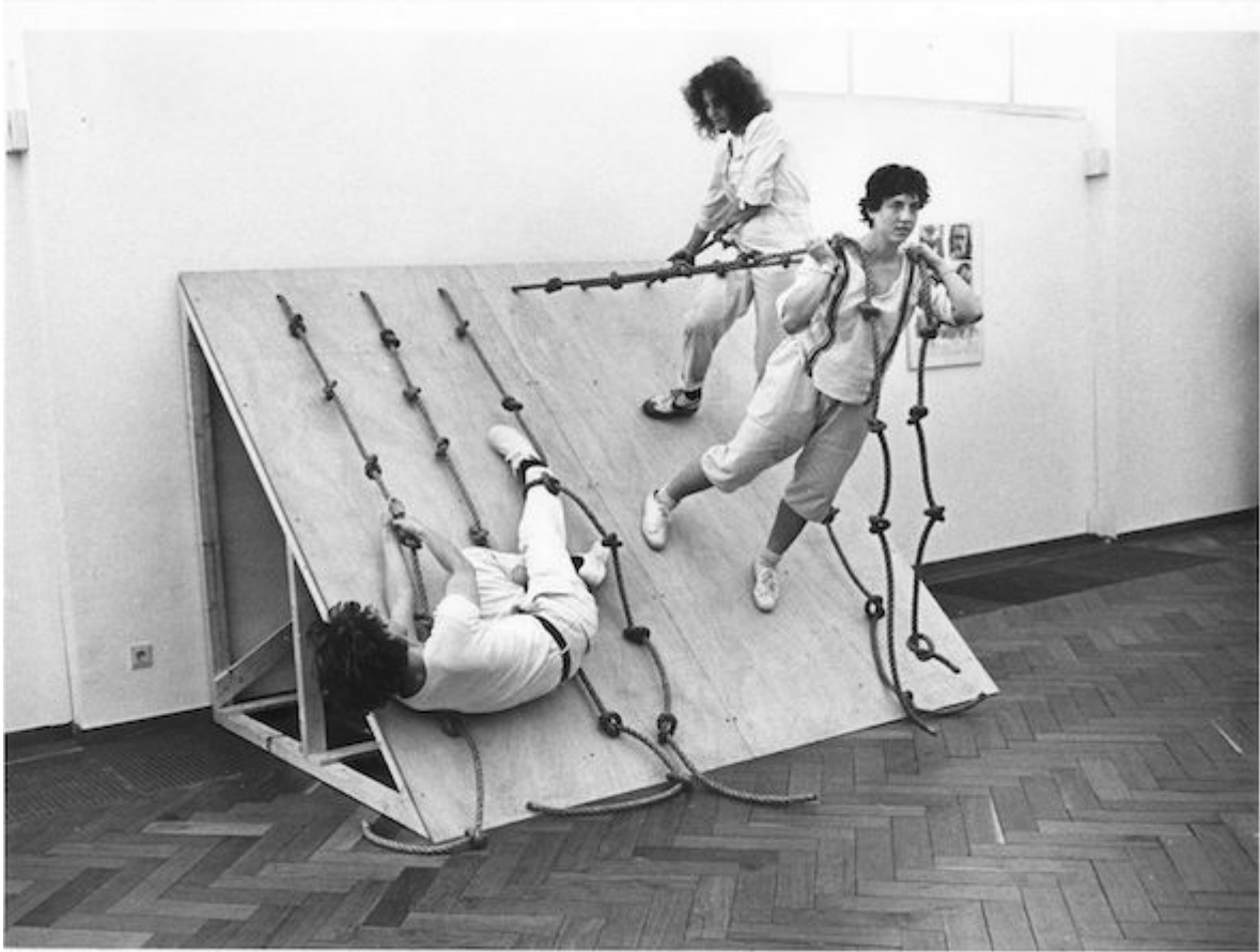
Simone Forti's "Slant Board."

First presented in 1960 in New York with additional "constructions" added the next spring, the nine Dance Constructions are still considered Forti's seminal post modern work exploring the artistic potential in pedestrian movement and referencing the minimalism influences of post World War II art and writing. Today, "pedestrian" movement is an accepted part of contemporary dance, but 60 years ago was considered radical and disruptive of the then prevailing view of modern dance. As Forti expressed in a 2019 interview,