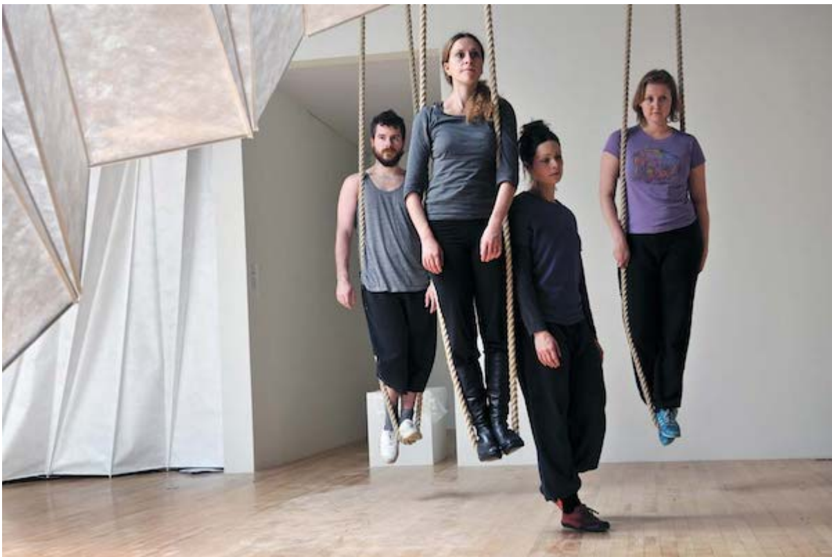
Simone Forti's "Hangers."

In Hangers (1961), rope comes into play as a performer on the ground moves among others perched above in loops of rope. Rope makes another appearance in Slant Board (1961), as performers employ ropes to move in various directions and among one another on the large, tilted plywood ramp in the title. In the third work, Huddle (1961), a cluster of performers initially appear like a sculpture, completely still, until one by one they begin moving out from the group and climbing over the others.