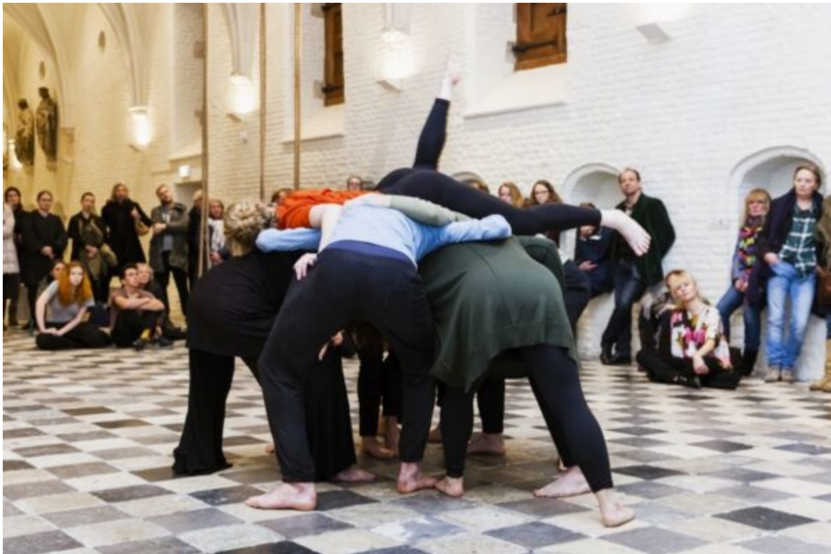
Simone Forti's "Huddle."

Unlike the writings, drawings, and sculpture, since their creation in 1961 Dance Constructions have had a life of their own. In a recent interview in the New York Times, Forti talked about how Huddle has evolved over the decades. She described the original as rougher and more compact, but over time has come to evoke a sense of community and care which she attributed to the embrace of body work, craniosacral therapy, and meditation. Huddle is frequently performed including a performance in Florence, Italy piazza in front of a copy of Michelangelo's David , which may have contributed to Forti's stature in Italy and the recent lifetime achievement award.