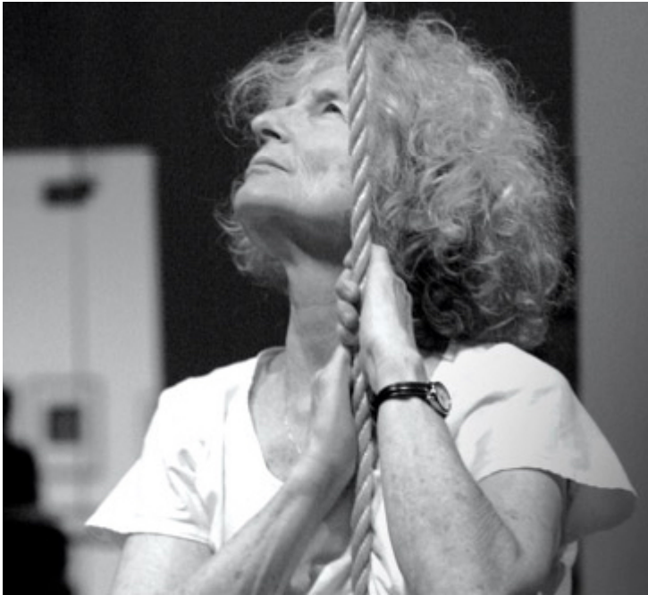
Simone Forti.

The three sections of her Dance Constructions being performed live each week during the exhibition reflect Forti's answers to those questions 60 years ago.