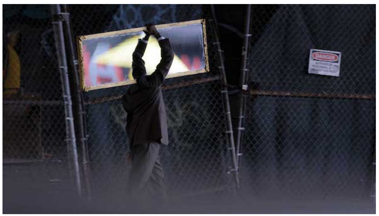
Forgotten Song, a film in Dances With Films (DWF/LA).

An east coast dance film festival makes its local debut as Dances With Films (DWF/LA) at Hollywood's legendary Chinese Theater. The two week festival includes features, short films, and even shorter films. TCL Chinese Theater, Hollywood & Highland, 6925 Hollywood Blvd., Hollywood; Thurs., Aug. 26- Sun., Sept. 12, Details on the extensive line up of films, previews, ticket prices, Covid protocols, and more at Dances With Films.