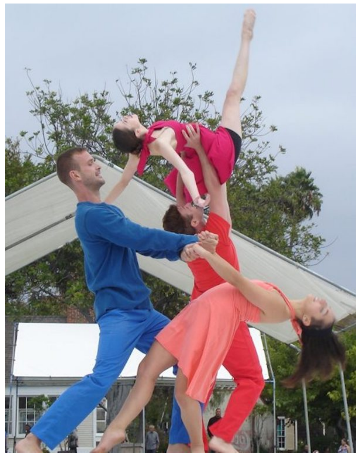
San Pedro Festival of the Arts.