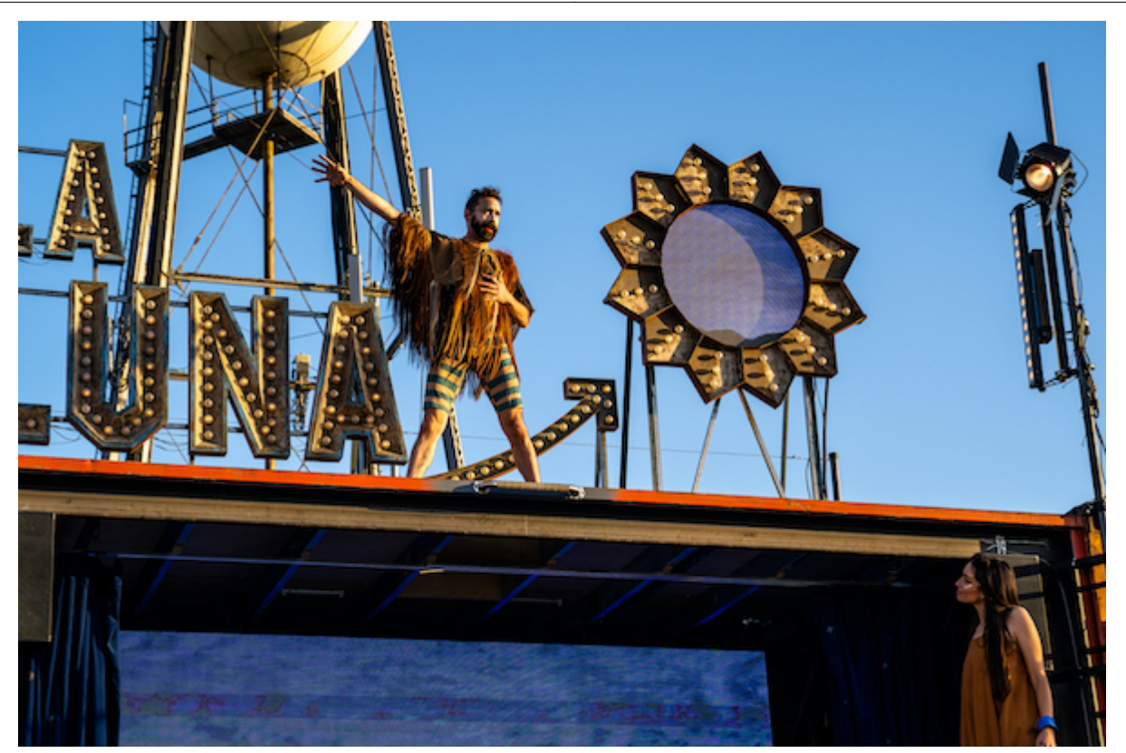
Birds on the Moon.