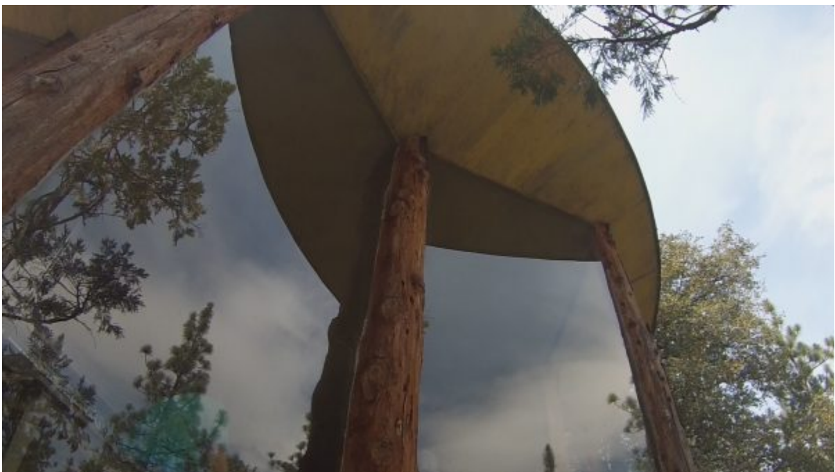
Pearlman Cabin, Detail – Architect: John Lautner