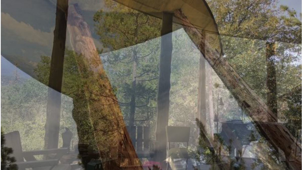
Pearlman Cabin, Detail I – Architect: John Lautner