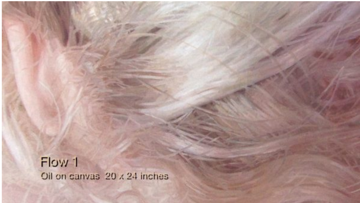
Flow 1, oil on canvas, 20? x 24?