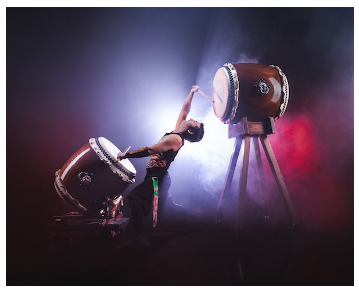
TAIKOPROJECT in "Arts Grown LA". Photo courtesy of the artists