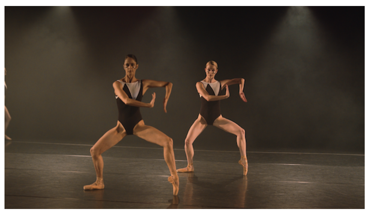
Freaks With Lines in "Nilus Cogus."