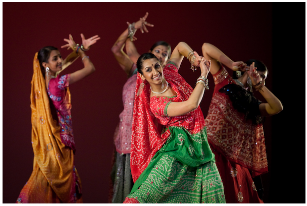
Arpana Dance at the Los Angeles Indian Dance Festival 2022 Company.

Classic Bharatanatyam dance of India is celebrated with free weekend performances through April as part of the Los Angeles Indian Dance Festival 2022 . Announced participants include Arpana Dance Company, Leela Academy and Soorya Dance Ensemble. At De Toledo High School, 22622 Vanowen St., West Hills; Sat., March 26, 2:30pm, free. Soorya Dance Ensemble.