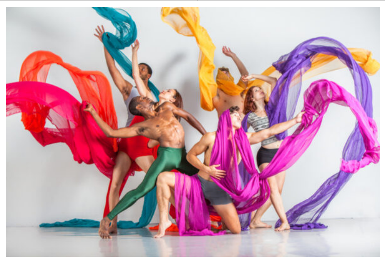
Los Angeles Dance Festival's BrockusRED.

Alvin Ailey American Dance Theater at the Music Center, Dorothy Chandler Pavilion, 135 N. Grand Ave., downtown; Wed.-Sat., April 6-9, 7:30pm, Sat.-Sun., April 9-10, 2pm, $34-$138. Music Center