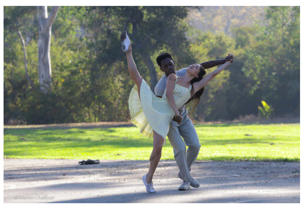
Dance Camera West.