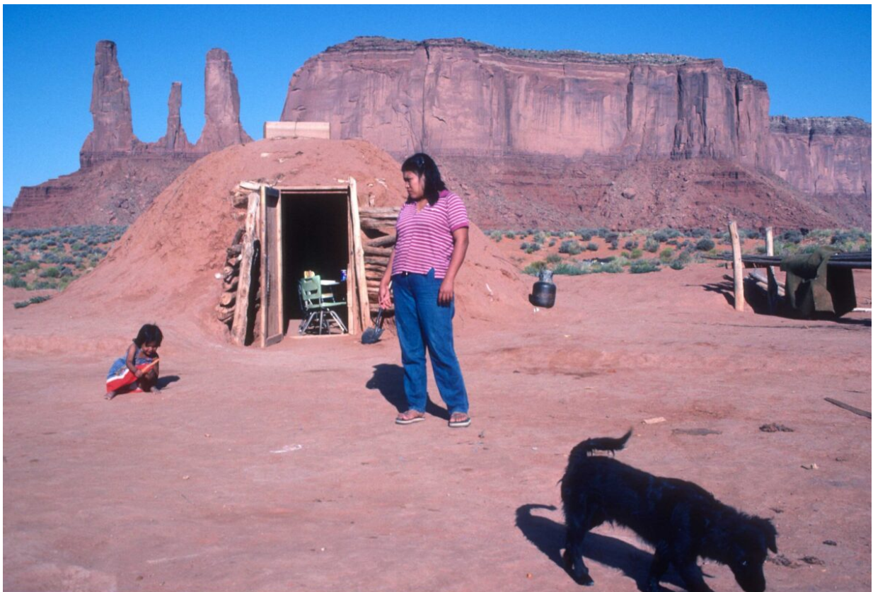
Navajo family living in hogan, mud hut. Monument Valley

In the summer of 1985 I was invited to join an Italian journalist colleague to travel across the U.S. to photograph and interview Navajos, Apaches and Sioux in Arizona (Monument Valley, Window Rock, Canyon De Chelly, Fort Apache, Tuba City, Tucson), South Dakota (Wounded Knee, Pine Ridge), Montana (Custer Battlefield). It was an unforgettable experience that I wish to remember here, with some contemporary updates.