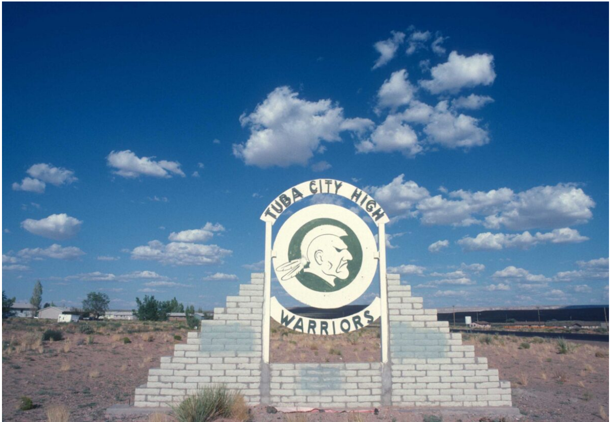
Tuba City Warriors. Navajo Nation basketball team

In 1994, as the Los Angeles correspondent for the Italian film magazine CIAK , I wrote an article about Geronimo , directed by Walter Hill and starring Wes Studi , and new westerns where the Indians were depicted more authentically than in the past.