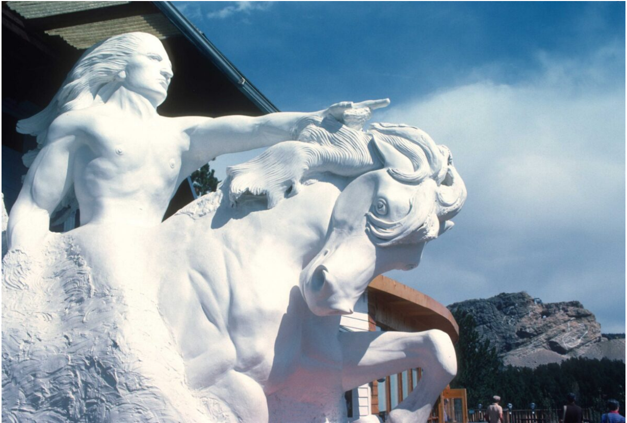
Crazy Horse Memorial. Black Hills, South Dakota

And I read in YES! Magazine an article about a new book, Required Reading: Climate Justice, Adaptation + Investing in Indigenous Power , curated by the NDN Collective based in South Dakota.