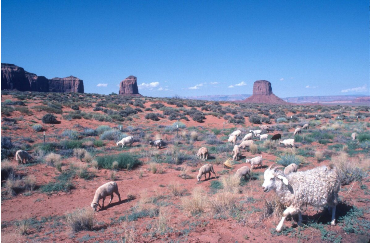
Navajo's flock of sheep. Monument Valley

In the mid 1970s the term Native Americans was adopted. During the past year, a new acronym was coined, BIPOC (Black, Indigenous, People of Color). The term Indigenous People , as used by the U.N. (United Nations) in 2007, includes the Natives of Central and South America, such as the Aztecs, Incas, Mayas, the Aboriginals of Australia, the Maoris of New Zealand, and many other original inhabitants prior to European colonization. Read the latest guidelines from UCLA's D.E.I. (Diversity, Equity & Inclusion).