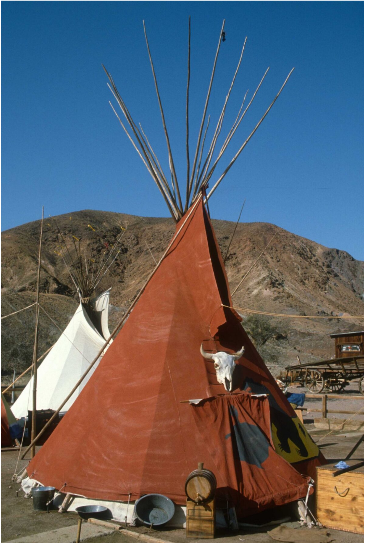
Indian teepee. Calico, California

And one last image, an iconic Indian teepee , that I photographed on our drive from Los Angeles to Monument Valley.