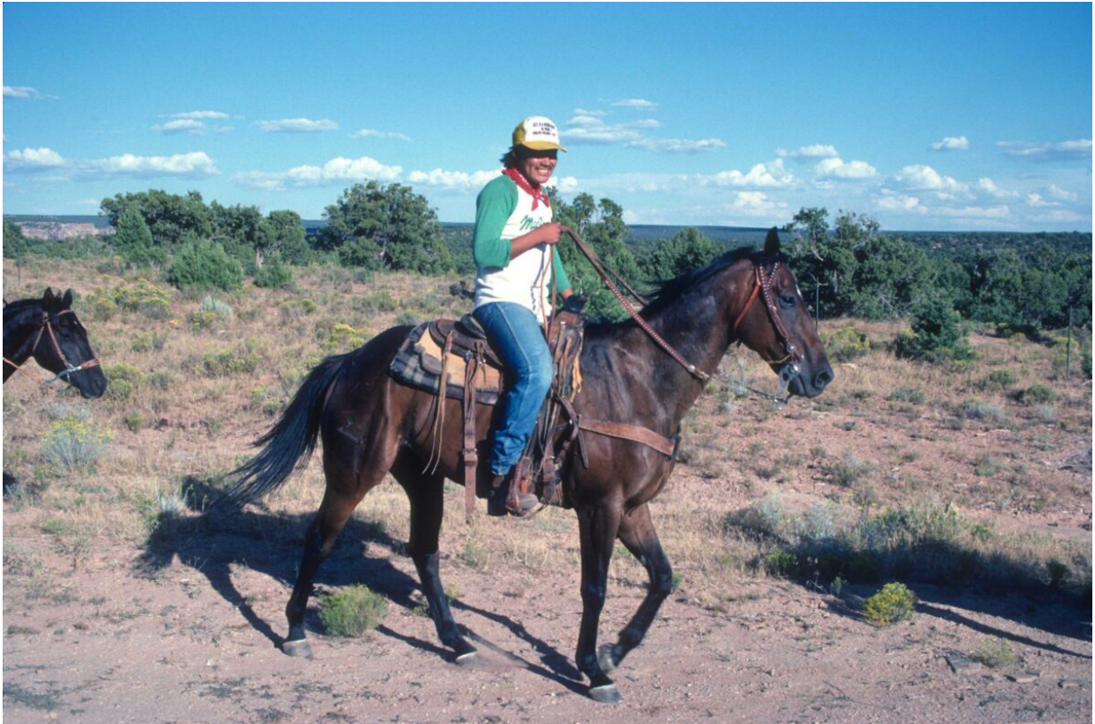
Navajo rider on horseback. Canyon De Chelly, Arizona

There are many other tribal Indian names than those most commonly known. For example, the original inhabitants of Los Angeles are Gabrielino-Tongva . In 2013, a new park in Santa Monica was named after them.