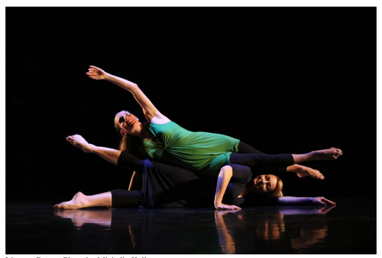
Lineage Dance.

and improvisors of Ensemble Shakespeare Theater for What You Will . Performed outdoors under the trees, the performances are described as a Shakespearean "un-play," actually a series of miniplays bringing the performers' individual and diverse backgrounds to reconsider and recontextualize the Bard of Avon's stories and words. Descanso Gardens, 1418 Descanso Drive, La Cañada Flintridge; Thurs.-Sat., Sept. 16-18, 5:30 pm, $20-25. More info and Covid protocols at Ensemble Shakespeare Theater. Tickets at Descanso Gardens