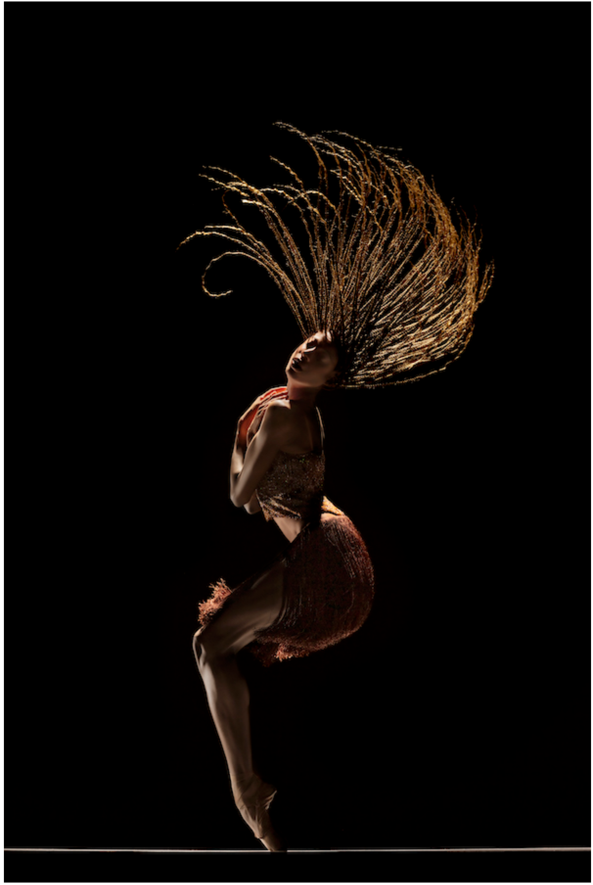
Alonzo King LINES Ballet.