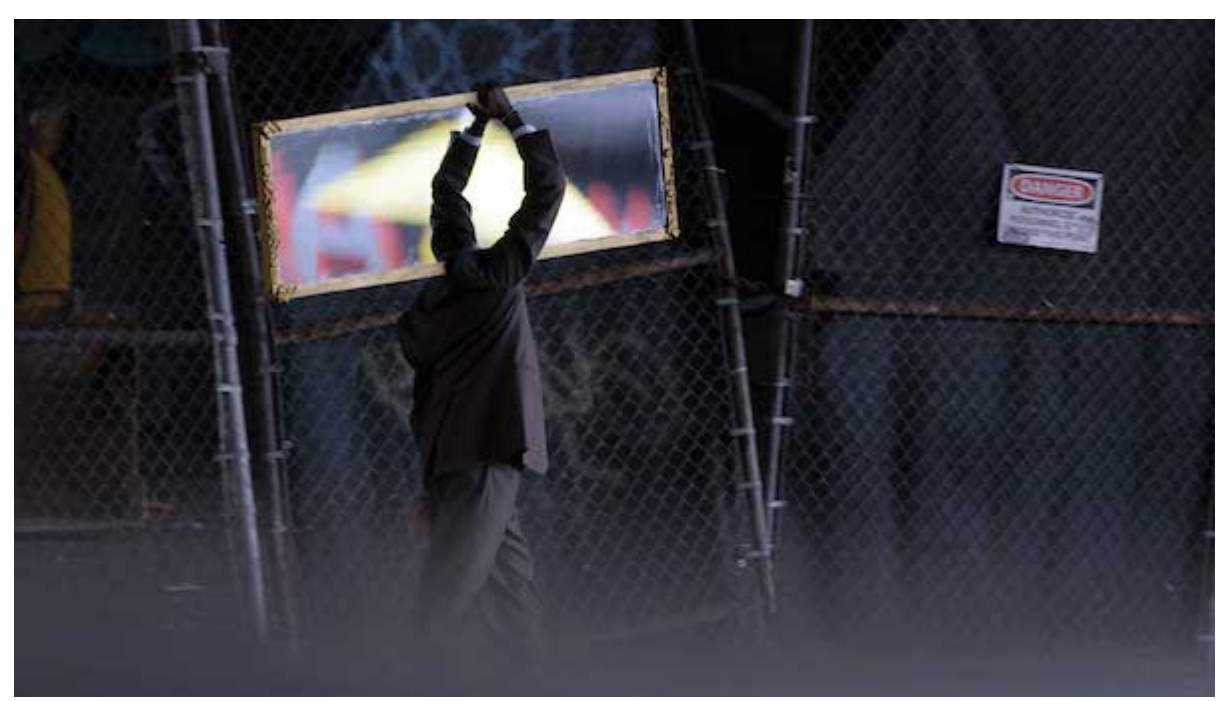
Forgotten Song, a film in Dances With Films (DWF/LA).

more features, short films, and even shorter films. TCL Chinese Theater, Hollywood & Highland, 6925 Hollywood Blvd., Hollywood; thru Sun., Sept. 12, Details on the extensive line up of films, previews, ticket prices, Covid protocols, and more at Dances With Films.