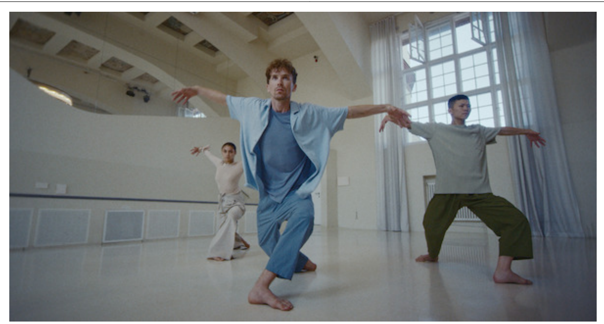
"Films.Dance Round 2."