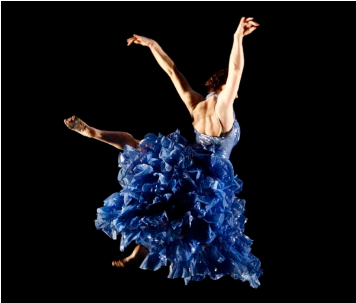
Invertigo Dance Theatre.

Originally staged in 2016 to sold out audiences, Invertigo Dance Theatre's After It Happened receives a timely encore presentation. Set in the aftermath of a natural disaster, the work considers how a community rebuilds and scavenges for signs of hope and resilience. When originally presented, the work suggested a natural disaster, maybe an earthquake or flood. A pandemic that has snatched a half million Americans and millions more around the world was not in the thinking. With the current tragedy front and center, not over, but maybe headed toward containment, After It Happened offers a thoughtful consideration through dance that suggests ways to create and build a new normal. The performance gains an additional component of a physical reality from the hillside stage of the open-air Ford Theater where it was filmed. Available as part of its online showcase of prior SoCal dance performances at this beloved venue. Thurs., March 11, 6:30 p.m. PST. Free with reservation at The Ford or Invertigo Dance Theatre .