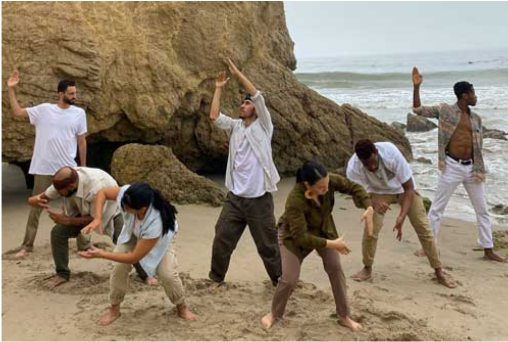
Versa-Style Dance.