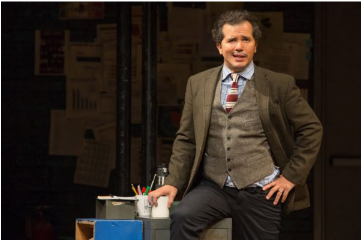
John Leguizamo in a cocky moment in Latin History for Morons at The Ahmanson Theatre.