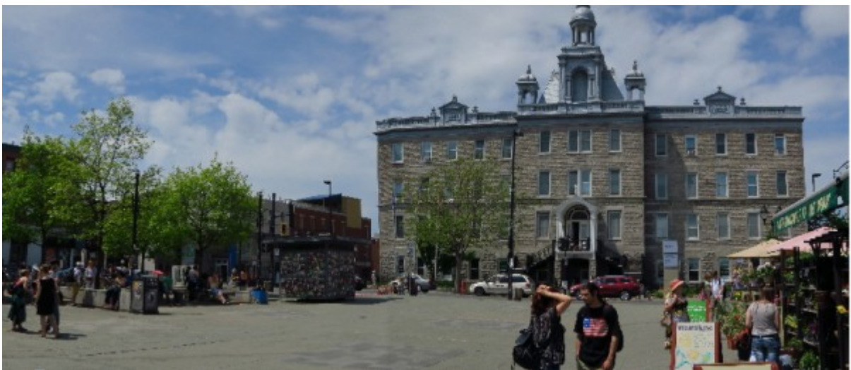
Mt Royal station – parvis north

If Laurier station sits at the limit of its neighborhood, Mont Royal subway station sits at its heart, right across the local Cultural Center and Public Library, with which it shares a common “parvis” of sorts, both fronting on the neighborhood main drag that leads to Mont Royal Park, which gave the station its name.