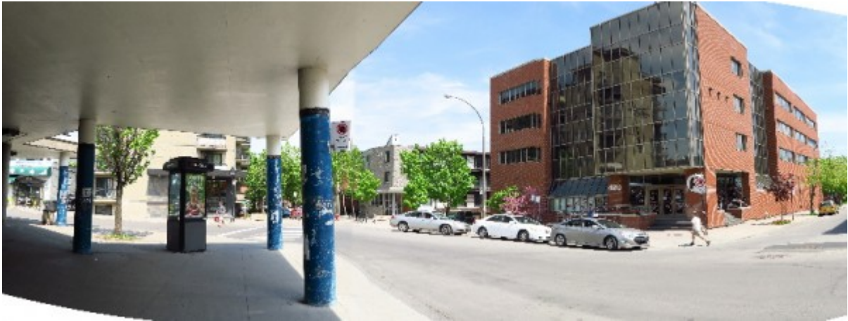
Laurier station sidewalk sweep lower end

the main drag and the bus lines downloading stations.