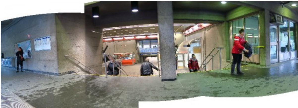
Vendôme station – Main entry point with view of access to subway and commuter train quays.

Vendôme subway station is one of the main hubs in the city given the seven bus lines that serve it, four of which having their terminal turn around there, and its city subway and regional commuter train stations.