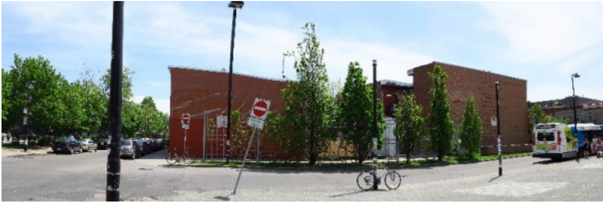
Mt Royal station sacred wall precinct

Framing the east and west sides of the common “parvis” are an open market and a mix of green spaces along a block long bike stand.