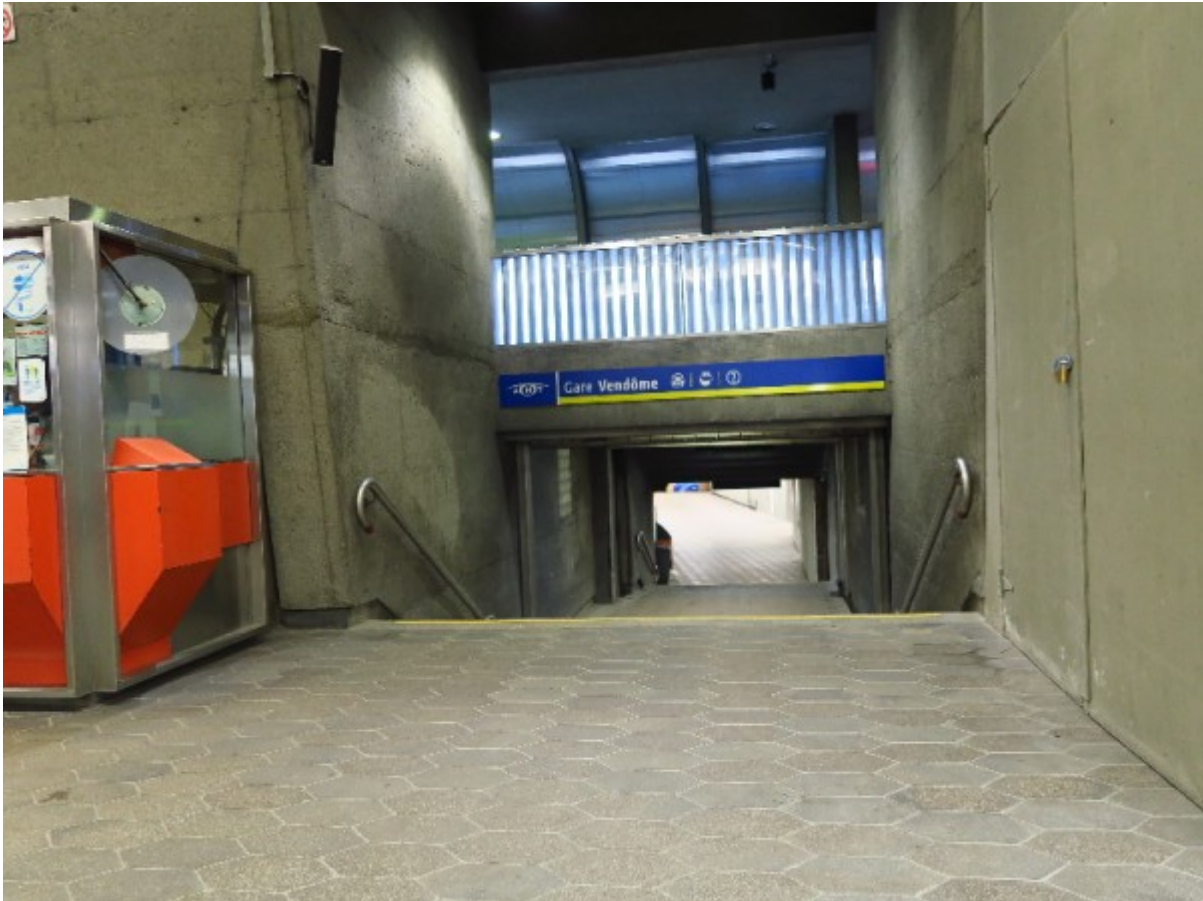
Vendôme station – tunnel access to train and mezzanine access to bus

The bus lines are not the only ones to benefit from a pre-loading waiting and warming area; as can be seen below the commuter train station also has one from which one has panoramic view of subway station and the city to the left, and of the new hospital complex to the right. (See below)