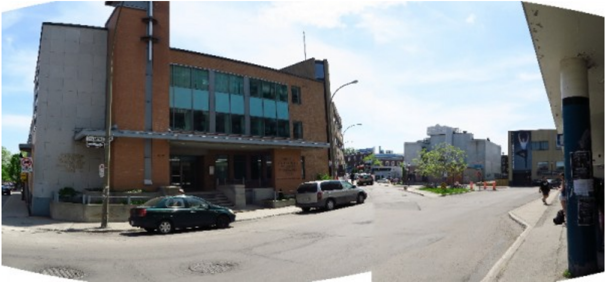
laurier station institution row – south end