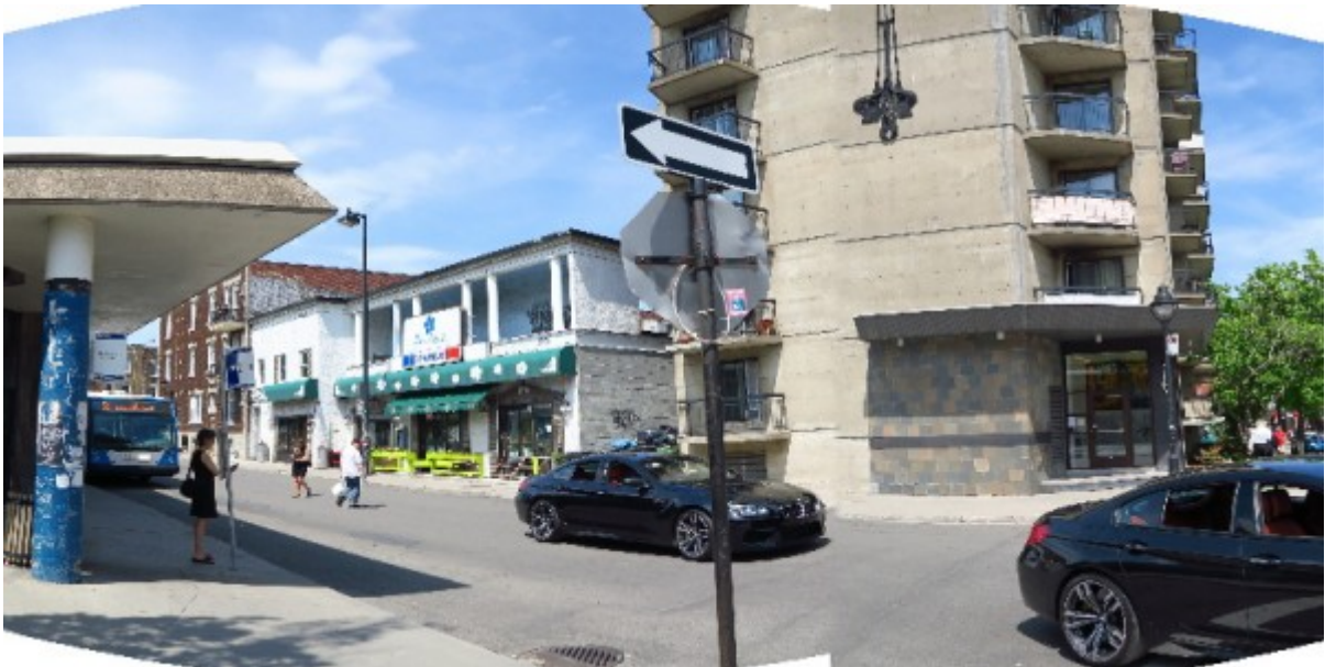
laurier station sidewalk sweep – upper end

All this concern for taxi, bike and pedestrian access facilitation can be understood, and appreciated given the adjacent “institutional row” made up of a trade union headquarters, an LDS church headquarters and the Quebec National School of ballet dancing ... and given what these institutions come to represent as figure heads to the neighborhood and district.