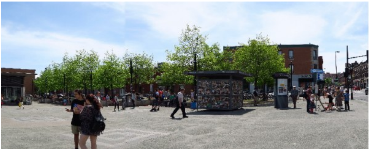
Mt Royal station parvis informal activity and green side

These provide practically 24/7 animation, when passengers of both bus and metro services, and local bars and restaurants clients snake by the station on the way home, or maybe stop to buy some fruits, a flower, maple syrup products, etc.