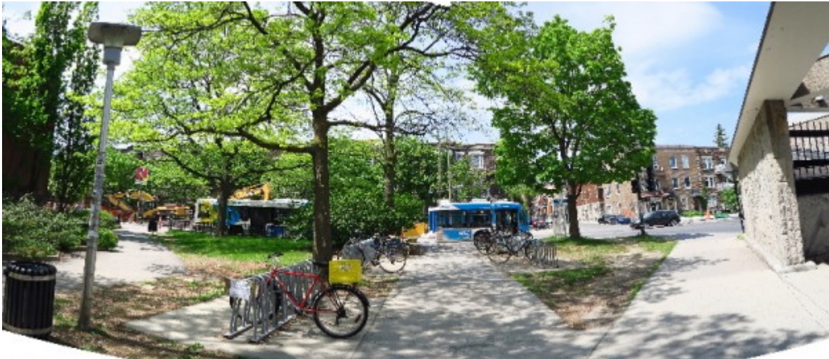
laurier station bike park and rental stands

Laurier subway station is located at the limit of a particular neighborhood that has favored pedestrian and bicycle modes of circulation. As the first subway station coming into that neighborhood, it is not strange therefore to see the generous bike parking stands at the head of the station site and, across the main drag bordering it, a bike rental stand.