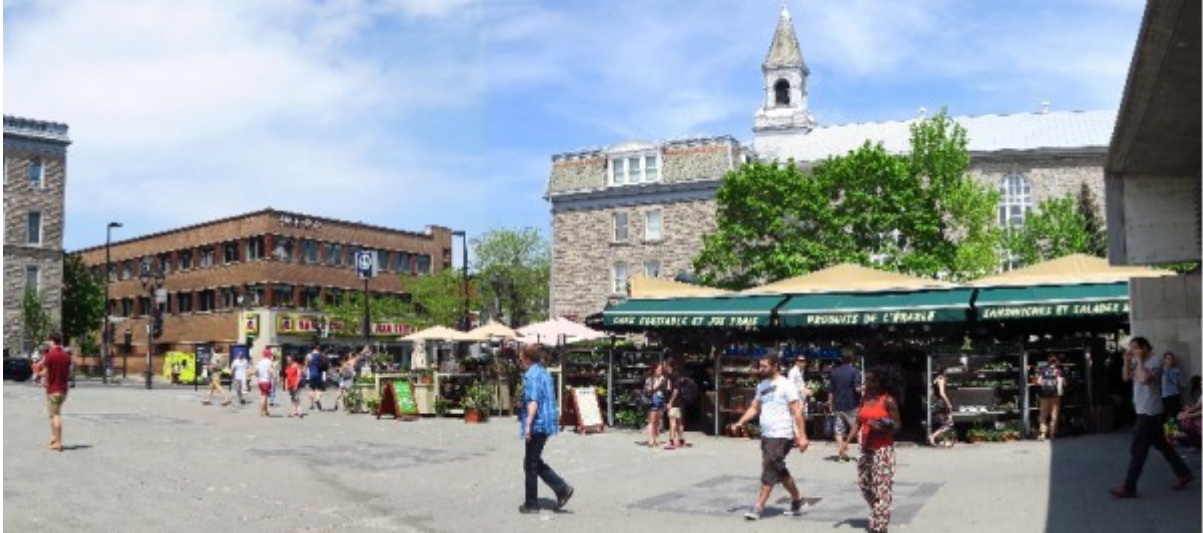
Mt Royal station parvis open market side