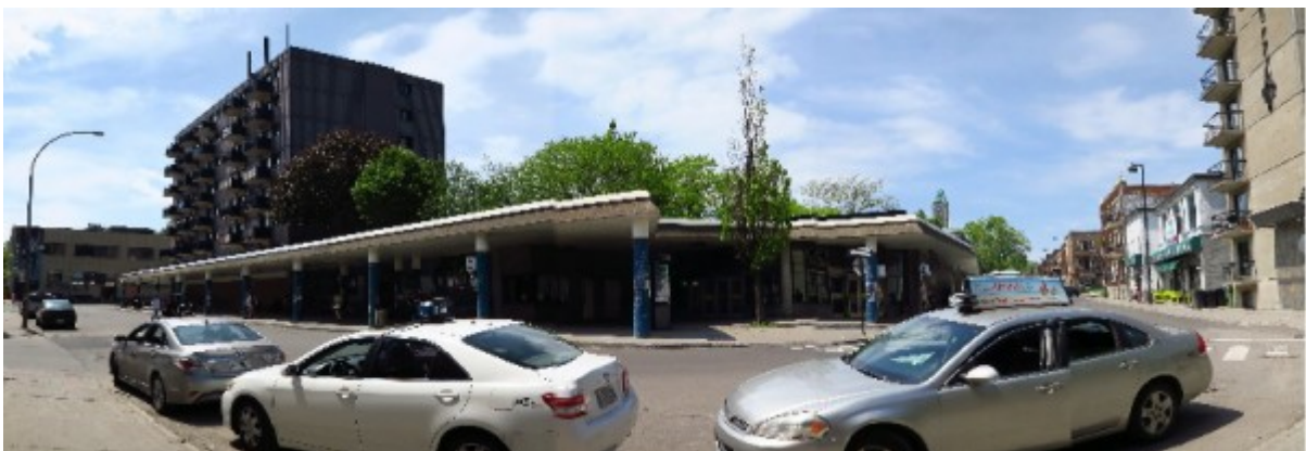
Laurier station wrap around arcade

Here, therefore, is an example of architecture that synthesizes social and urban design concerns.