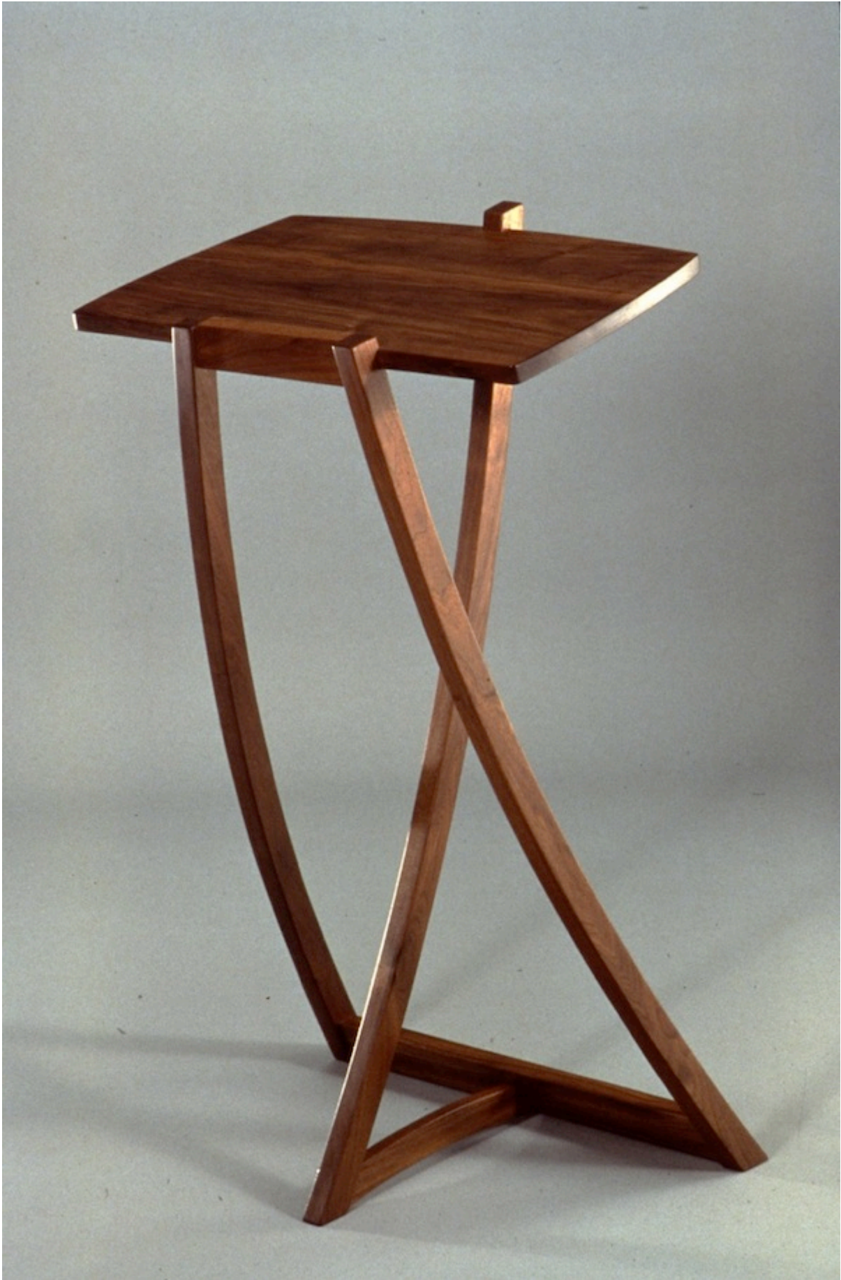
Dictionary Stand by Peter Korn, walnut (24"x16.5"x40"), 1981