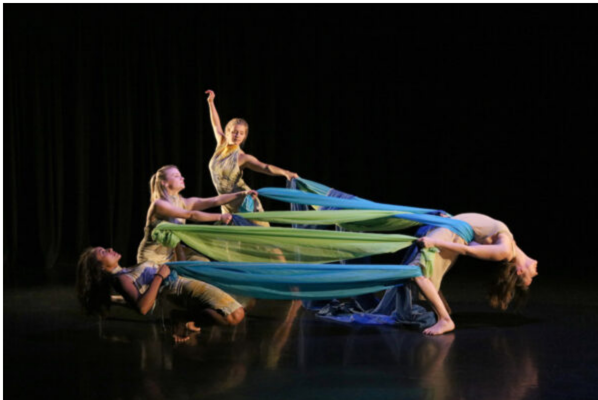
Lineage Dance.