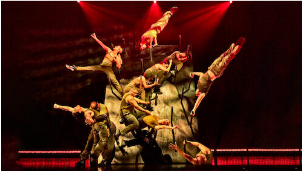
Diavolo Veterans Project.

Diavolo Architecture in Motion-Veterans Project in This is Me: Letters from the Front Lines . Streaming Sat., March 18, 5 pm, $20. Diavolo .