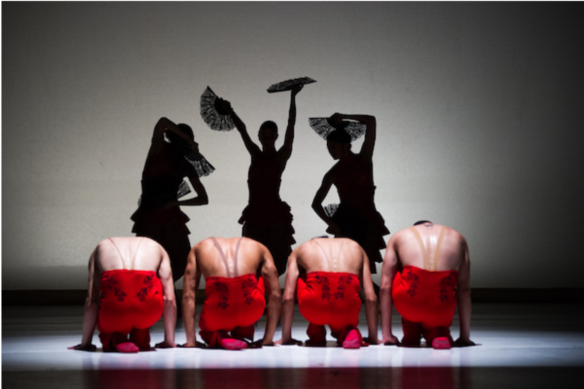
Ballet Hispánico.