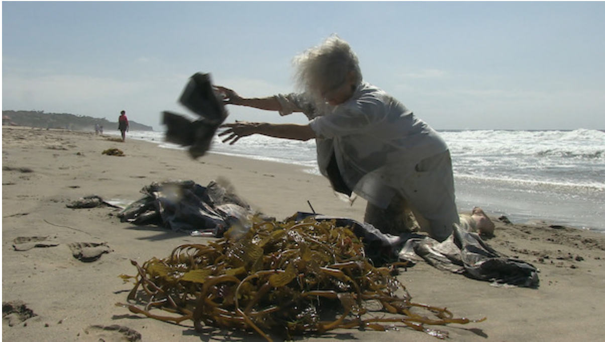
Simone Forti.