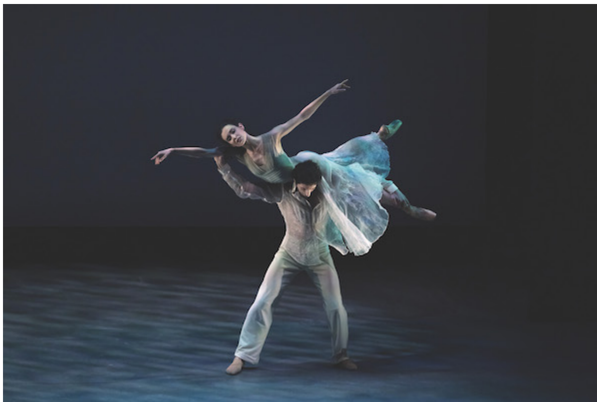
Los Angeles Ballet.