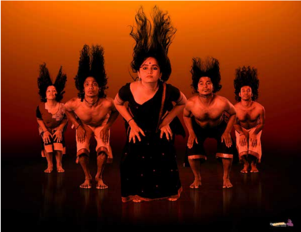
LA Indian Dance Festival.