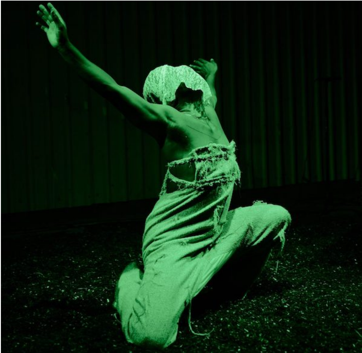
Chris Emil.