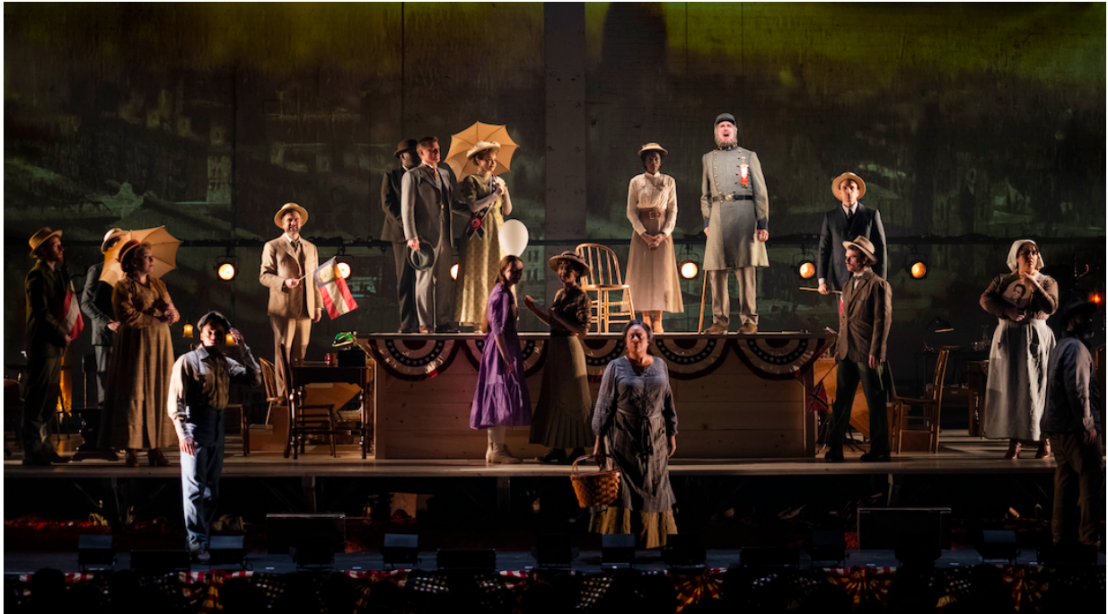
The company of Parade .