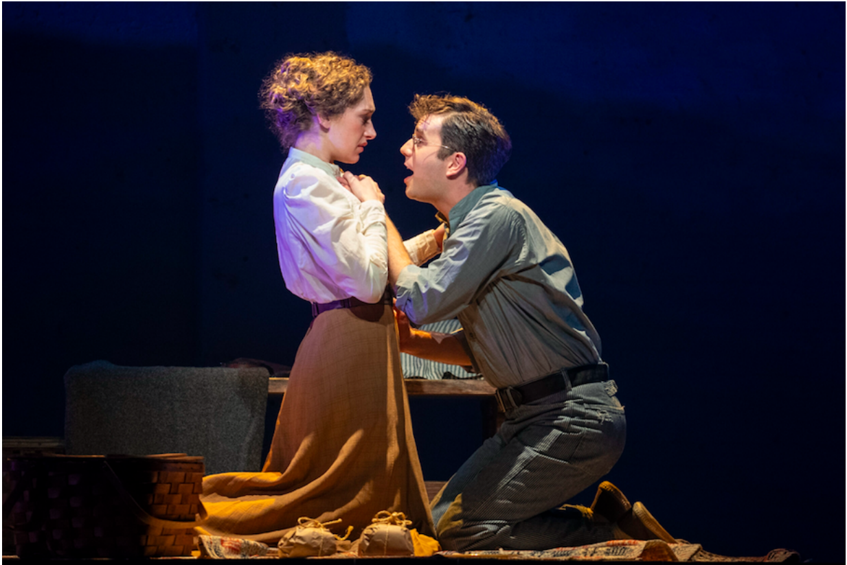
Micaela Diamond and Ben Platt in Parade .