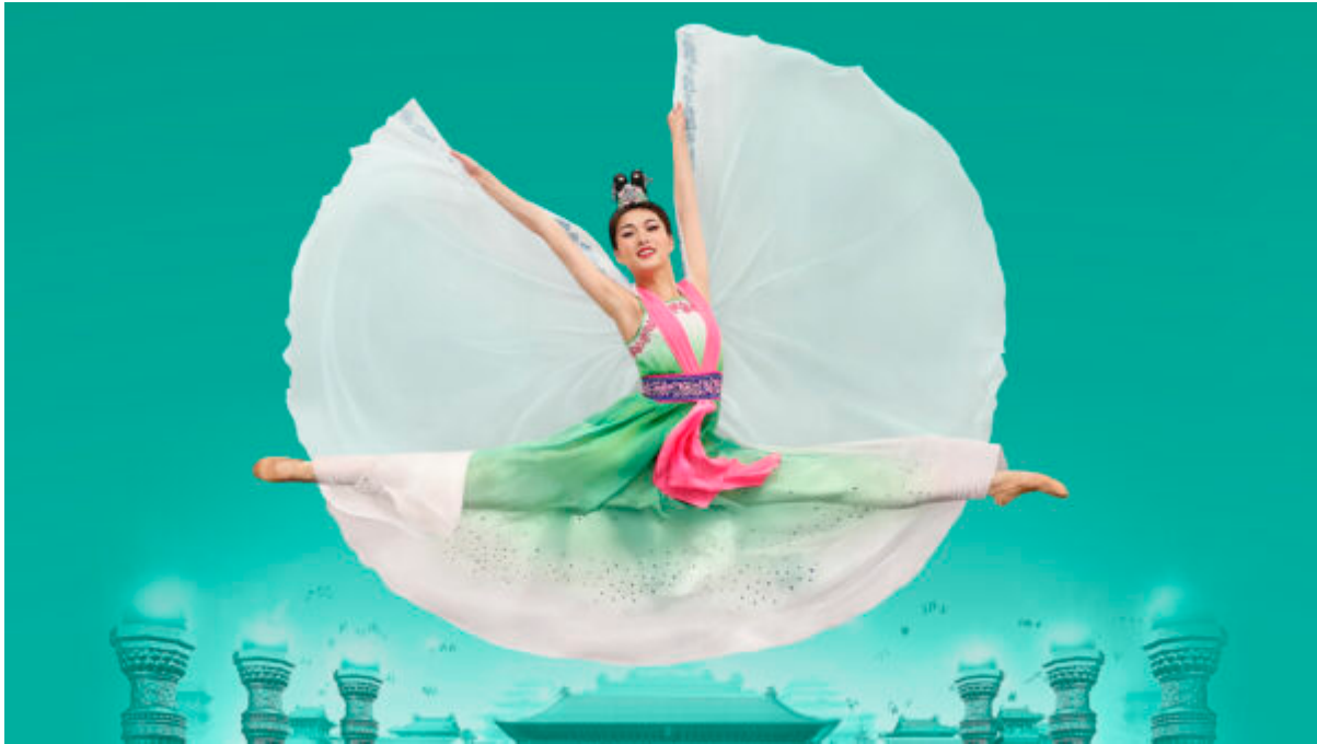
Shen Yun.