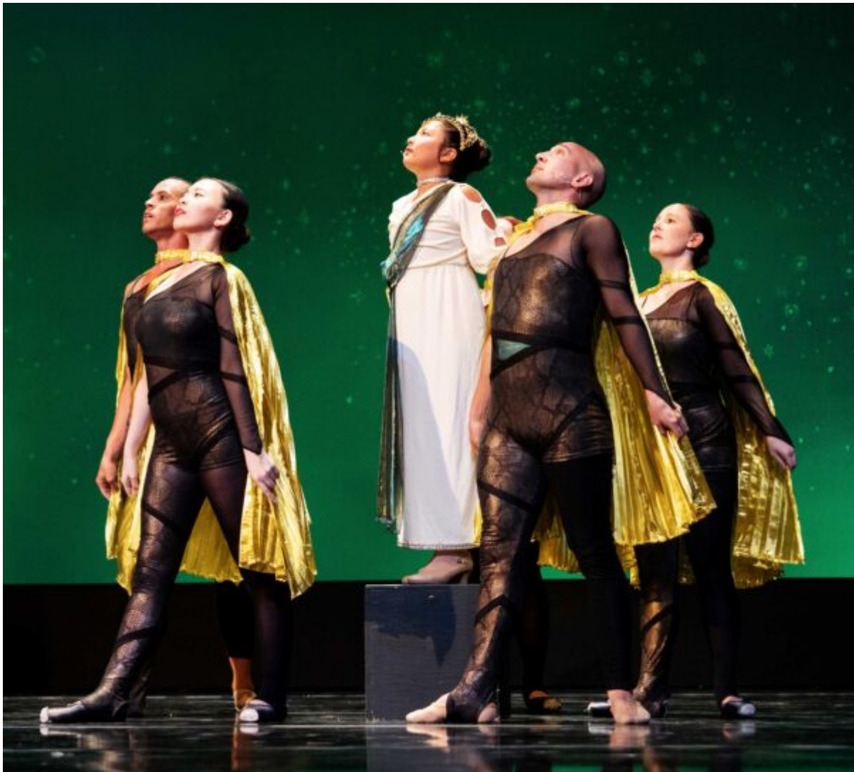
Inland Pacific Ballet.

March 11-12, 2 pm, $29-$62. City of Rancho Cucamonga .