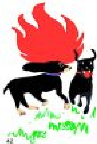
She barked in the yard.