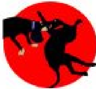
I am who I am, and I am who I seem.