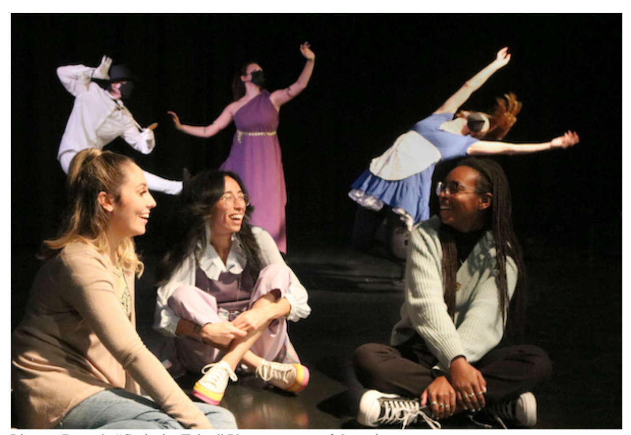
Lineage Dance's "Curiosity Tales."

Dancers from the contemporary company Lineage Dance join actors in Curiosity Tales , a family-friendly retelling of familiar storybook characters and their adventures. At Lineage, 920 E. Mountain St., Glendale; Sat., Feb. 13, March 6, 13, & 27, 4 pm, $40, $20 students & seniors. Info, tickets, & Covid protocols at Lineage Dance.