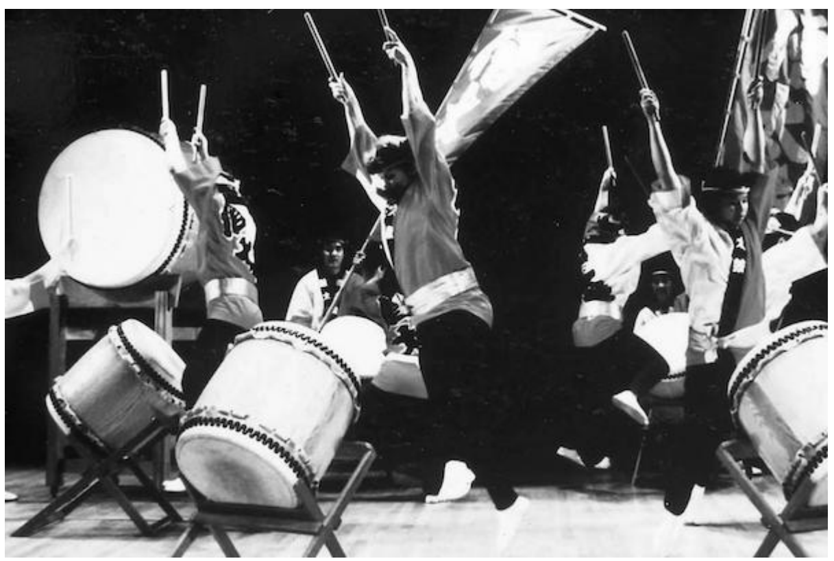
East LA Taiko.

Japan may be the acknowledged home of taiko, but East LA Taiko brings its distinctive SoCal brand of the drumming art with excursions into Afro-Cuban, ska punk, and Latin rhythms. It's not just the drumming, these folks also know how to move. USC, Queens Courtyard (near the Bing Theatre), 3400 Watt Way, downtown; Tues., Feb. 15, 4pm, free. Info & Covid protocols at Visions and Voices.