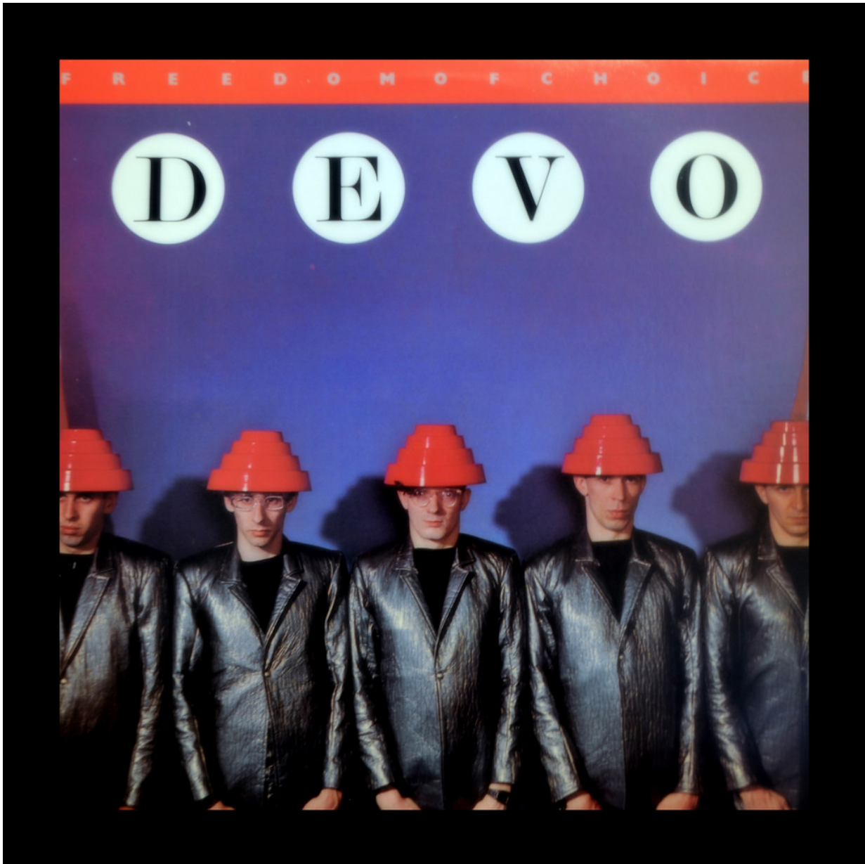
DEVO, Freedom of Choice

It was only 14 years later that a group of friends and Devo fans at a Mormon church in Brea, California played their first house party, taking more than a few pages out of their heroes' playbook by wearing costumes and combining that band's sound with surf rock and ska. That band became The Aquabats.