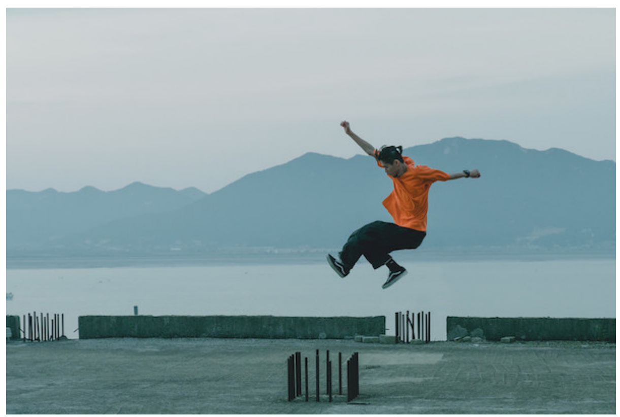
Dance Camera West.

This entry was posted on Sunday, January 9th, 2022 at 7:03 am and is filed under Film, Music, Dance You can follow any responses to this entry through the Comments (RSS) feed. You can leave a response, or trackback from your own site.