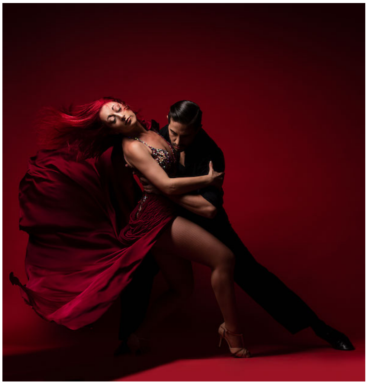
Tango Argentina.

One of the most professional of the touring tango shows, Tango Argentina , stops off for two shows at Segerstrom Concert Hall, Segerstrom Center for the Arts, 600 Town Center Dr., Costa Mesa, Sun., Jan. 16, 2 & 7 pm, $19-$79. Details, tickets & Covid protocols at SCFTA.