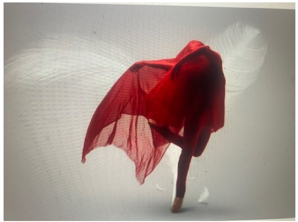
The White Feather: A Persian Ballet Tale.