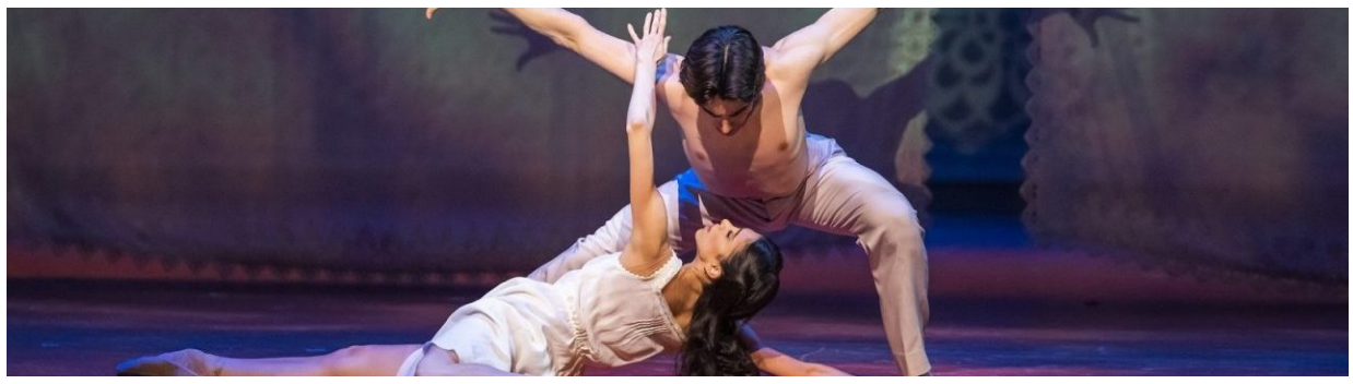
Christopher Wheeldon's "Like Water For Chocolate."

Like Water for Chocolate, Laura Esquivel's revered book about thwarted lovers, magical realism, and emotion-charged cooking enthralled readers. The 1992 film version ignited more fans, including celebrated British choreographer Christopher Wheeldon whose full-length ballet version that American Ballet Theatre premieres here this week. Developed as a co-production by ABT and Britain's Royal Ballet where Wheeldon is Artistic Associate, the world premiere was in London but SoCal gets the U.S. premiere with a live orchestra (New York doesn't see it until June, further solidifying ABT's SoCal presence). While the ballet plot departs from the book, the central, thwarted love story of Tita and Pedro remains the pulse of the ballet as does Tita's otherworldly gift of imbuing her emotions into others through her cooking. In interviews, Wheeldon explained the rough translation of the title refers to something "boiling over" which is one way to describe the finale of the ballet. Segerstrom Center for the Arts, 600 Town Center Dr., Costa Mesa; Wed.-Sat., March 29-Sat., April 1, 7:30 pm, Sat. & Sun., April 1-2, 2 pm., $29-$250. SCFTA.