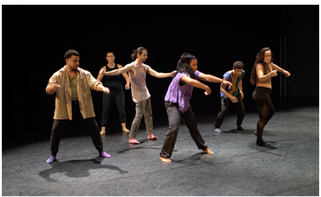
Bodies in Play.

of fatherly relationships crossing different eras and cultures. Responding to ongoing food insecurity among LGBTQ seniors, the event also is a "food raiser" with attendees invited/encouraged to bring canned, dried, and other items. Full list of appropriate food donations is at the website. After these performances, the show moves on to San Francisco for a run. The Broadwater Main Stage, 1076 Lillian Way, Hollywood; March 30-31, April 1, 8 pm, $20-$40 Bodies In Play.