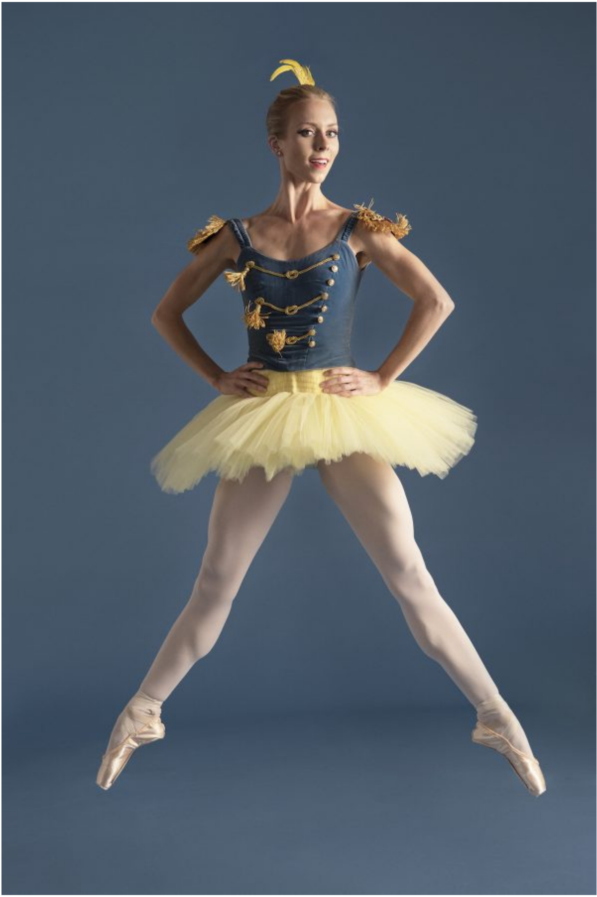
American Contemporary Ballet.