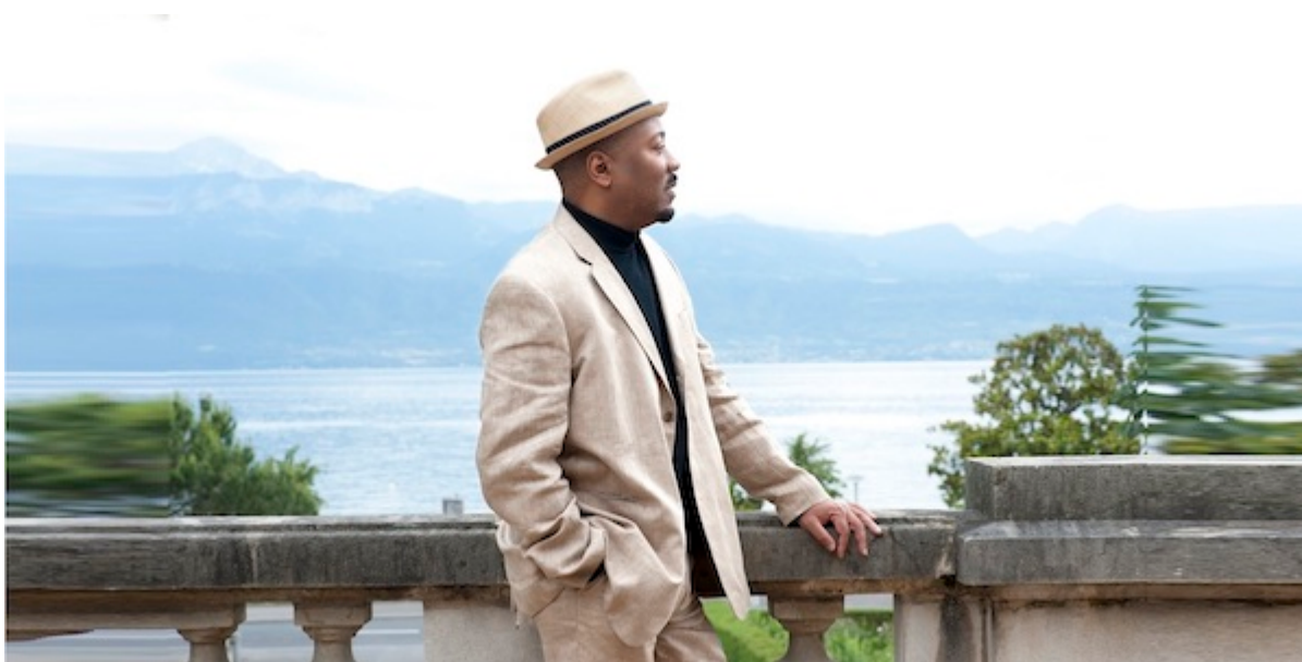
Alonzo King.