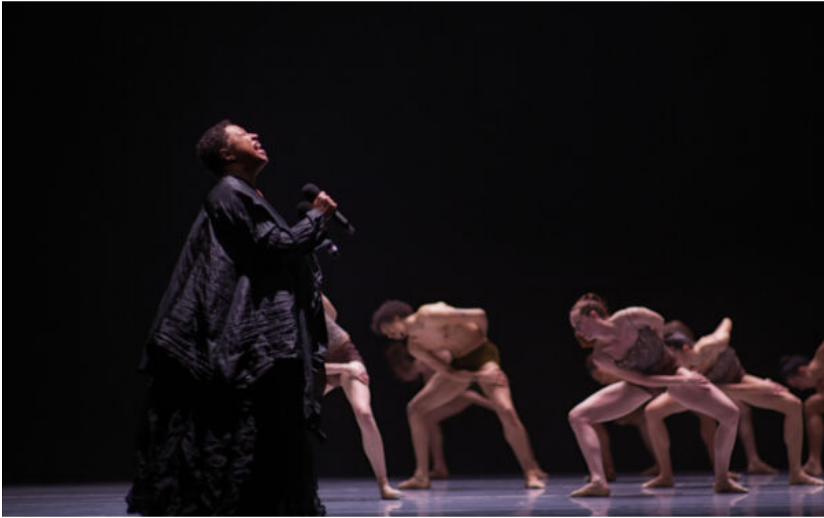
Vocalist Lisa Fischer and the LINES dancers.

MacArthur genius award-winning composer Moran is artistic director of Jazz at the Kennedy Center among his other laurels. For Deep River , Moran not only composed and arranged, he collaborated in adding jazz moments by Pariah Sanders, James Weldon Johnson, and the Maurice Ravel.