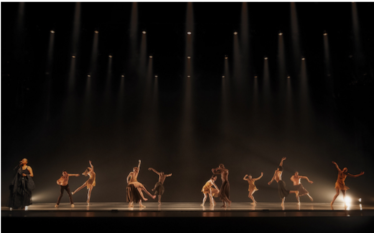
Alonzo King LINES Ballet.