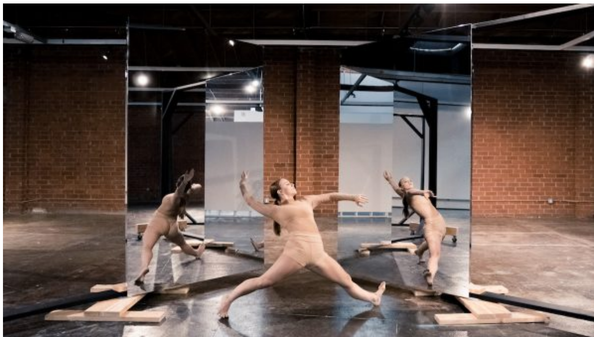
MashUp Dance Company.