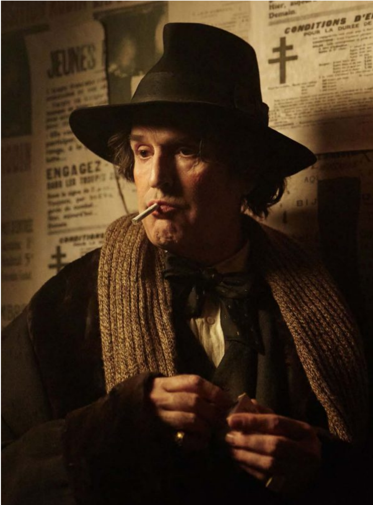
Rupert Everett as Oscar Wilde

Everett illustrates in the film how Wilde continued to indulge his passions, champagne, absinthe, cocaine, and sex with young men, even after he became impoverished and persecuted in exile. Also he could not resist getting back together with his beloved Bosie.