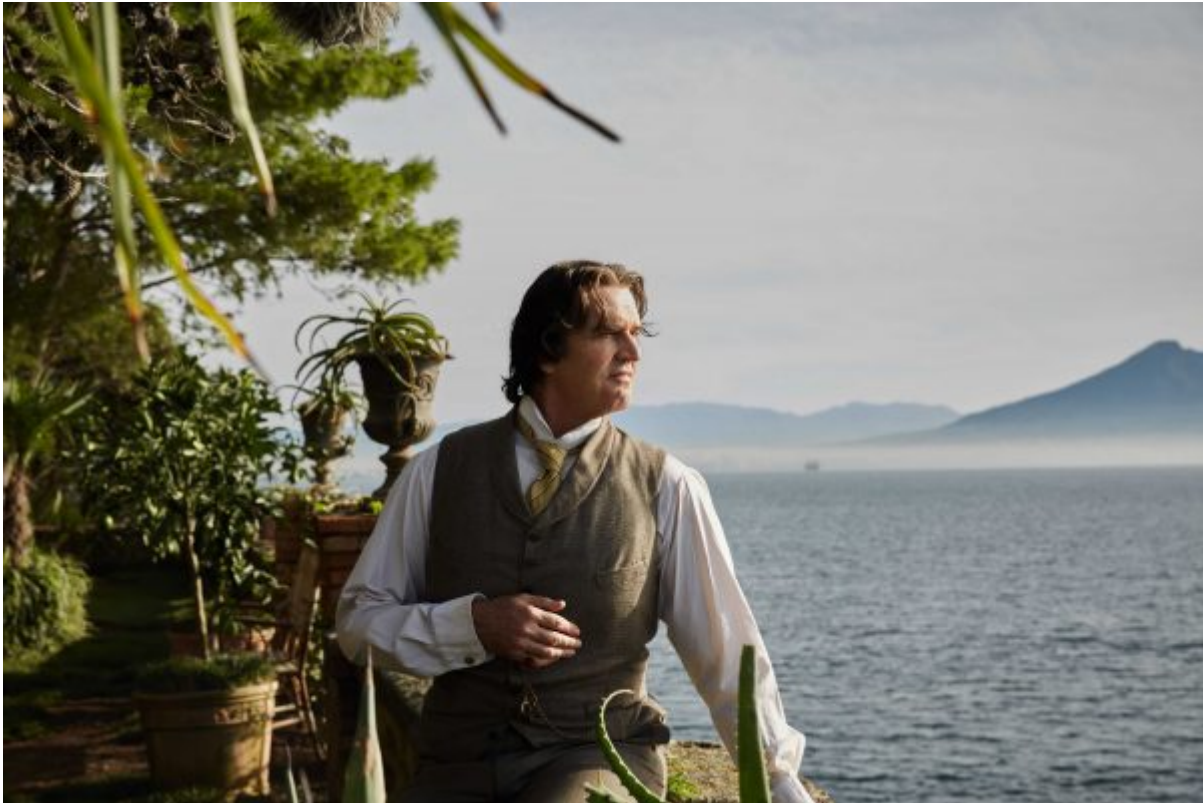
Rupert Everett as Oscar Wilde in Naples.

I meet Rupert Everett in Beverly Hills to talk about his film. This is the eighth time I interview him, in my long career as a film journalist; the first time was in 1991 for lunch at Butterfield's on the Sunset Strip. See my article in Venice magazine .