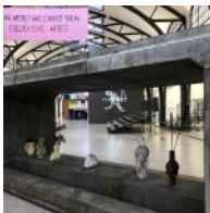
Hamburger Hofban Museum

Our visits included the Hamburger Bahnhof Museum , an original railway station from the mid-19th century, turned into an art museum in 1996; the Berlische Galerie and the K  nig Galerie ; and the extraordinary end revealing German Historical Museum .