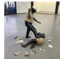
Duane Hanson: Policeman and Rioter, 1967