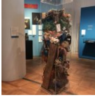
German Cultural Museum: Ocean Trash