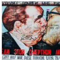
Berlin Wall: "My God help me to survive this deadly love"