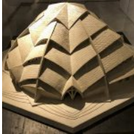
Otto Bartning: Star Church, 1922