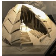
Otto Bartning: Star Church, 1922