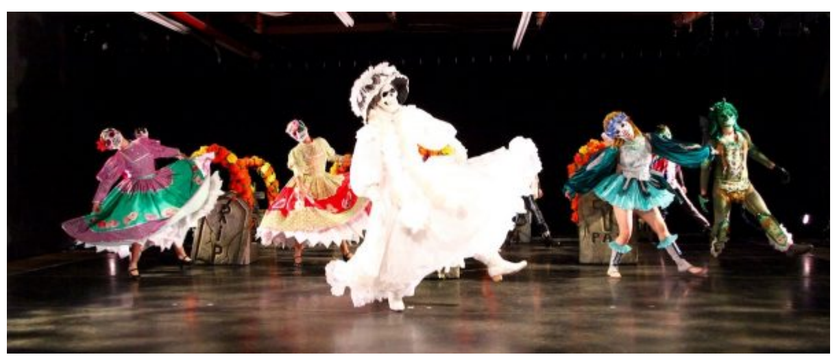
Danza Floricanto/USA's "Dia de Los Muertos (Day of the Dead)".

The long-running, family friendly Fiesta del Día de los Muertos~Day of the Dead Celebration hosted by Danza Floricanto/USA returns as a live performance. At Casa Del Mexicano, Floricanto Center for the Performing Arts, 2900 Calle Pedro Infante, East LA; Sat., Nov. 6, 8 pm, Sun., Nov. 7, 6 pm, $20 at door, $15 pre-sale; $10 seniors & $5 children under 10 at door only. Tickets and Covid protocols at Danza Floricanto.