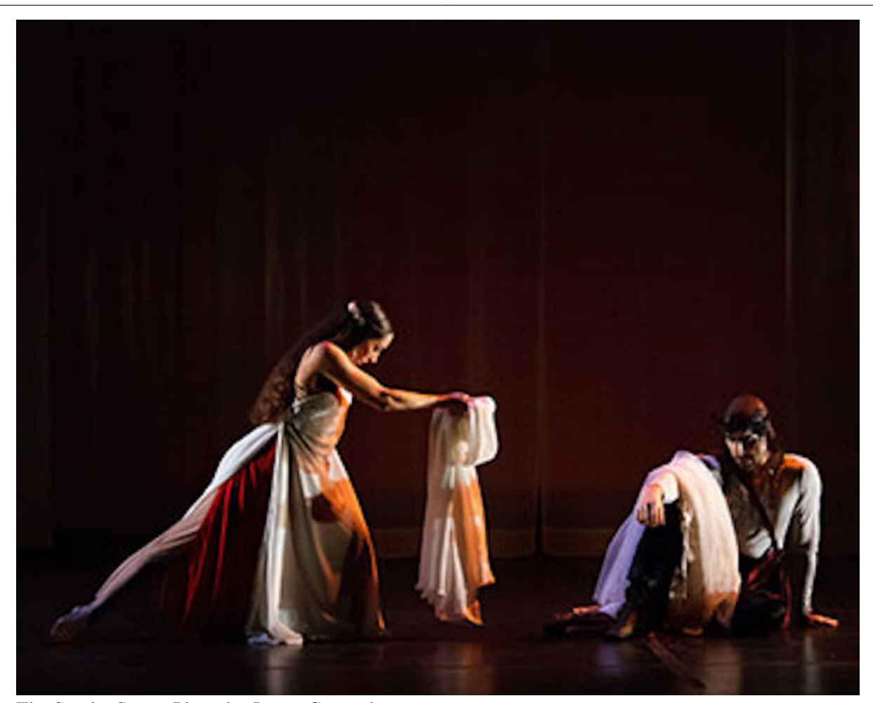
The Scarlet Stone. Photo by James Carmody