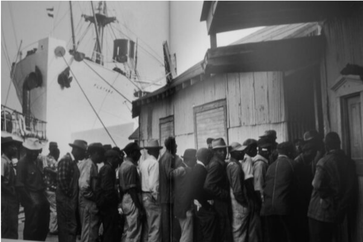
Line up of dock workers