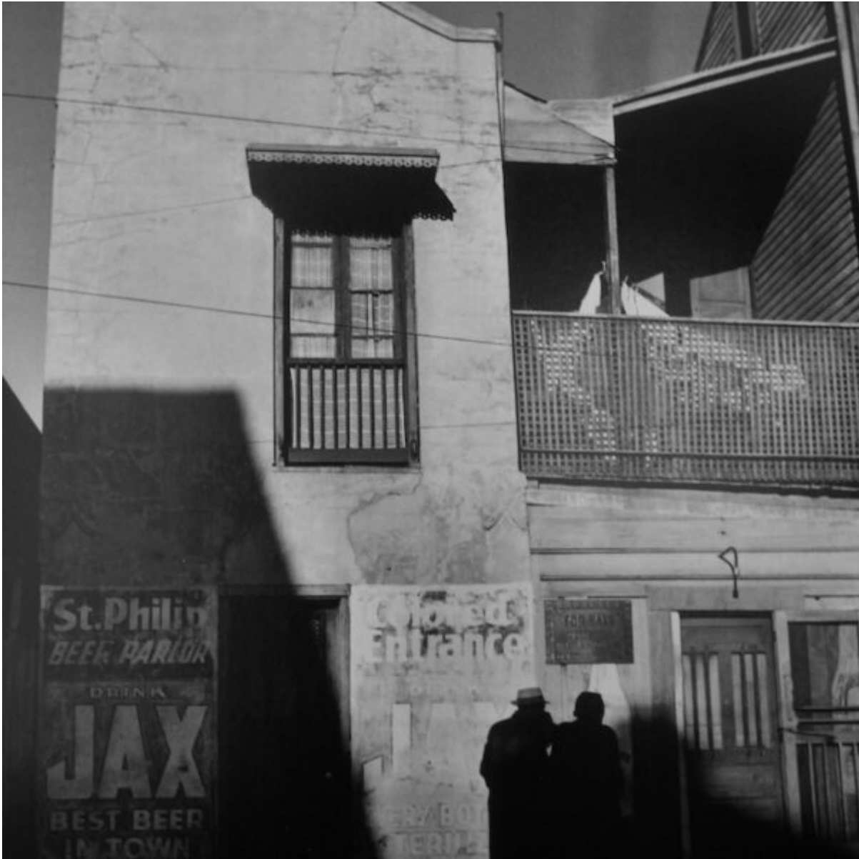
Passing by a Colored Entrance sign

The “Griffin Allwite” advertising sign in an African-American neighborhood train station, dating of 1948 in New York city.