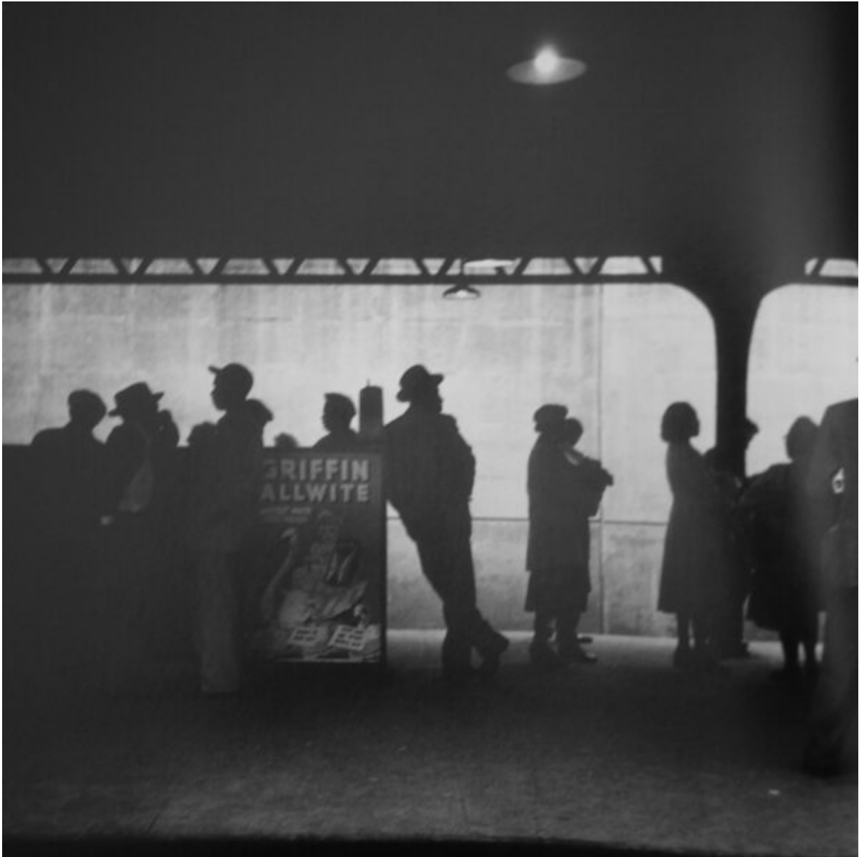
Waiting for the train by an “off color” sign