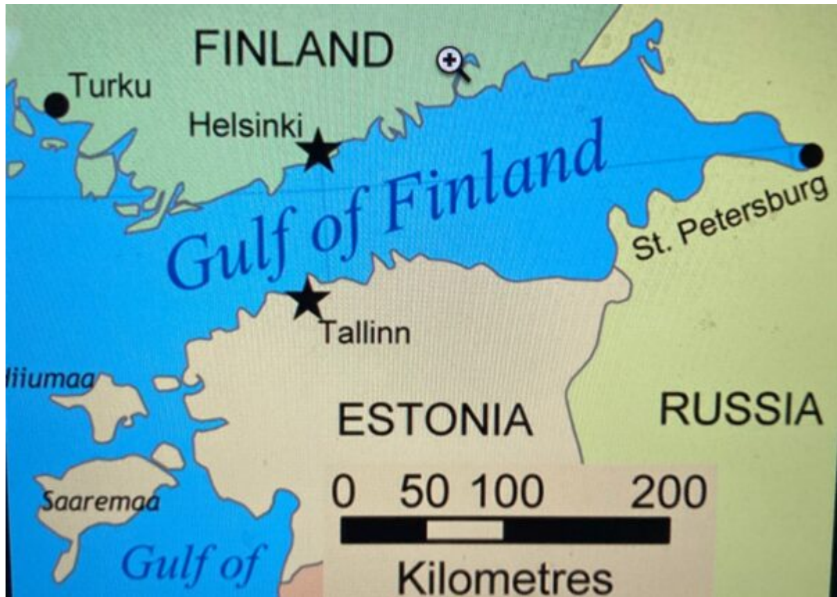
The Gulf of Finland

Nestled at the eastern edge of the Baltic Sea, the Gulf of Finland touches Finland to the North with the southern coast shared by Russia with Estonia to the west. The pending port construction being protested is part of ongoing Russian industrialization to compensate for the loss of half of its ports with the breakdown of the Soviet Union and East European countries like Estonia moving into the European Community. The construction of new ports in the Russian part of the Baltic Sea and the modernization of the port of St. Petersburg have become a government priorities. Construction of new port complexes is especially active in areas like the Gulf of Finland with its geographic potential to aid Russia's ambitions for an expanded transport corridor between Russia and Europe.