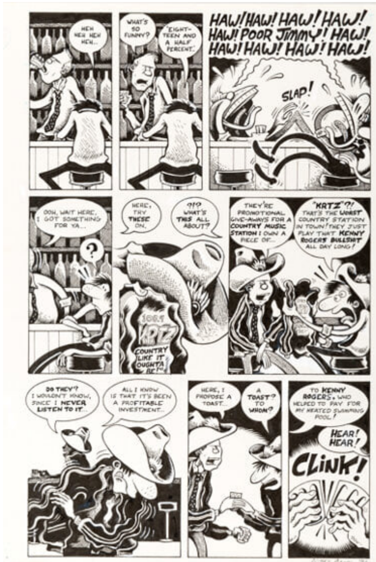
A page from Hate by Peter Bagge

Hate also made crucial, judicious use of sound effects, but instead of bang! or pow! the sound effects carried an inner dimension: A character barging into a room garnered a BARGE! Buddy, smoothing and flattening out some of his prized comics, did so to the sounds of smooth! and flatten! “I always liked both literal or original sound effects. I’m making comics, so I might as well use them, right?”