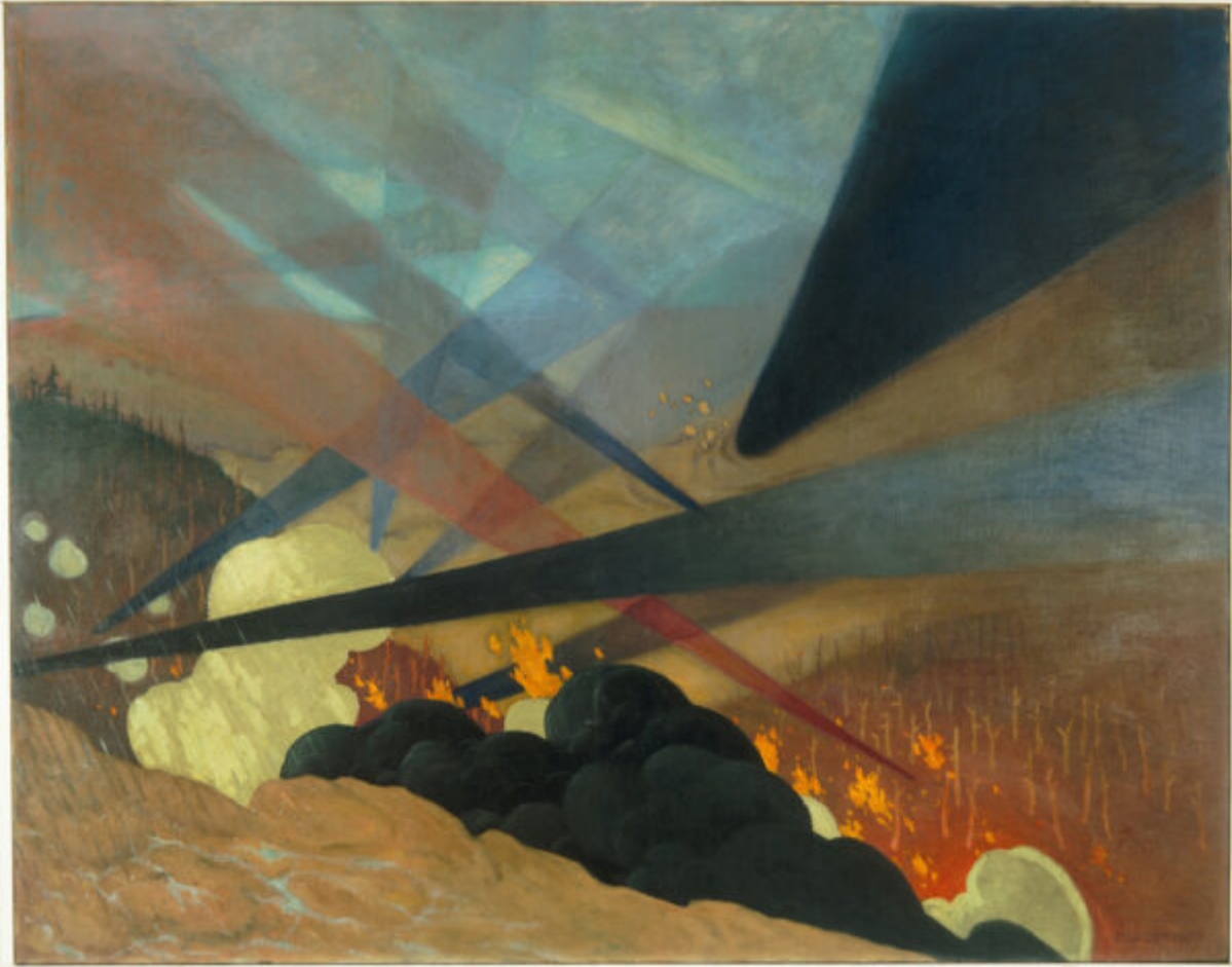
Felix Edouard Vallotton, Verdun , 1917, oil on canvas; Musée de l'Armée, Paris.

Felix Edouard Vallotton's oil painting Verdun of 1917 is far more successful in depicting the true face of war. The forest in the hilly landscape is on fire, thick black smoke billows up from the valley below, and the sky is streaked with red and black and blue trails of incoming artillery shells. It's a hellish scene, but one that's perfectly suited to its modernist style.