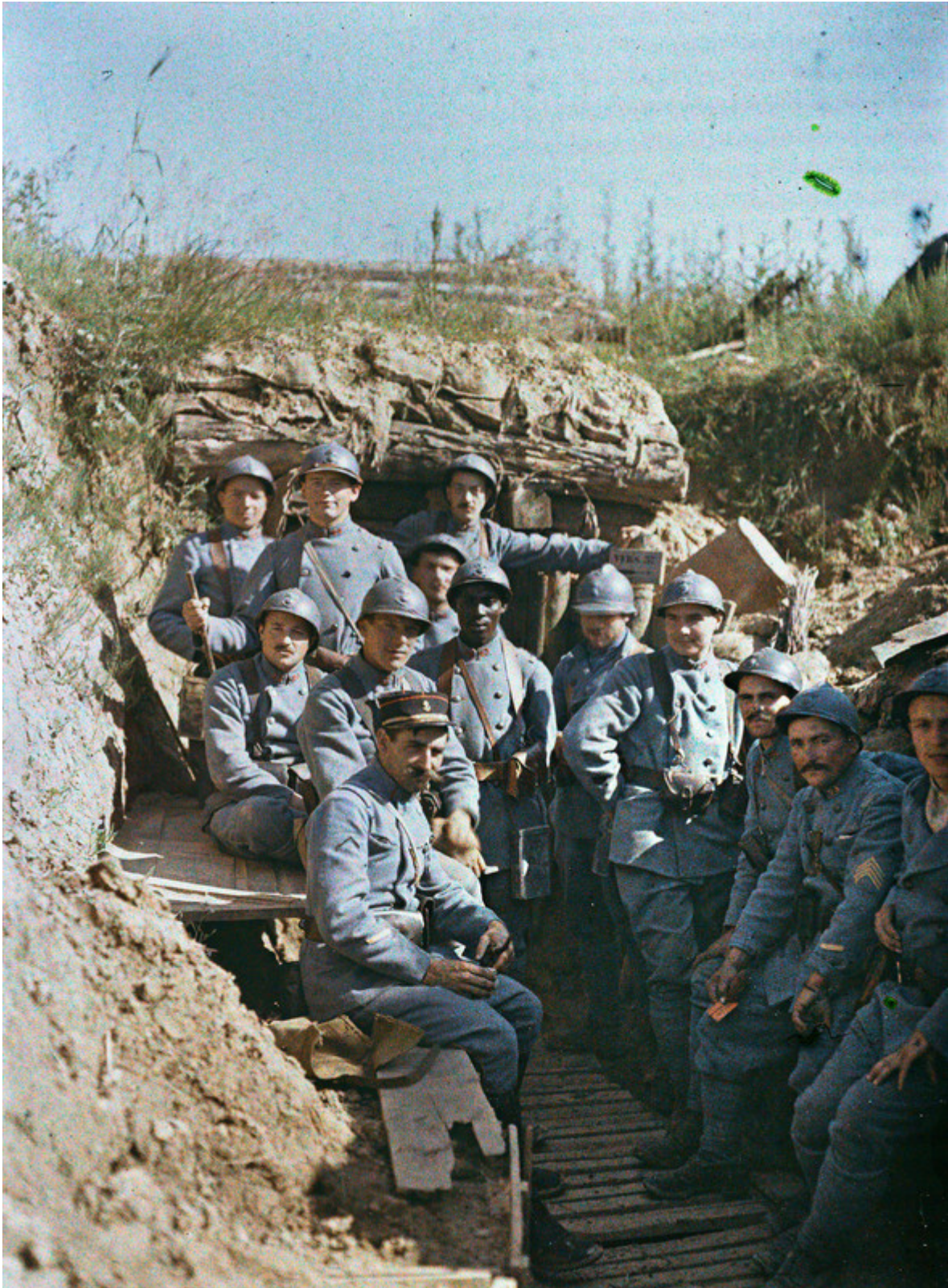
Paul Castelnau, First Line Trench, Hirtzbach Woods, France , 1917, Autochrome (digital file); collection of the Archives de la Planète, Albert Kahn Departmental Museum, Hauts-de-Seine, France.

Most of the war was fought on the ground, of course, and mostly from networks of trenches on both sides of the front line. Unlike some action-packed photographs in the exhibition, however, Paul Castelnau's Autochrome photograph First Line Trench, Hirtzbach Woods, France of 1917, unexpectedly documents a group of French soldiers in the decorous style of a 19th-century group portrait, except for the setting in a trench rather than a men's club.