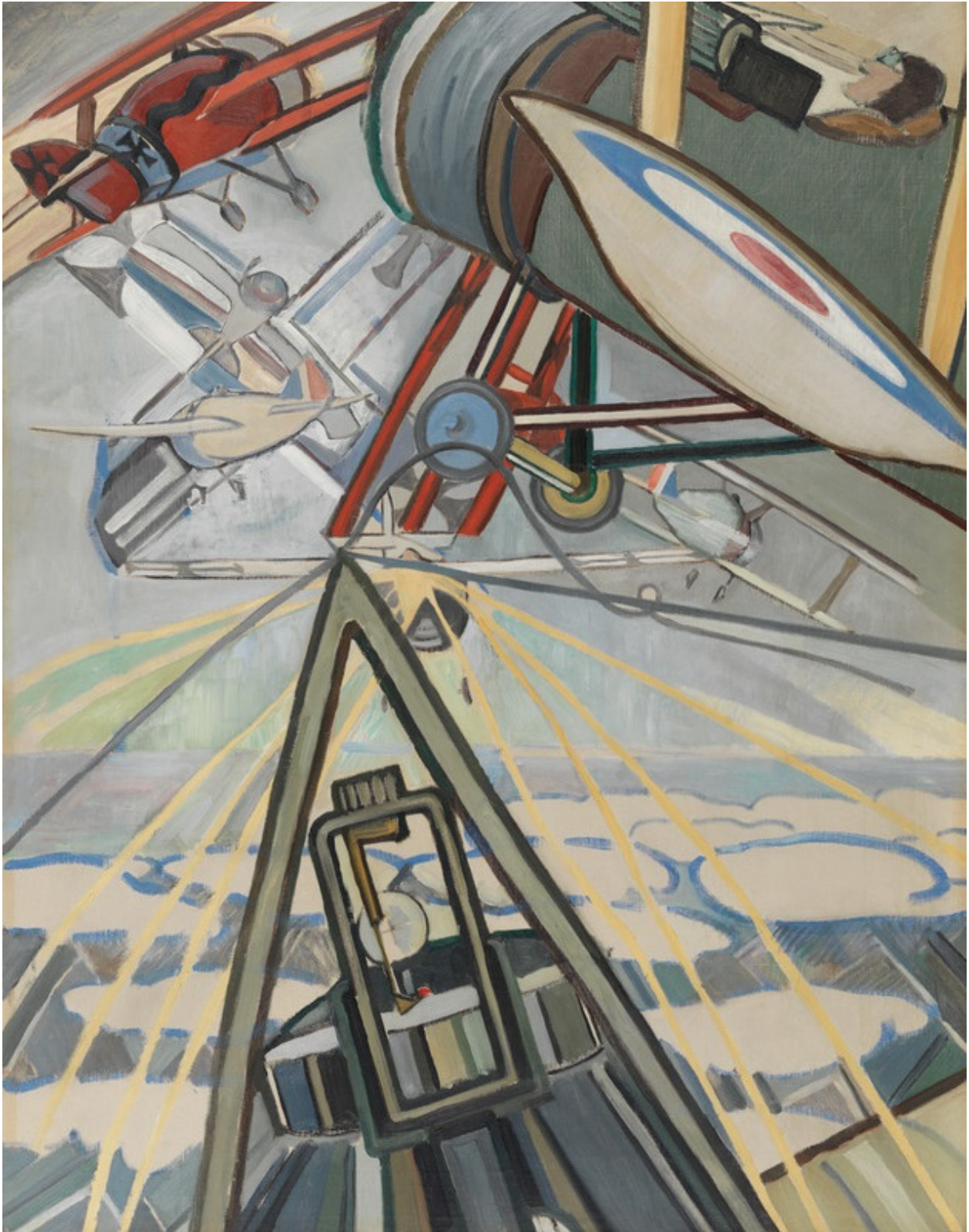
John Armstrong Turnbull, Dogfight , 1918–19, oil on canvas; Canadian War Museum, Beaverbrook Collection of War Art, Ottawa, Ontario, Canada.

John Armstrong Turnbull's Dogfight of 1918-19 (above and detail in top image) captures the chaos and speed of fighter planes in battle, using an angular, modern style that looks similar to German Expressionism and Italian Futurism. The little-known Turnbull, described in the exhibition as a Scottish pilot who was associated with the Vorticist group of artists and the Bloomsbury group of writers, clearly understood how the war was fought high up in the sky. The viewer is placed in the pilot's seat of a British fighter plane as it heads into a snarl of at least five other German or British planes. It's a knockout picture.