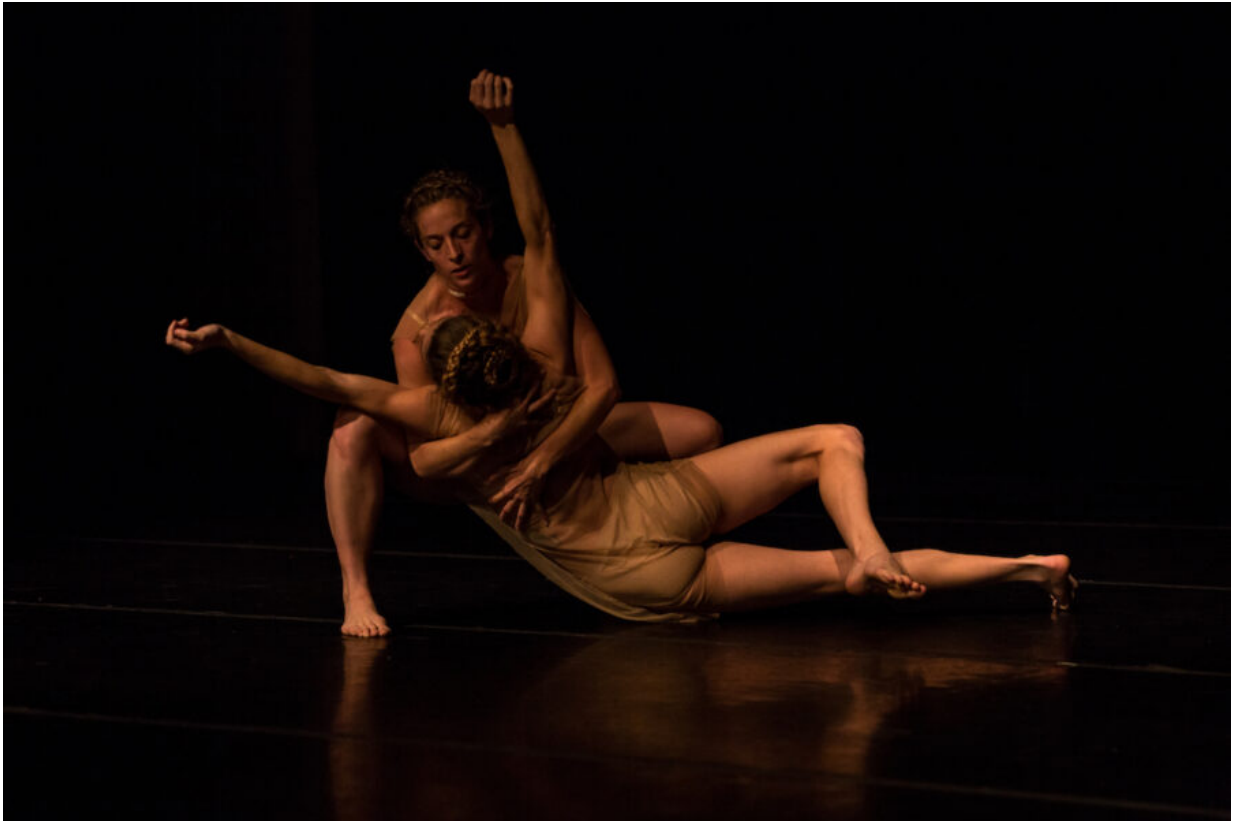
Szalt Dance Company.