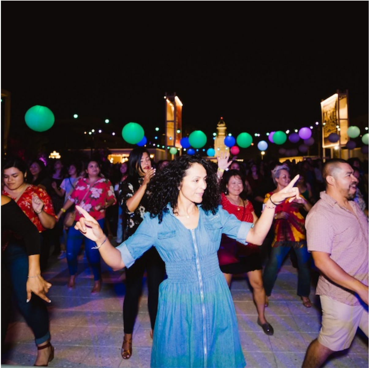
Dance DTLA.