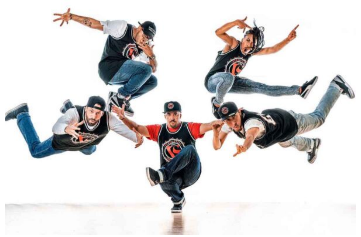
Versa-Style Dance.