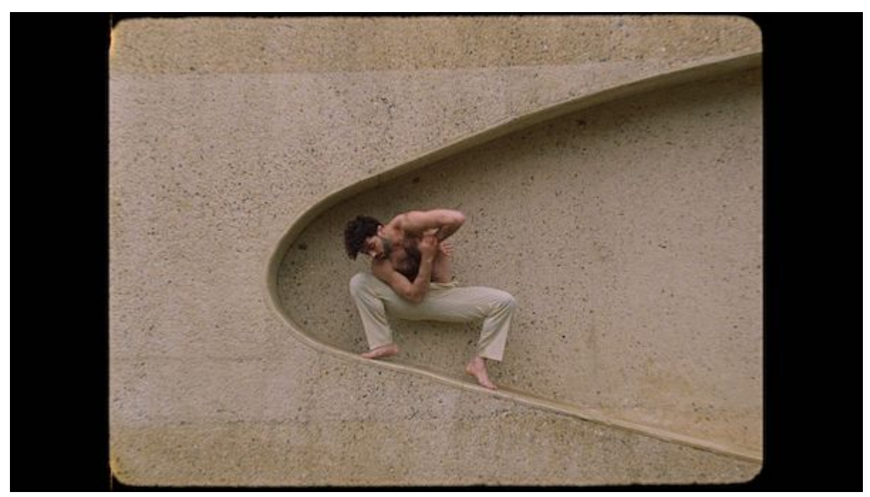
"Films.Dance Round 2."

dance, dancers, and filmmakers from around the world. The original films, a preview, and e-mail sign up for free weekly film delivery at Films.Dance.