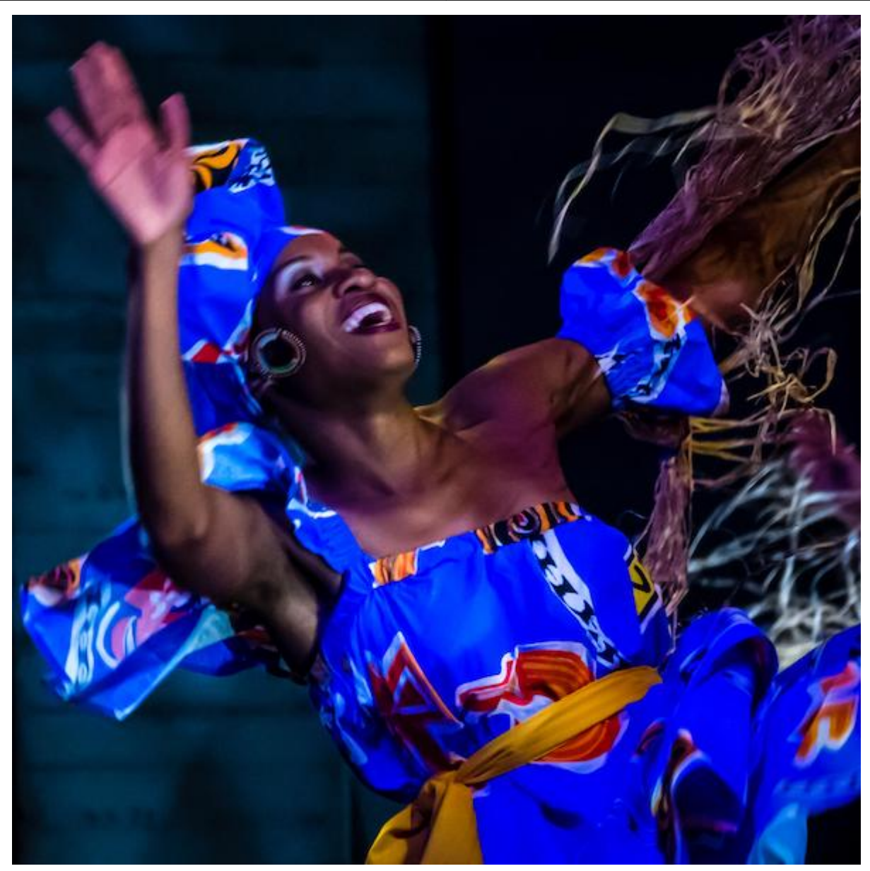
Viver Brasil.