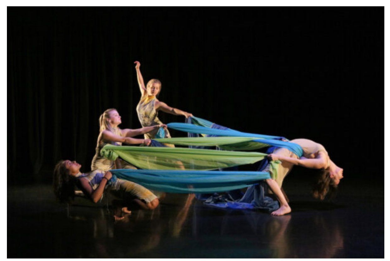
Lineage Dance.