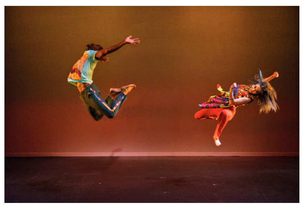
CONTRA TIEMPO's "joyUS justUS".

LA's Latin dance company CONTRA-TIEMPO performs joyUS justUS with music by Las Cafeteras. The event is online as part of the 3-day NALAC (National Association of Latino Arts & Culture) national Latinx summit. Fri., Oct. 1, 11:10-11:30 am, free. Info at CONTRA-TIEMPO.