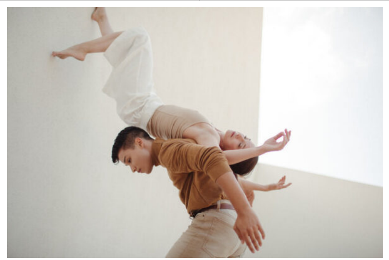
Backhaus Dance.