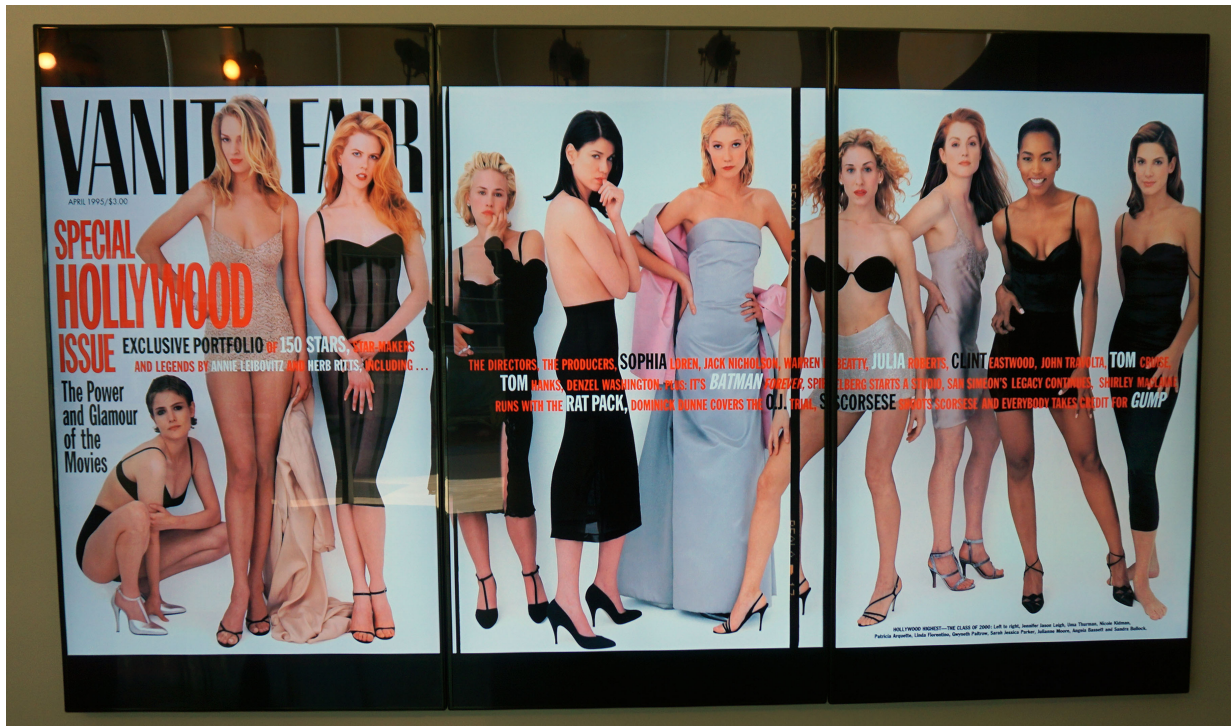
Vanity Fair 1995

Banderas and Dafoe are interviewed in the video, as is Jennifer Hudson, who says, “This almost feels like making a movie.”