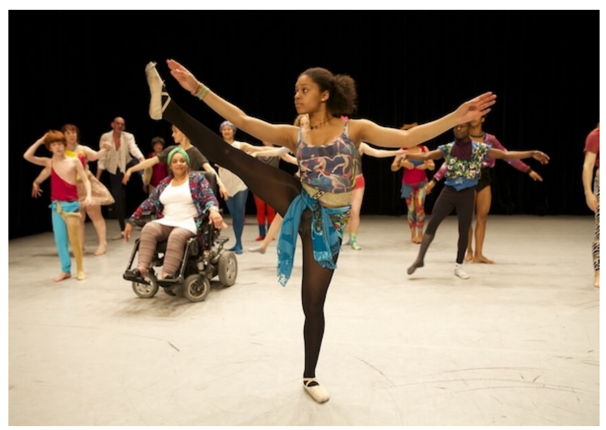
Jérôme Bel.