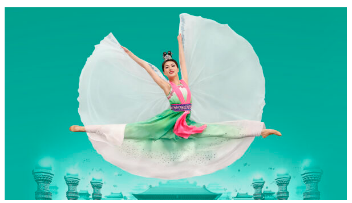
Shen Yun.

The touring show showcasing a view of China culture pre-communism, Shen Yun , arrives at Hollywood's Dolby Theatre. Details on this and upcoming SoCal performances at Shen Yun.