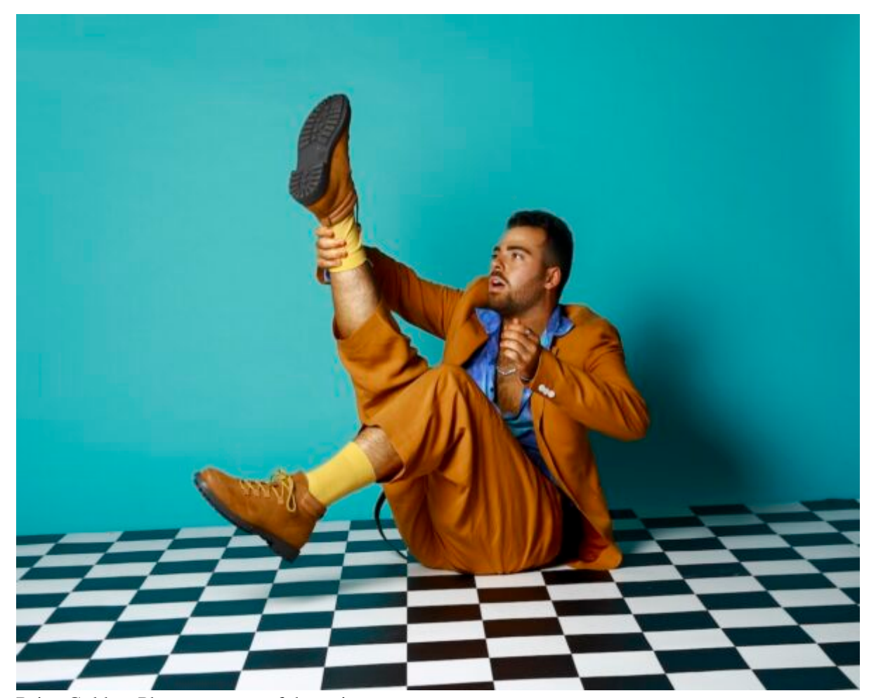
Brian Golden.