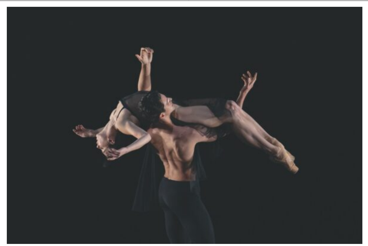
American Ballet Theatre in Woolf Works.