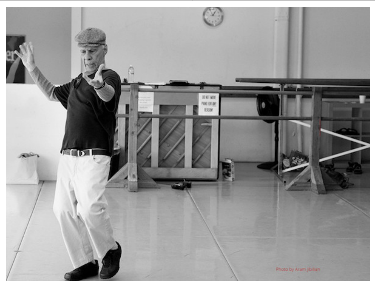
Rudy Perez.