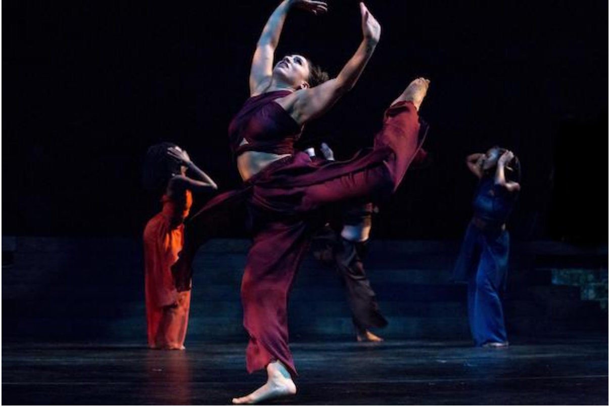
Viver Brasil.