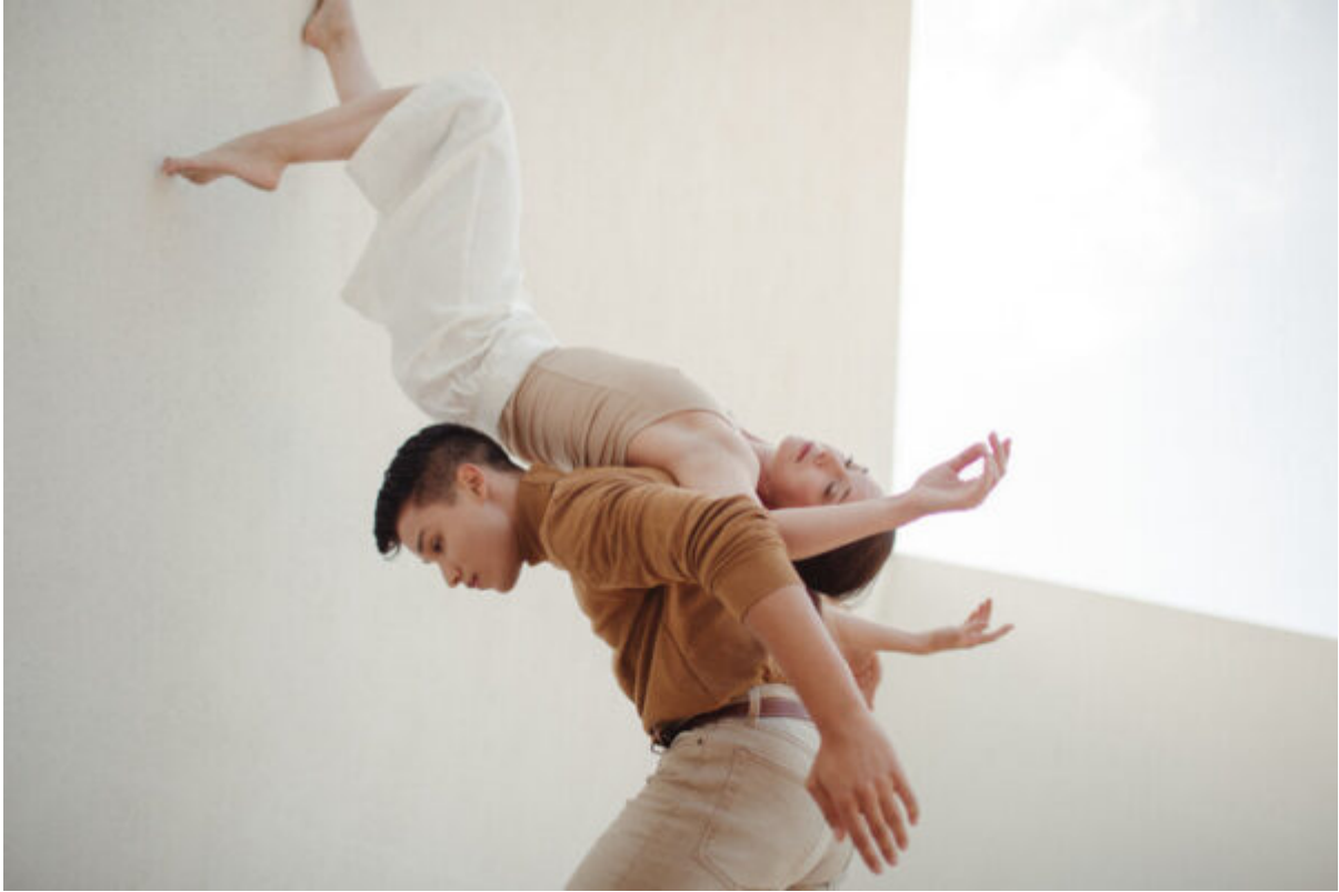
Backhaus Dance.