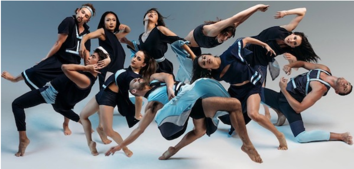
Entity Dance.