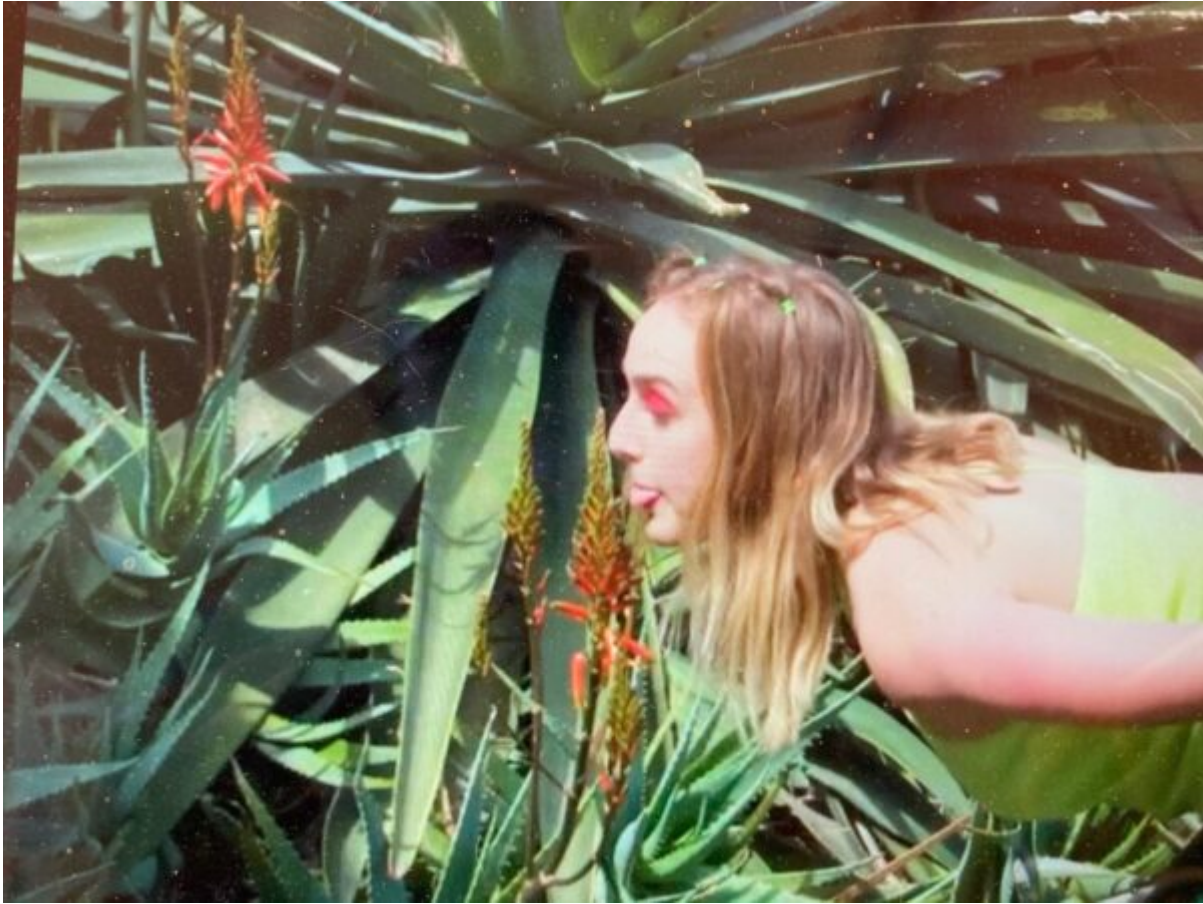
Rosanna Gamson/WorldWide.

Plague , what could be more appropriate pandemic source material than Boccaccio's Decameron with tales from ten strangers sheltering from the bubonic plague? Just as the tales of the ten travelers unfold one at a time, Gamson's The Decameron Project rolled out ten films, each made by a different artist. Viewable for free on RGWW and on Instagram .