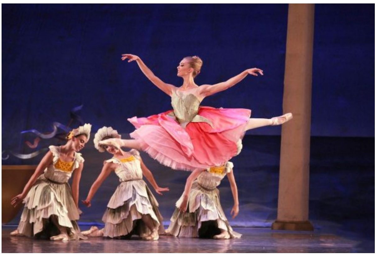
Los Angeles Ballet's "Nutcracker".

• Los Angeles Ballet at Redondo Beach Performing Arts Center; Los Angeles Ballet