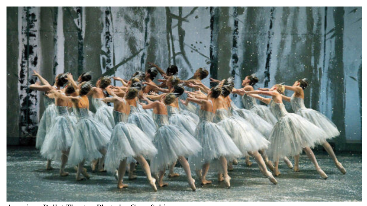
American Ballet Theatre.

• American Ballet Theatre at Segerstrom Center for the Performing Arts, Costa Mesa; SCFTA