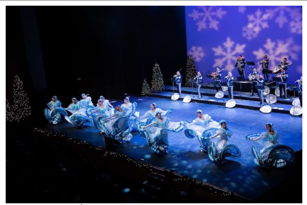
Ballet Folklórico de Los Ángeles.