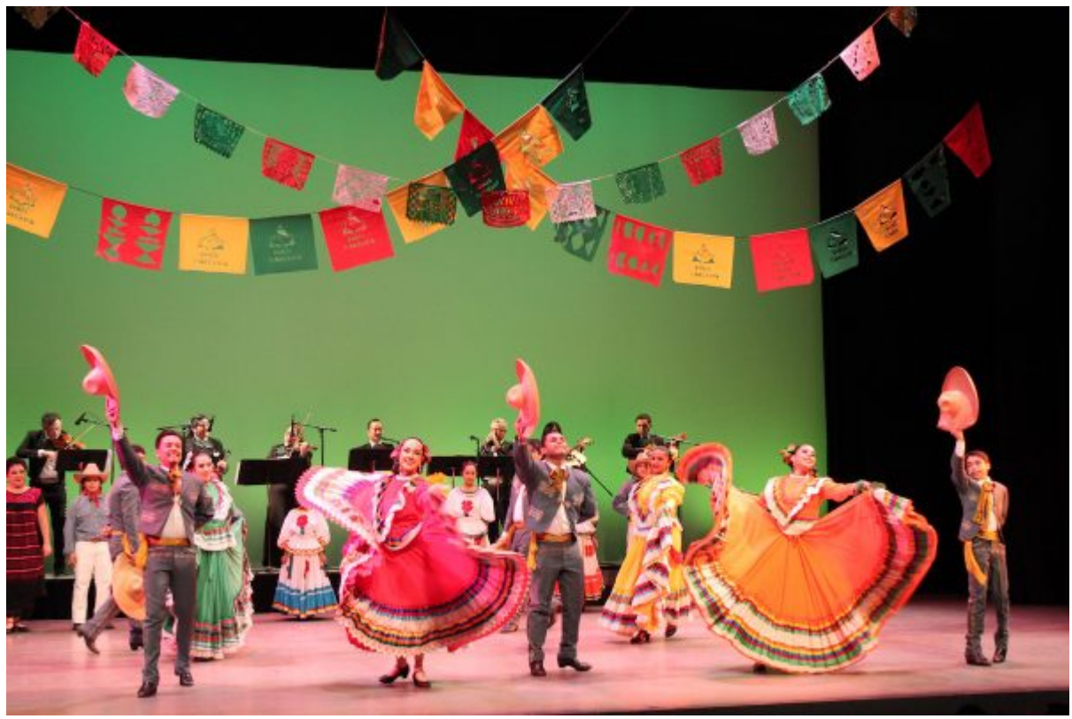
Danza Floricanto/USA.

Danza Floricanto/USA Navidad en el Barrio . Casa del Mexicano, E.LA; Sat., Dec. 18, Danza Floricanto or 213-466-2611.