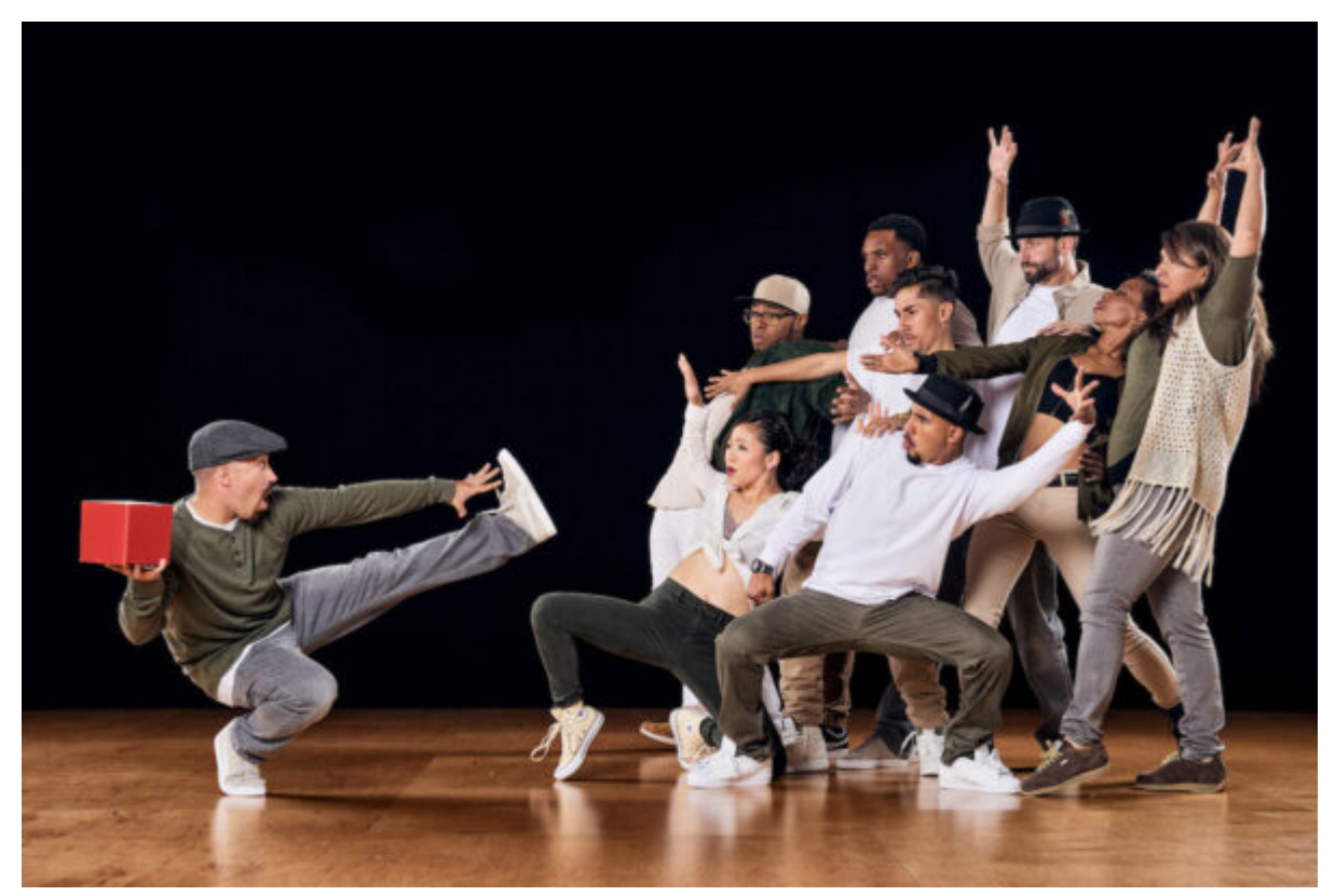
Versa Style Dance Company.