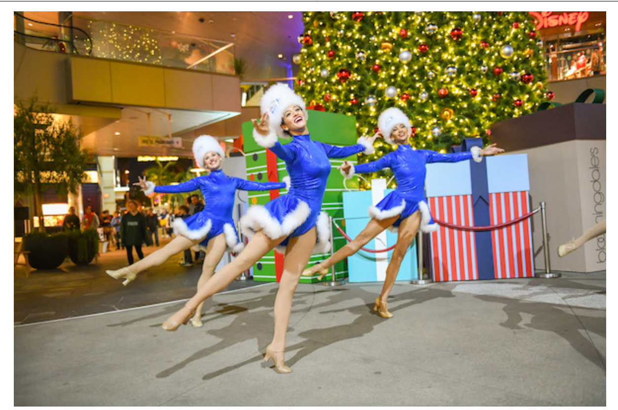
The Beach Belles.