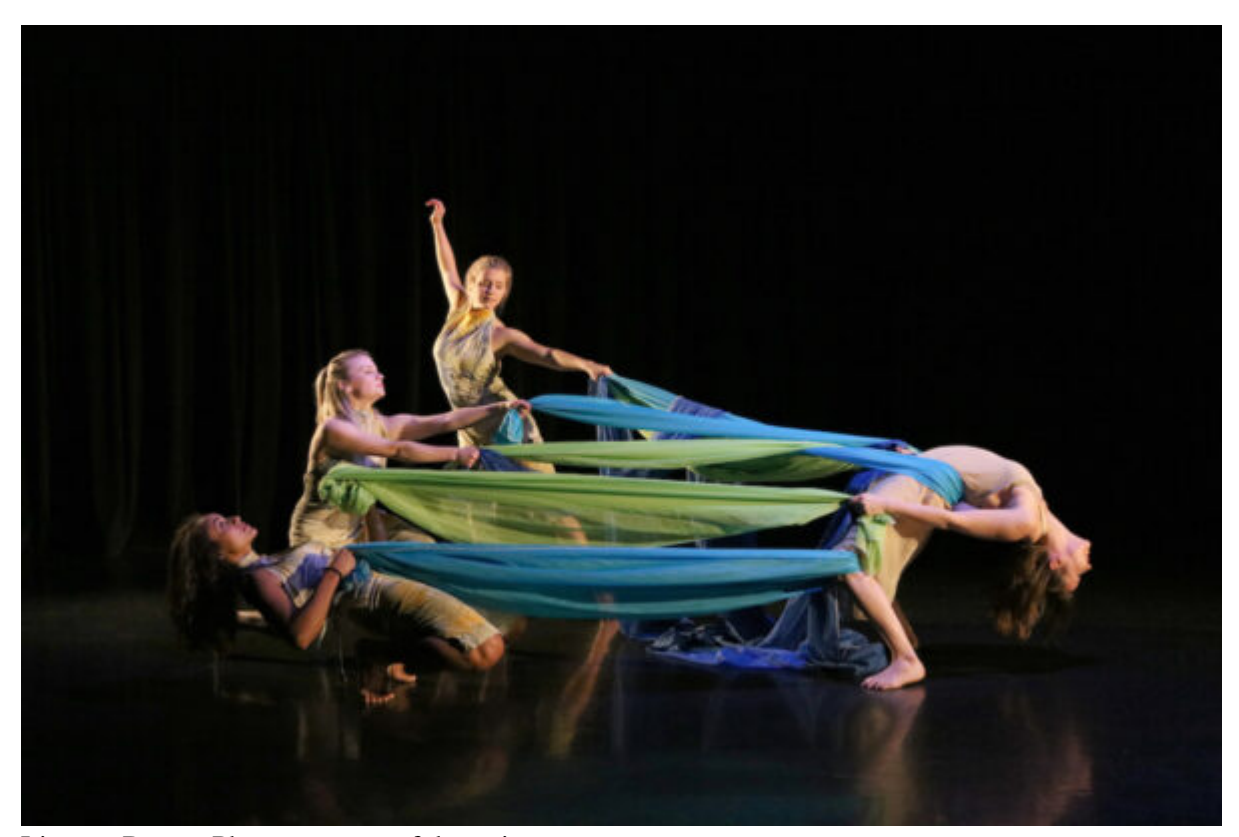
Lineage Dance.

Actors, musicians, and the dancers of Lineage Dance Company take the stage in the Third Annual Lineage Follies . Performers include individuals with neurological diseases and the evening includes a panel with several neurology experts. Lineage Studios, 920 E. Mountain St., Pasadena; Sun., Dec. 12, 5 pm, $10. Info, tickets & Covid protocols at Lineage Dance Company.