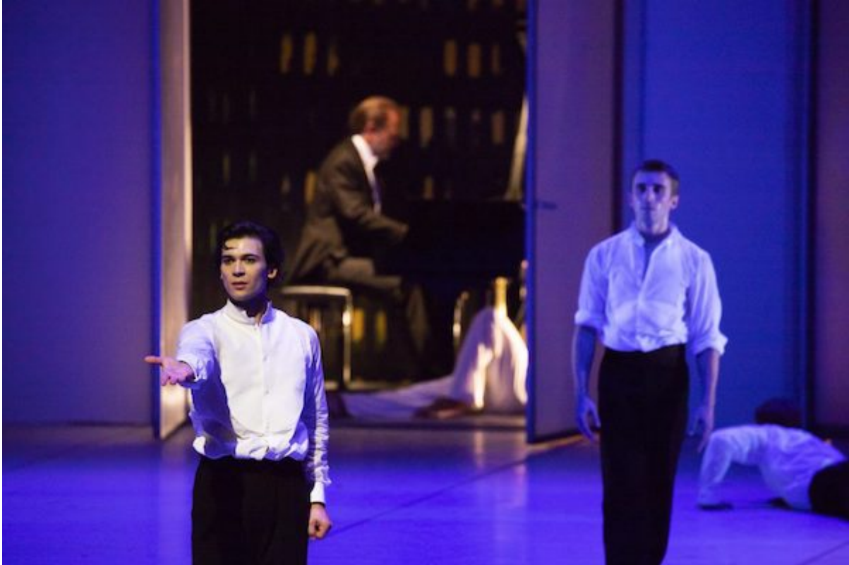
Hamburg Ballet's "Bernstein Dances."

Hamburg Ballet with LA Opera in St. Matthew Passion at Music Center Dorothy Chandler Pavilion, 135 N. Grand Ave., downtown; Sat., March 12, 7:30pm, Thurs, March 17, 7:30pm, Sun., March 20 & 27, 2pm, Sat., March 26, 7:30pm, $23-$292. LA Opera .