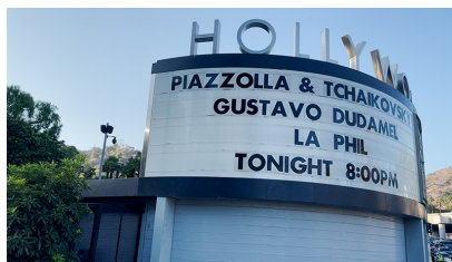
Concert's Sign at the Bowl