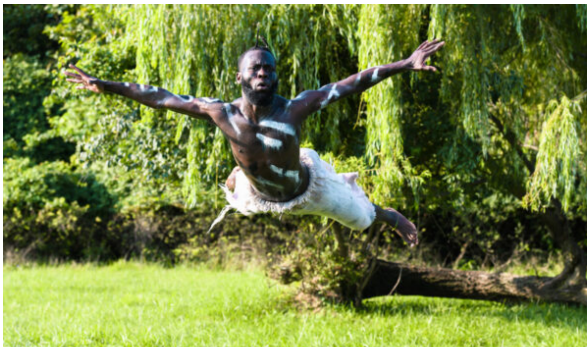
Step Afrika!

Step Afrika! At Luckman Fine Arts Complex, Cal State University Los Angeles, 5151 State University Dr., East LA; Sat., Feb. 18, 8 pm, $25-$50. Ticketmaster .