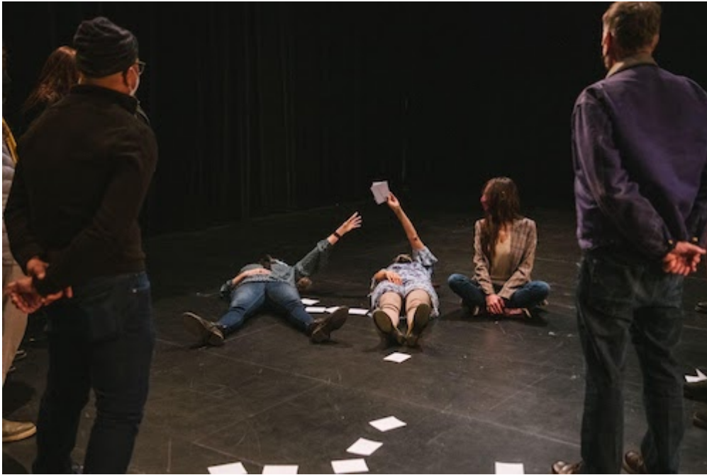
600 Highwaymen.