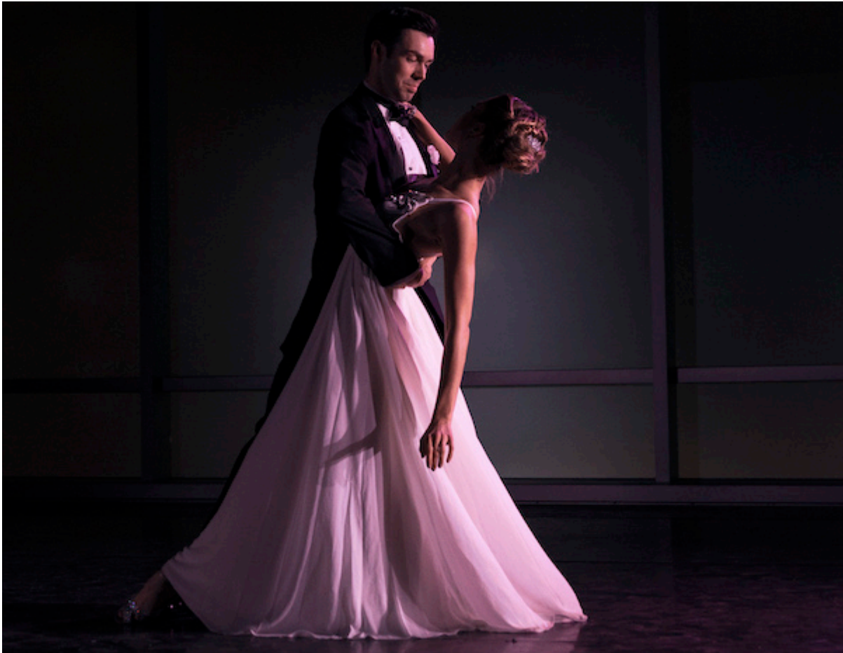
American Contemporary Ballet.