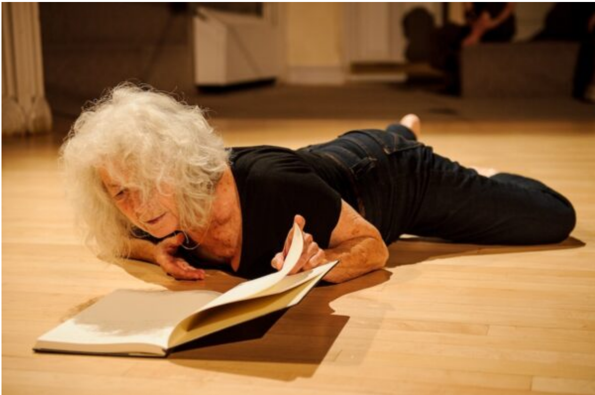
Simone Forti.

The Obie award-winning duo Abigail Browde and Michael Silverstone aka 600 Highwaymen bring the final weekend of immersive performance under the distinctively unwieldy title A Thousand Ways (Part Three): An Assembly . Described as experimental theater creations, each roughly one hour event draws on elements of dance, performance, and civic engagement as each audience of 16 people read from assigned cards before being drawn in further, becoming part of each singular performance. UCLA Royce Hall Rehearsal Room, Royce Hall, Sat.-Sun., Feb. 11-12, noon, 1:30, 3pm, 4:30, 6 & 7:30pm. $29.97. CAP UCLA .