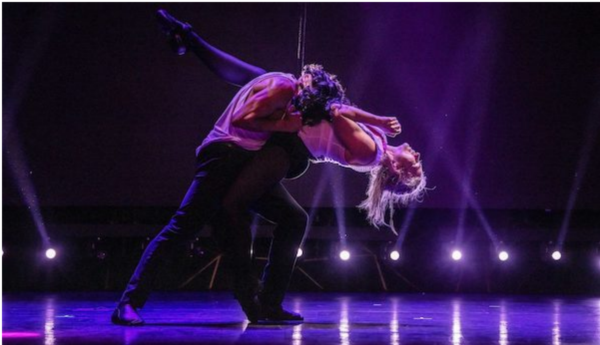
Luminario Ballet.

Luminario Ballet at the Wallis, 9390 N. Santa Monica Blvd., Beverly Hills; Fri.-Sat., Feb. 17-18, 7:30 pm, Fri., $10 or pay what you can; Sat. $25-$79. The Wallis .