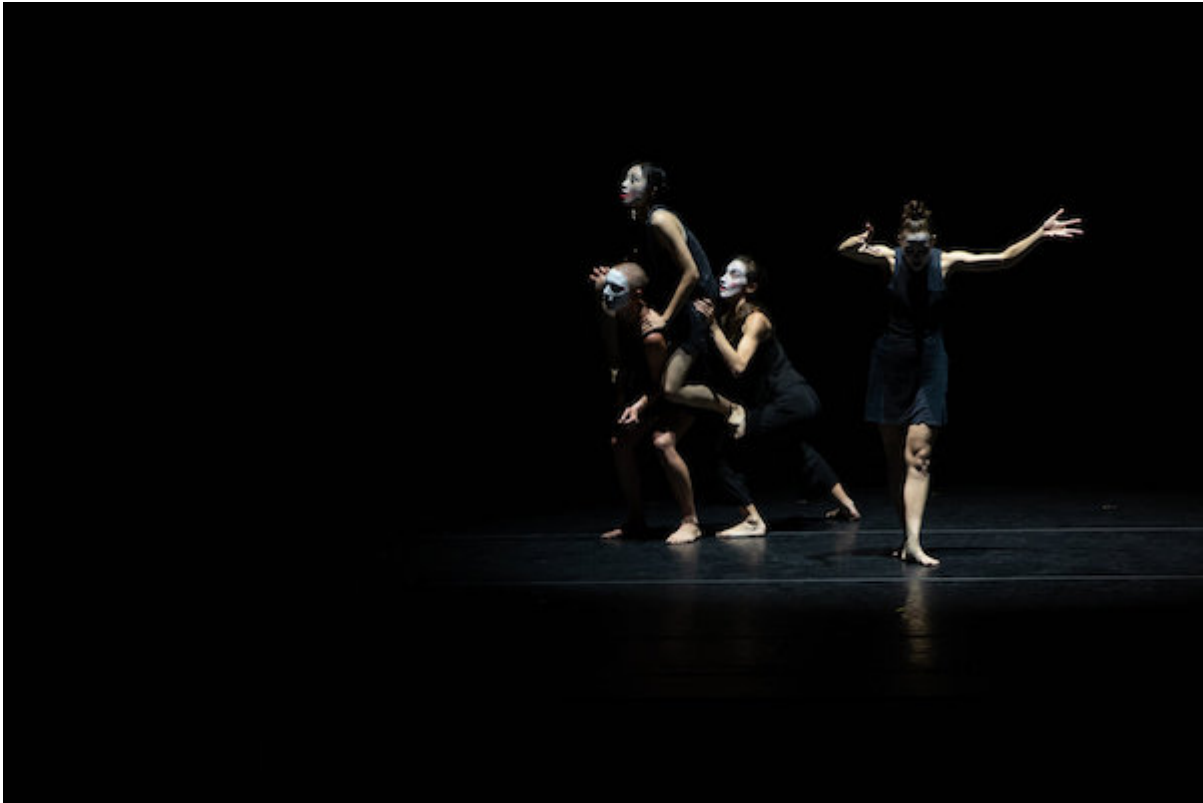
Rosanna Gamson/World Wide.