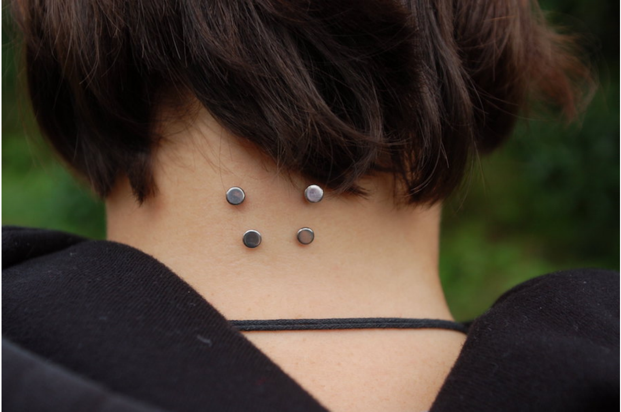
Unusual piercings