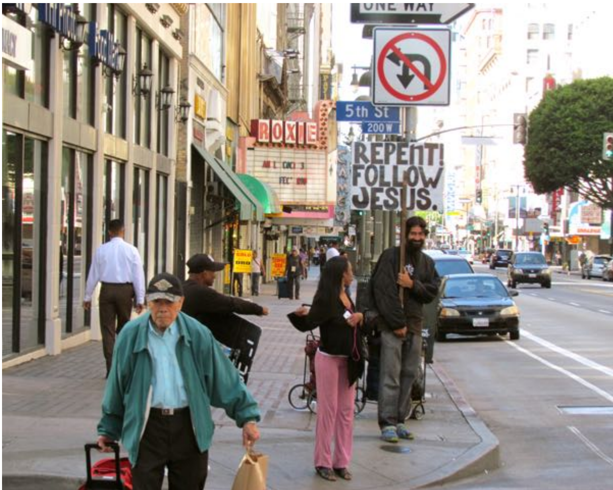
"Repent! Follow Jesus"

I've always known that my beloved Los Angeles has a dark, gritty side. But until I moved downtown in May of 2013, I never understood the poetry of these mean streets. I was bombarded with semiotics; the study of signs and symbols and their use or interpretation. As a poet, I paid close attention. As a photographer, I began to connect the text with the DTLA surroundings. When a friend pronounced the results "semiotic," I began documenting in earnest. Here are just a few of those photos.