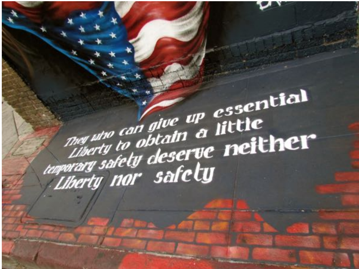
“They Who Can Give Up”