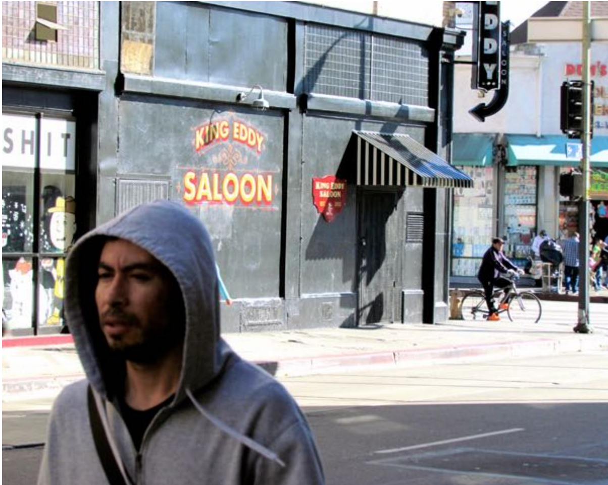
“King Eddy’s Saloon”

This entry was posted on Wednesday, February 18th, 2015 at 3:05 pm and is filed under Photography , Discourse , Lifestyle , Visual Art