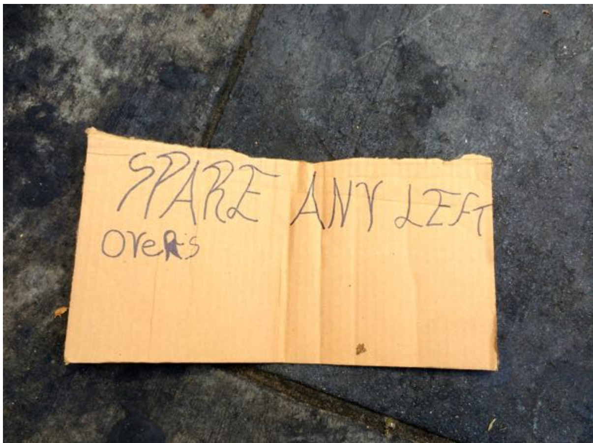
“Spare Any Left OveRs”