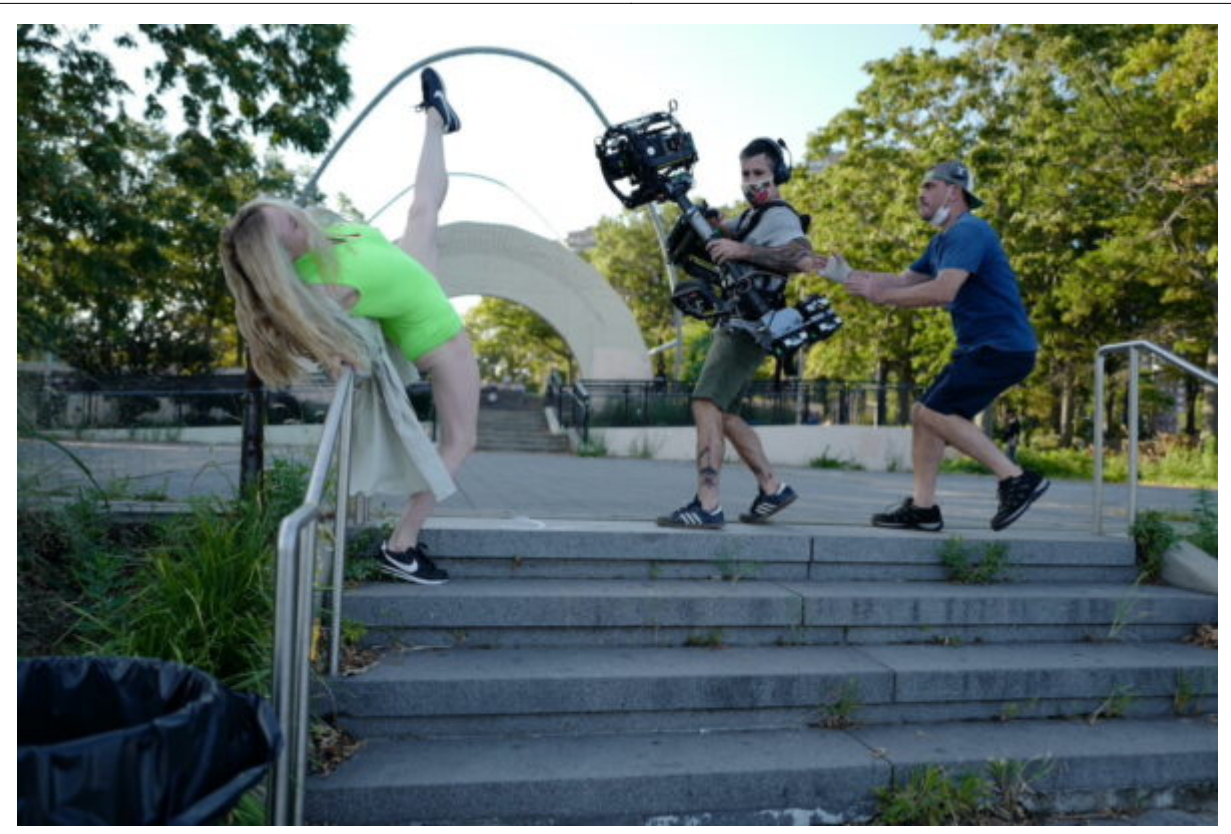
Films.Dance's "ANOTHER SERIOUS DANCE FILM."