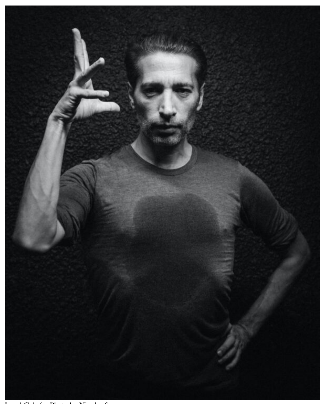
Israel Galván.