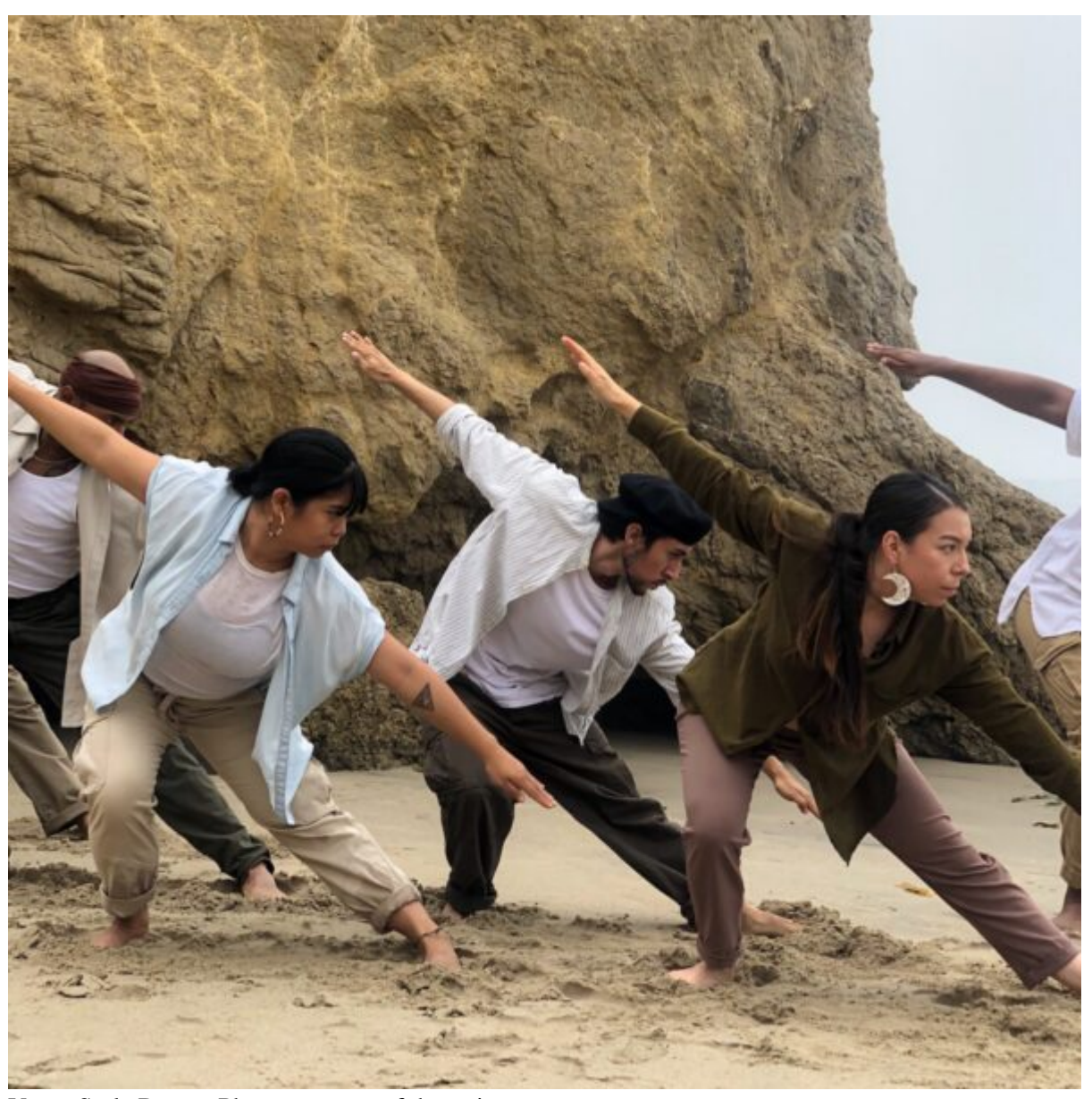
Versa-Style Dance.

parks, alleys, and an empty business street. Free online at Music Center.