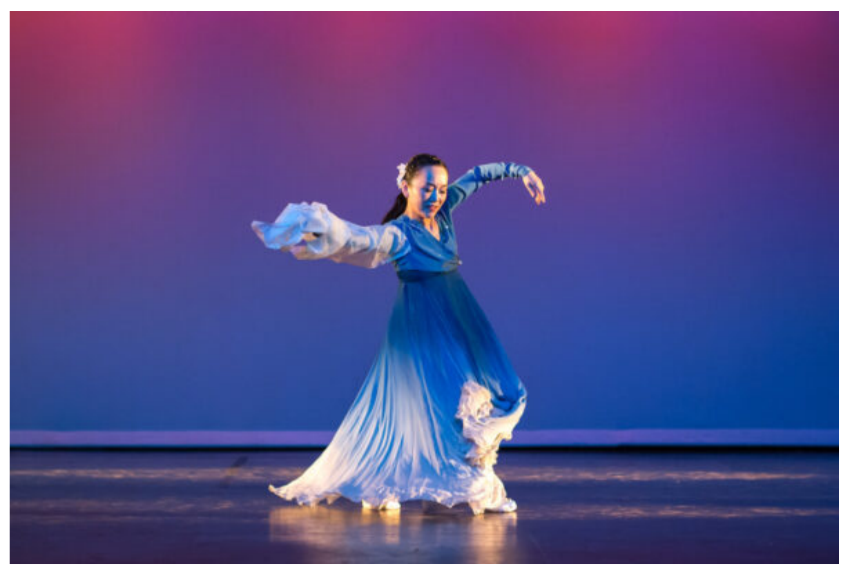
LA Women's Theatre Festival.