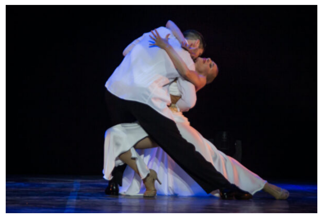
Tango The Musical by Sergei Tumas.